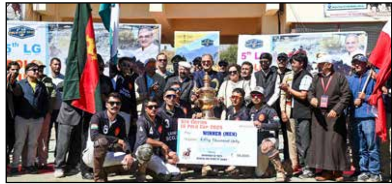
Reach Ladakh Correspondent

If you are genuinely dedicated to your practice, opportunities will eventually come your way. Art requires patience, perseverance, and belief in yourself. My advice to aspiring artists is to stay committed, keep learning, and never lose the curiosity that first drew you to art. With sincerity and dedication, your efforts will open doors and create pathways you may not have imagined.