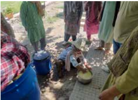
Photo Caption: Demonstration on Jeevamrit preparation to the farmers of Ladakh.