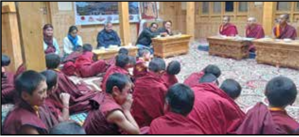
Photo Caption: Participants during the 5th edition of the Ethical & Educational Exchange Programme at Shachukul Monastery.

Focus on integrating traditional wisdom with modern pedagogy for Ladakh’s future curriculum