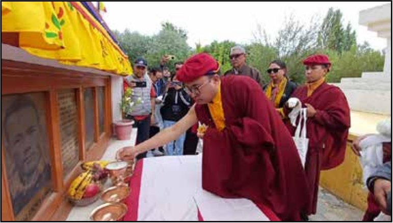
Photo Caption: His Eminence Liksey Khamtak Rinpoche lighting up the butter lamp and paying tribute to the martyrs.