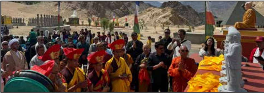
Photo Caption: Consecration of the Six Guardians of Peace—Roku Jizō statues—at the Buddha Park, Mahabodhi International Meditation Centre (MIMC), Leh.

Event opens with dedication of Roku Jizō statues, focus on harmony and climate action