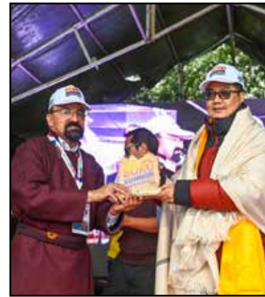
Photo Caption: Union Minister for Parliamentary and Minority Affairs Kiren Rijiju with CEC, LAHDC Kargil, Dr. Akhoon at Suru Summer Festival.

In addition to the technical training, farmers were also briefed on various departmental schemes available to them, with the goal of encouraging them to leverage government support for their agricultural ventures.