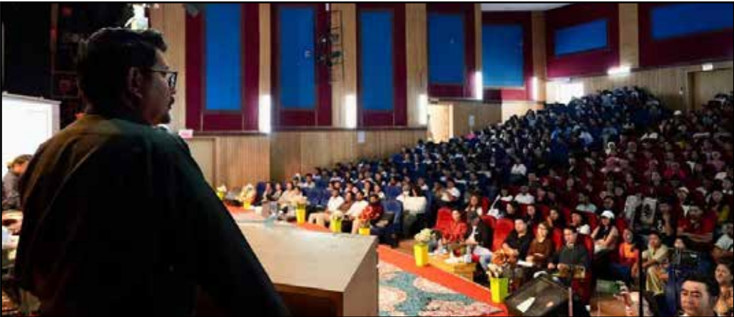
Photo Caption: CEC addressing the gathering during the inauguration of Council’s Free Coaching Classes for LAHD-SSRB and LSSSSB aspirants.

The meeting was attended by Deputy Commissioner/CEO LAHDC Leh, Deputy Commissioner/CEO LAHDC Kargil, Senior Superintendent of Police Security, SSP Leh and Kargil, Director Social Welfare Department UT Ladakh, Director Rural Development and Panchayati Raj UT Ladakh, Director Tourism UT Ladakh, Director Health and Medical Education UT Ladakh, Director Information UT Ladakh, Joint Director Hospitality and Protocol, Joint Director Food UT Ladakh, Regional Transport Officer UT Ladakh, Superintendent of Police Traffic UT Ladakh, Joint Director PD&MD UT Ladakh, and a representative from ITBP.