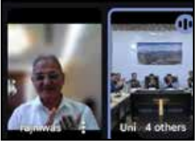
Photo Caption: L-G speaking virtually at the event—jointly organised by the University of Ladakh, LAHDC Leh, and the Space Applications Centre (SAC), ISRO Ahmedabad.

Releases LAMA Web Portal at University of Ladakh