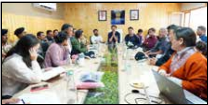
Photo Caption: During the preparatory meeting for the upcoming 3rd edition of the Climate Cup Football Tournament 2025.

The District Institute of Education and Training (DIET) Leh reaffirmed its commitment to continue such initiatives, aimed at empowering students with essential skills and ensuring holistic development in line with the vision of NEP 2020.