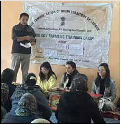
Reach Ladakh Correspondent