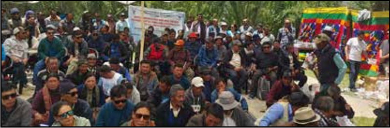
Participants during the awareness programme on scientific management of yaks in Nubra.

‘Matho Youth Welfare Association’ Leh UT Ladakh