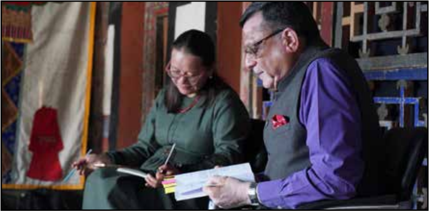
Pramod Jain, IAS (Retd.), noted poet and Chairman of the New Districts Committee, UT Ladakh at poetry recitation event.

Sheikh Ibrahim Khalili acknowledged the support of all stakeholders and volunteers, announcing that the campaign had already exceeded its initial target, with over 1.25 lakh saplings planted across the district—marking a significant milestone in the region's environmental journey.