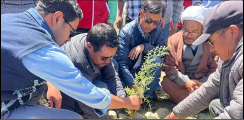
Planting of indigenous tree species at Government Degree College (GDC) Zanskar.

The initiative marks a meaningful step forward in balancing ecological preservation with community well-being and serves as a model of collaborative conservation in the Kargil region.