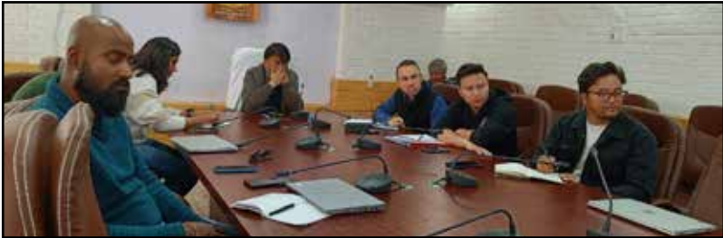
During the preparatory review meeting on the upcoming Suru Festival 2025.

Dream big—but prepare smart. Don’t let your background or limited resources hold you back. Make the most of what you have, build a strong support system, and seek guidance whenever possible. Believe in yourself, stay patient, and don’t give up after a few setbacks. If someone from a small village like Choskore Panikhar can achieve this, so can you.