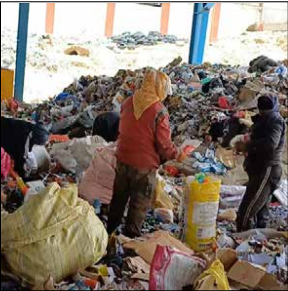
Workers segregating the waste manually before running in machines at Solid Waste Management Plant at Skampari, La Sermo.

"We separate cardboard, tins, Tetra Packs, plastics, bottles, and clothes before running the recyclables through machines