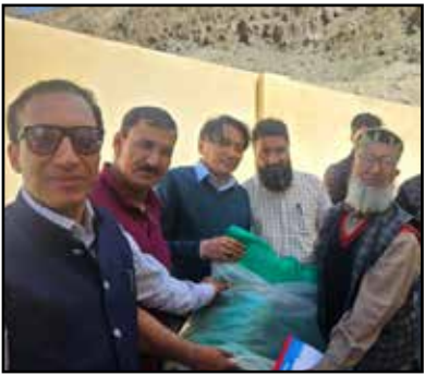
Fish farmers getting equipment.

The purpose of the tour was to enhance students' understanding of local history while training them in the scientific approach to field surveys and primary data collection.