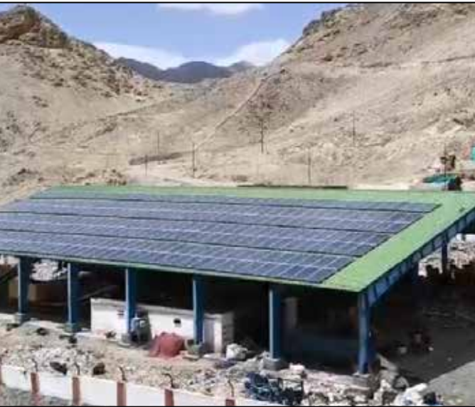
The 100 KW Solrised Solid Waste Management Plant at Skampari La Sermo.