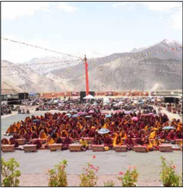
His Holiness the 37th Drikung Kyabgon Chetsang Thinley Lhundup commenced 5-day Drikung Snake Year Teachings on May 27 at Lamayuru Monastery Photang. The teaching saw devotees from all across Ladakh as well as across globe, for a spiritual experience.