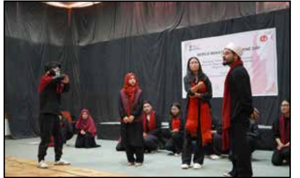
World Menstrual Hygiene Day : Students from the University of Ladakh, Leh campus performing Nukkad-Natak (street play).

The meeting was attended by the Regional Transport Officer, Chief Accounts Officer, Deputy Secretary (Transport), and Public Law Officer of the Transport Department, UT Ladakh.