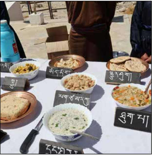
Government Higher Secondary School Tangtse hosted its first-ever Food Festival on May 26, showcasing the rich and diverse culinary heritage of Ladakh. The vibrant event brought together students, staff, and community members in a spirited celebration of traditional Ladakhi cuisine, with dishes representing all regions of Lalok.