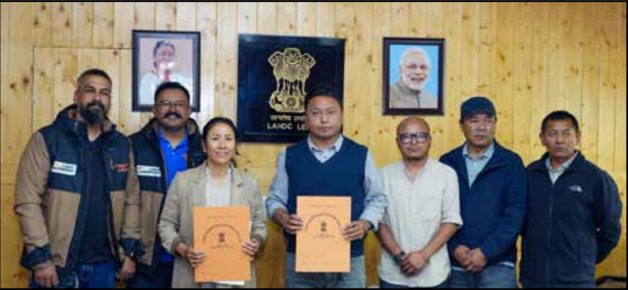
LAHDC, Leh, signed a Memorandum of Understanding (MoU) with the Headlight Foundation to establish language laboratories in schools across Ladakh.