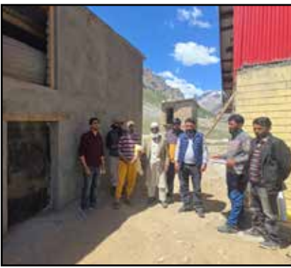
Handing over of bear-proof corral to the residents of Azuri Village, Pandrass.

Principal of Government High School Minjee expressed heartfelt appreciation to DDAC, IKMT, JUIAK, and the Education Department for their proactive efforts in engaging with students and steering them towards a healthier, drug-free future.