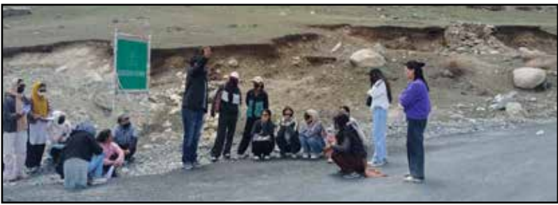
Students of Government Degree College (GDC) Zanskar during Historical and Archaeological Tour to Rangdum Monastery.

The visit reflected a proactive approach towards improving healthcare infrastructure and services in the district.