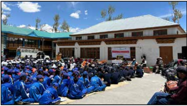
Students from various schools across Zanskar participating in the awareness program.