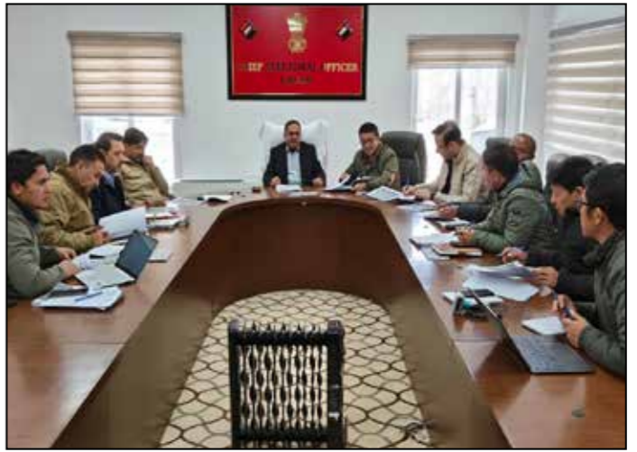
Reach Ladakh Correspondent