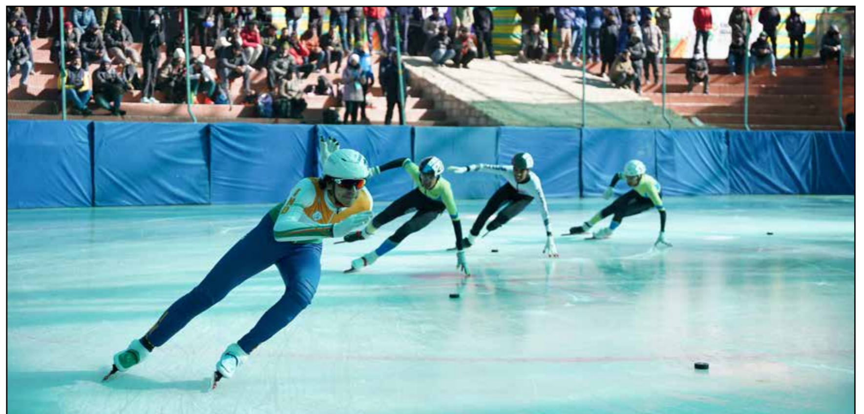
Khelo India Winter Games 2024: Speed-skating competition held at the NDS Ice Hockey Rink.