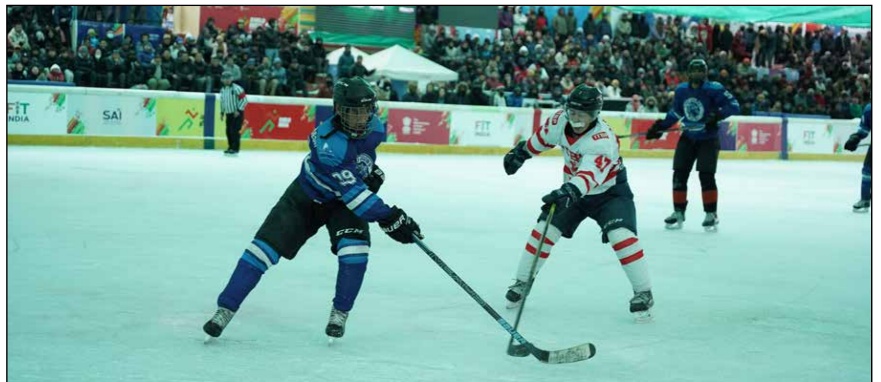
Ice Hockey match between ITBP and Himachal Pradesh at the NDS Ice Hockey Rink.