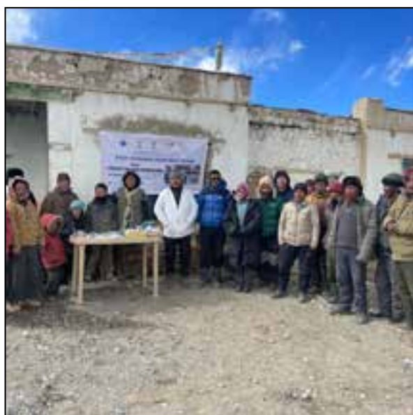
Sheep Husbandry Department Nyoma organised mobile veterinary health camp cum awareness regarding various schemes. They also took feedback from breeders/livestock entrepreneurs regarding established kid pen and milk replacers at highland pasture area Lanzam of Chumur Tibetan refugees' settlement and Sumdo Tibetan refugees' settlement villages in Nyoma subdivision.