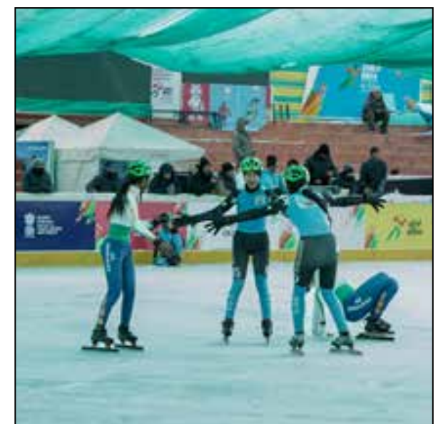
Ladakh won first-ever Khelo India gold in the women's short track 1600m relay at the NDS sports complex in Leh on February 5.