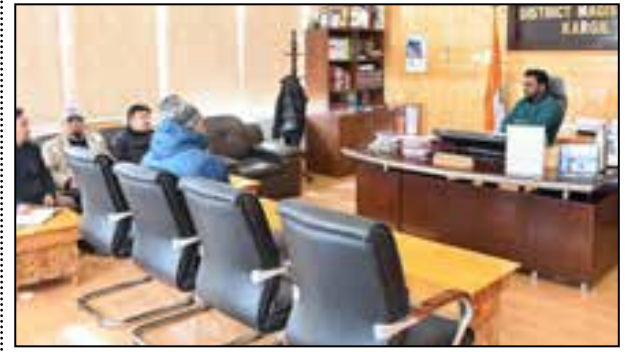
Deputy Commissioner, Kargil, Shrikant Balasaheb Suse reviewing the progress of Sukanya Samridhi Yojana