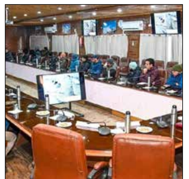
One day program on use of road infrastructure, black spots, road construction, road safety audit and traffic signs was organised by R&B Division Kargil in collaboration with NHIDCL and PMU Kargil at Conference Hall, Kargil.