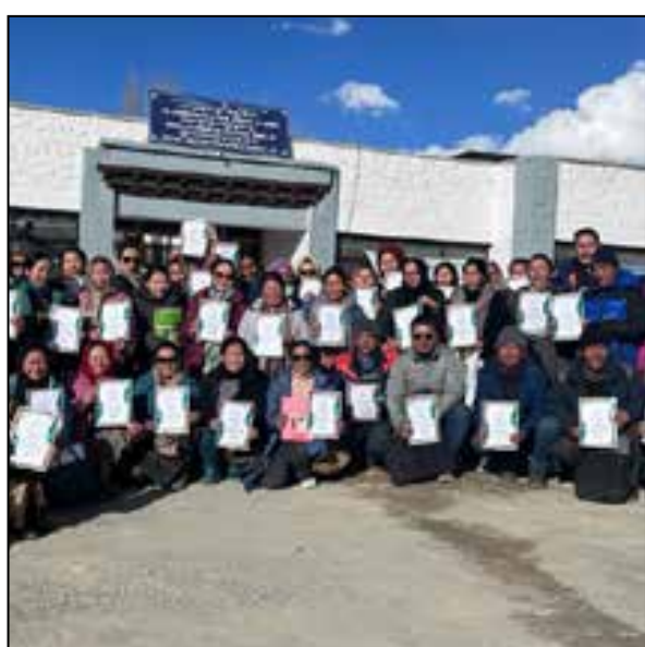
Social, Emotional, and Ethical (SEE) Learning education preparation workshop concluded on February 6 at DIET Leh. A total of 50 participants participated in the workshop.