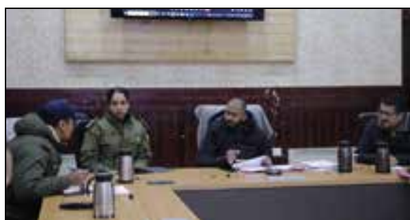
During the one-day training session on first-aid skills and road safety to government drivers.