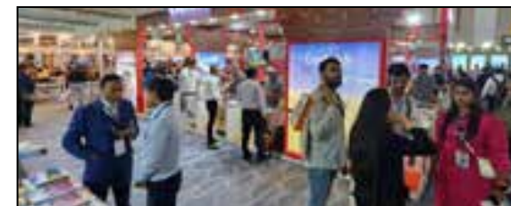
The Ladakh Pavilion during the Outbound Travel Mart [OTM] at the Jio Convention Center, Bandra Kurla Complex, Mumbai.

Ladakh Tourism Department has facilitated the participation of co-exhibitors from the UT to showcase Ladakh's unique position as a different tourist destination, which catches the imagination of varied travellers, explorers, adventure lovers, nature lovers and above all Ladakh's rich cultural and heritage assets. The OTM pro-