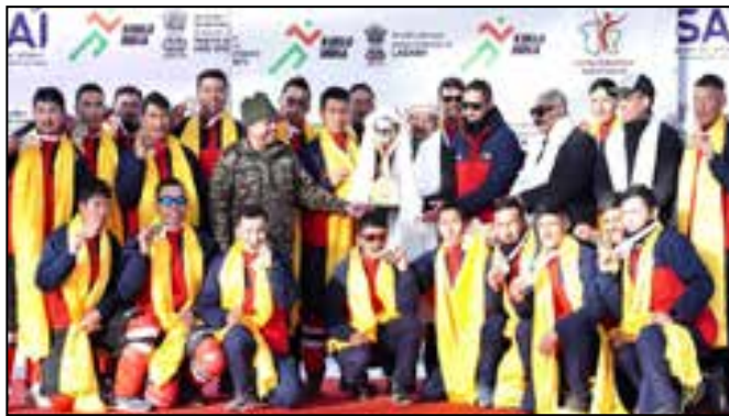
The Army team that won the Khelo India Winter Games 2024 men's ice-hockey competition at the NDS Sports Complex in Leh on Tuesday.

ITBP claims women's title as Army clinches men's victory in Khelo India Winter Games finale