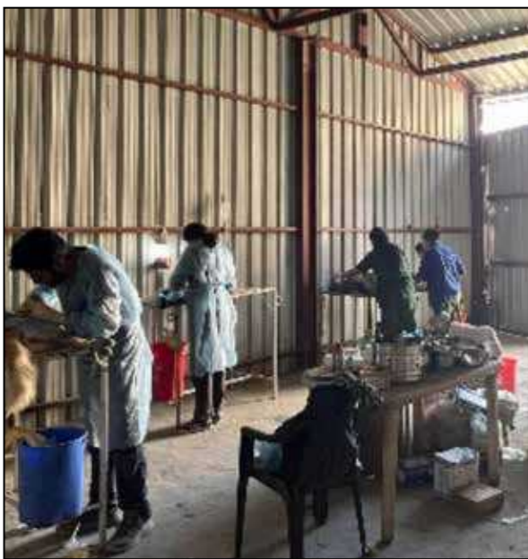
Animal Birth Control and Anti-Rabies Vaccination Camp was held at the Block headquarters in Tangse. A total of 182 dogs were sterilized and given anti-rabies vaccines.