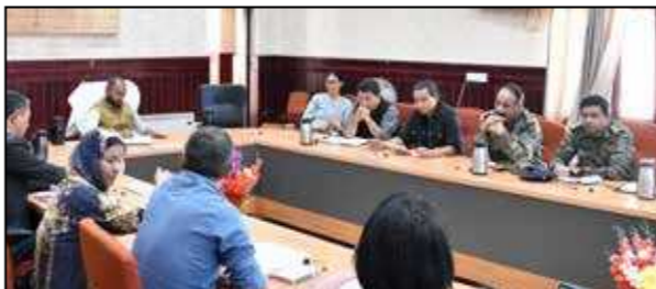
Deputy Commissioner of Leh, Santosh Sukhadeve convening a meeting on 'Swachhata Pakhwada' initiative.