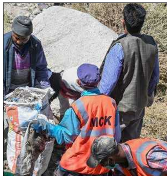
MC Kargil in coordination with other departments and NYK Kargil, conducted a Swachata Pakhawada cleanliness drive at Api Nallah, Kabadi Nallah, and Adul Gund, Kargil