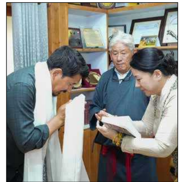
A delegation comprising of Member of Parliament of Central Tibetan Administration expressed gratitude to Hill Council, Leh for the extensive support and dedicated measures undertaken for the welfare of the Tibetan community residing in Ladakh.