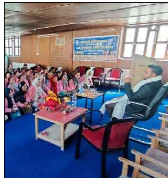
A delegation comprising of Member of Parliament of Central Tibetan Administration expressed gratitude to Hill Council, Leh for the extensive support and dedicated measures undertaken for the welfare of the Tibetan community residing in Ladakh.