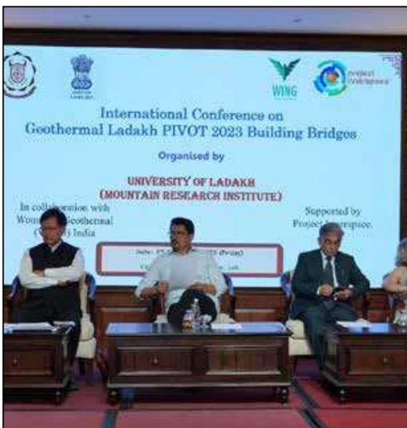
During the inaugural session of the international conference themed 'Geothermal Ladakh PIVOT 2023 Building Bridges' organised by Mountain Research Institute, University of Ladakh in collaboration with Women in Geothermal (India) and Inner Project Space, USA in Leh.