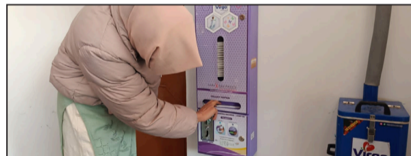
Student using sanitary vending machine at Govt. Model College, Zanskar.

Principal, MNM Shabani informed the students about menstrual hygiene and cautioned them about the use of unscientific and unhygienic materials during their menstrual cycle.