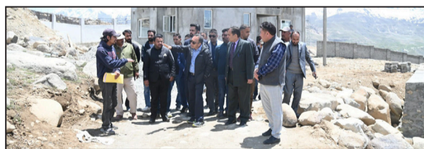
Justice Tashi Rabstan during his visit at construction site.

KARGIL: Justice Tashi Rabstan, First Puisne Judge, High Court of J&K and Ladakh (Chairman Building and Infrastructure Committee) visited District Court Complex Kargil on May 27.