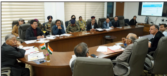
During the meeting of the 8 th State Board of Wildlife of UT Ladakh at Raj Niwas.