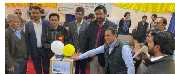
MP Ladakh during the distribution of various equipment to Jawahar Navodaya Vidyalaya (JNV) Khumbathang, Kargil.