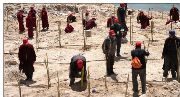
During the mega plantation drive at Liktsse.

highlighted the importance of such mass plantation drives for the rising issue of climate change. In this regard, he appreciated the efforts of Khamtak Rinpoche and the organisers for a successful plantation drive. He added that planting crops - apple and apricot orchards becomes necessary and will help generate income for the youth in the village.