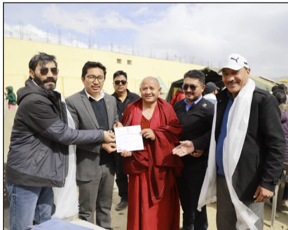
Thousands of beneficiaries availed benefits of various schemes during the 5-day Seva for Sangha Camp, intended to target individual-oriented beneficiary schemes. The camp concluded on May 15 at Dharma Centre Choglamsar, Leh.