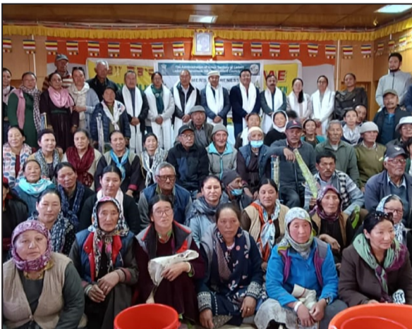
Department of Horticulture Leh in collaboration with SKUAST-K, Leh organised one-day Farmers Awareness programme in Nimoo village regarding management of insects/pests causing huge damages to fruit crops.