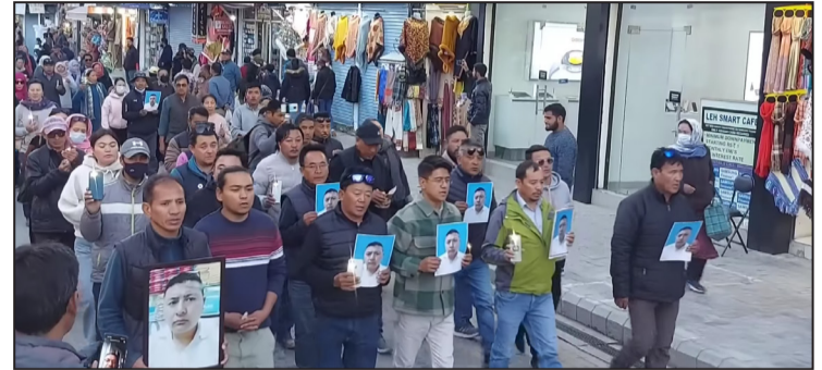
During the candlelight march for Khemi Sarpanch who committed suicide.