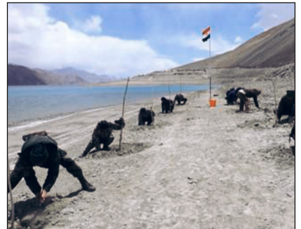
Celebrating International day of Biodiversity, Ladakh administration in collaboration with Indian Army organised a campaign at Pangong Tso Lake from May 20 to 23.