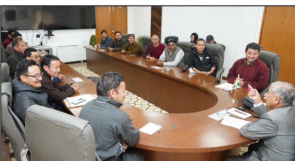
Lieutenant Governor of Ladakh, Brigadier (Dr) BD Mishra (Retd) interacting with the Councillors of LAHDC Leh, at Raj Niwas.