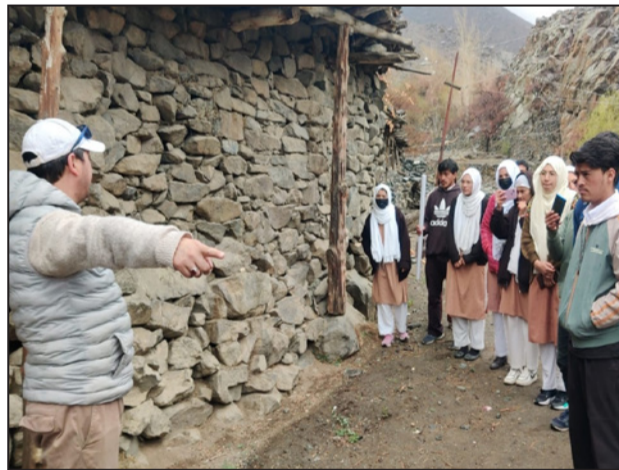
World Heritage Day: During the Heritage tour at Border Village Hunderman Brok organised by Department of Archives, Archeology and Museum, Ladakh in collaboration with Himalayan Cultural Heritage Foundation.