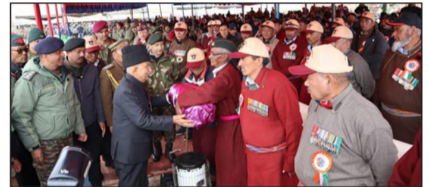
Lieutenant Governor interacting with the veterans of Indian army during the veteran rally in Kharu.