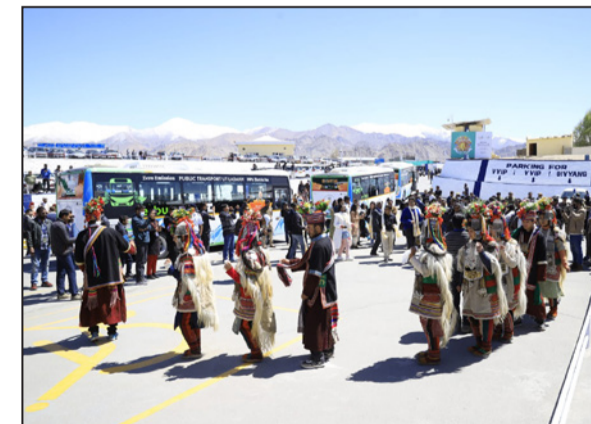
Delegates of Y-20 Pre Summit were accorded a warm cultural welcome on their arrival to Leh on April 25 at KBR airport.