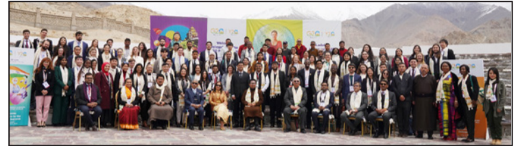
Officials of Ladakh along with delegates of Y-20 at Sindhu Sanskriti hall, Leh.

Over 100 delegates from 30 countries participate