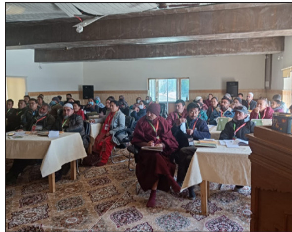
The four-day Social Ethical and Emotional (SEE) learning program for the Bhoti & Arabic Teachers of Leh District begins at DIET Leh. Around 51 teachers attended the SEE learning program.