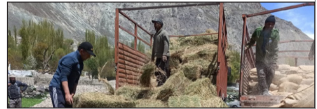
Department of Sheep and Animal Husbandry distributing wheat bran, alfa-alfa, and cattle feed in Bogdang

To mitigate the risk of such incidents occurring in the future, the officer recommended exploring and taking up the prospect of developing fodder and promoting sustainable livestock-rearing practices in the area. It will not only prevent further deaths but will also improve the livelihoods of the local farmers and livestock