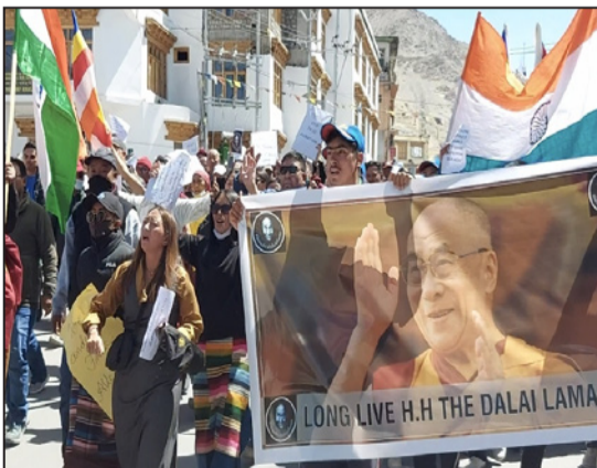
During the protest rally organised by LBA and LGA in support of His Holiness Dalai Lama.