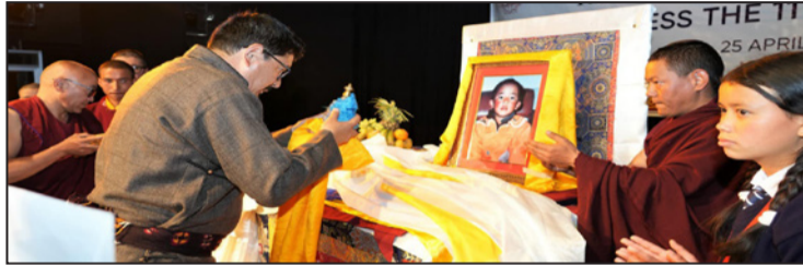
CEC Tashi Gyaltsen offering mandal during the 34th birthday anniversary celebration of H.H. the 11th Panchen Lama Gendun Choekyi Nyima.