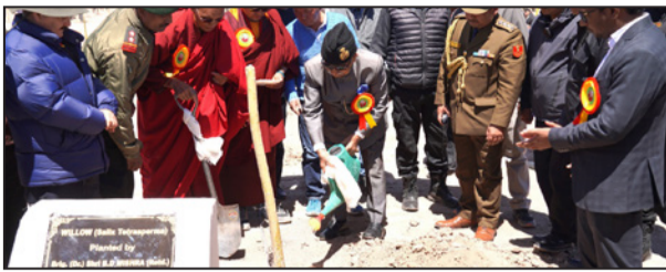
L-G planting a willow tree sapling during the mega plantation drive at Stakna village.