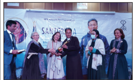
Educationist and environmentalist Sonam Wangchuk receiving the prestigious Santokbaa Humanitarian Award.

Dedicates prize money to educate girl-students of Leh & Kargil