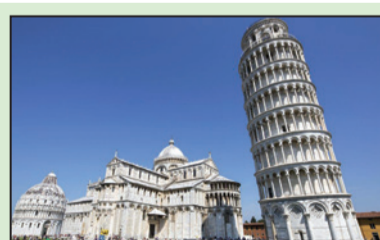
Leaning tower of Pisa