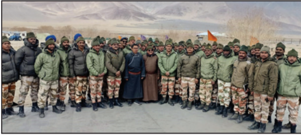
Union Agriculture and Farmers Welfare Minister, Narendra Singh Tomar along with MP Ladakh and ITBP forces during his visit to Dungti village on the eastern border of Changthang region in Ladakh.

Center's priority is to develop border villages, says Minister