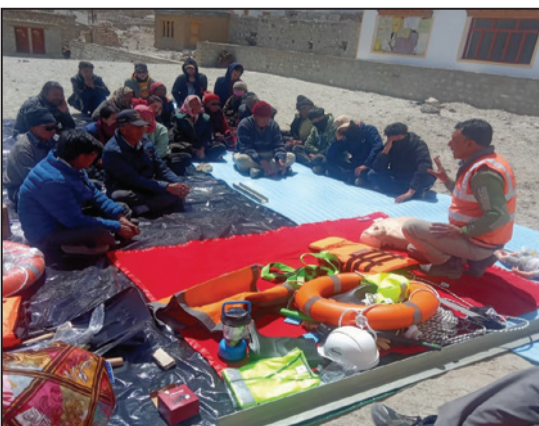
Union Territory Disaster Response Force (UTDRF), Leh conducted disaster relief, rescue and rehabilitation training at Khardong village of Nubra sub-division on April 12.