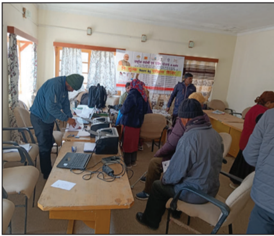
Assessment camp for the Senior Citizens and Persons with Disabilities (PwDs) was held on April 10 at Durbuk. The camp was organised by the Social Welfare Department, Leh in collaboration with Artificial Limbs Manufacturing Corporation of India (ALIMCO) and the Health Department, Leh.