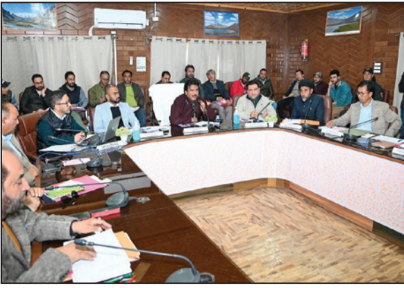
During the General Council Meeting of LAHDC, Kargil for finalization of Annual Capex Budget (District Plan).