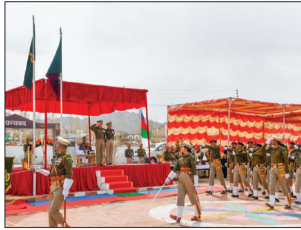
Headquarters North West Frontier (NWF) Indo-Tibetan Border Police (ITBP), Ladakh celebrated its 17th raising day on April 1.