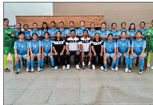
UT Ladakh Women's Football team beat Jammu and Kashmir football team with a score of 3-1 in the Hero 27th Senior Women's National Championship.