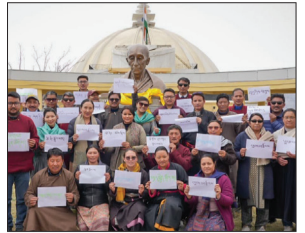
Ladakh Autonomous Hill Development Council, Leh observed Bhoti Language Day with great fervor on April 1 at Council Secretariat.