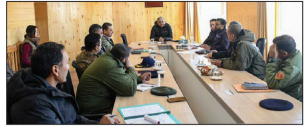
During the first meeting of the UT Level Immediate Emergency Assistance Committee (IEAC).