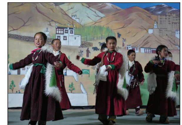
Student Art Group, Government High School Shara Valley showcased cultural programme at Lotsava Auditorium Hall Cultural Academy, Leh.