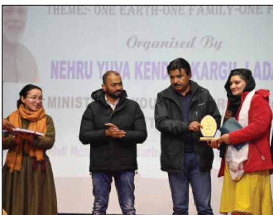
Nehru Yuva Kendra (NYK) Kargil organised a day-long district-level "Neighbourhood Youth Parliament" program at Auditorium Hall, Kargil.