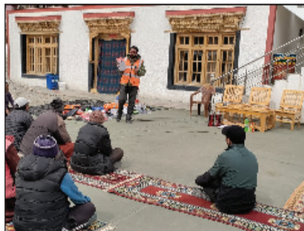
The first phase of training on disaster management organised by DDMA Leh in collaboration with UTDRF and Aapda Mitra volunteers concluded in the Khatse sub-division on March 23.