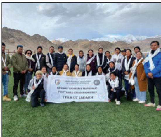
A team of 22 girls from UT Ladakh will be participating in the Hero 27th Senior Women's National Football Championship 2022-23.