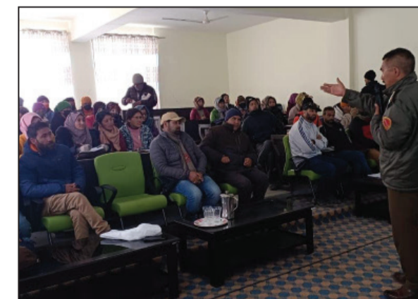
As part of G 20 events, Govt. Model Degree College (GMDC) Zanskar conducted an awareness-cum-interactive-session on "Cyber Crime and Drug Addiction" on the college premises.