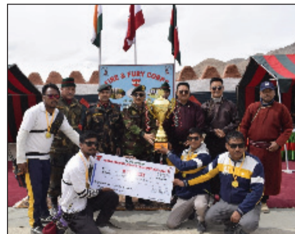
Indian Army, STALKERS Battalion under Fire and Fury Corps organised the 'Ladakh Regional Archery Competition 2022-23' under Operation Sadbhavana on March 24 at Phyang. 14 modern archery teams from Leh and Kargil districts participated.