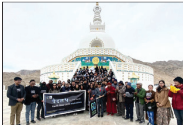
During the flagging off of the Earth Hour walkathon at Shanti Stupa.

He highlighted issues prevalent in society such as the dumping