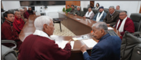
Delegation of LBA & LGA with Lieutenant Governor.