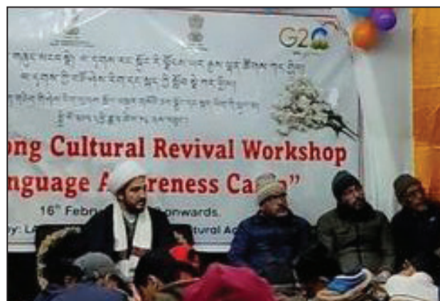
The week-long Cultural Revival Workshop and Language Awareness Camp jointly organized by LAHDC, Kargil and Ladakh Cultural Academy Kargil concluded at Balti Bazaar, Kargil.