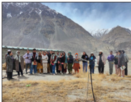
Department of Botany in collaboration with Department of Environmental Science, Government Degree College, Nubra during a one-day field visit.