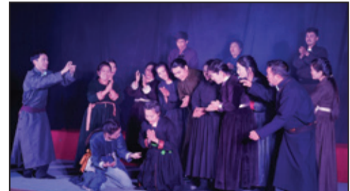
Participants staging the play 'Gyurja' during the World Theatre day celebration.