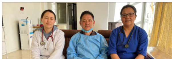
A team of doctors from snm hospital Leh.