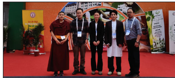
A team of five Sowa Rigpa doctors from the National Institute of Sowa Rigpa, Leh.