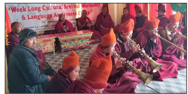
cultural revival workshop at Karsha monastery.

The week-long cultural revival workshop and language awareness camp will be held in around 25 villages of the Kargil district starting from February 16 onwards. The camp has been ideated by the Hill Council, Kargil with the aim and vision to preserve, conserve and promote the rich socio-cultural heritage of Ladakh which is equally unique and