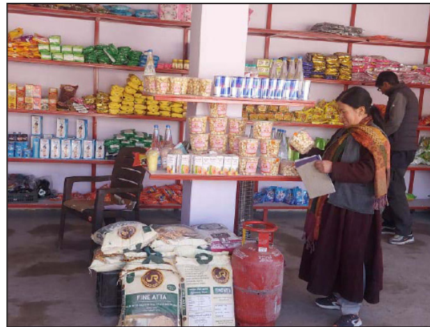
The market checking team of Food, Civil Supplies and Consumer Affairs Department (FCS&CA) Leh inspecting shops of Leh market and its surrounding areas.