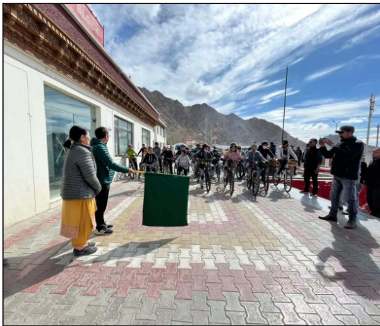
A cycling event themed 'Healthy Women Healthy India' was organised by NCD Cell Leh under the National Program for Prevention and Control of Cancer, Diabetes, Cardiovascular Disease and Stroke (NPCDCS) on March 5 at SNM Hospital Leh.