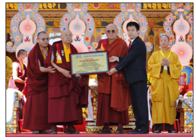
Receiving the certificate, 'The spiritual and cultural space for Vajrayana Buddhism' by the Vietnam Union of UNESCO Associations.