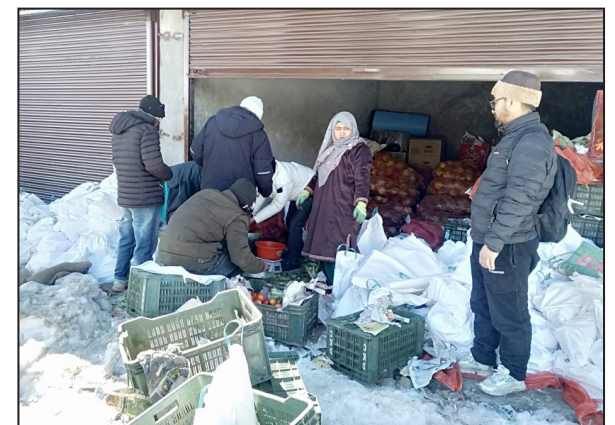
Department of Cooperative Zanskar distributed 60 quintals of fresh vegetables in Zanskar.