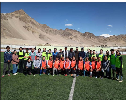
As a part of the women's day celebration, Department of Youth Services and Sports, UT Ladakh organised a football match for the women's team at Open Stadium, Leh.