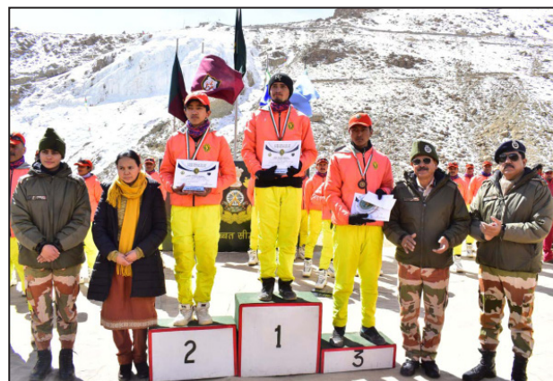
The second edition of Nurboo Wangdus Memorial Ice Wall Climbing Competition concluded at Gangles village.