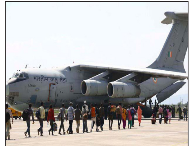
Stranded passengers of Kargil were airlifted from Jammu and Srinagar in Indian Air Force Aircrafts on the requisition of UT Ladakh Administration.