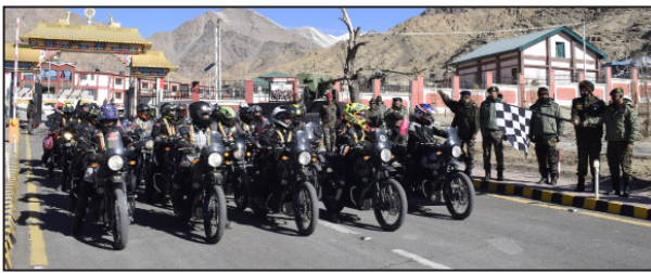
During the two-day awareness cum information program for senior citizens of Ladakh.

This three day expedition comprises of 25 brave and experienced women bike riders pan India who have volunteered for this adventurous activity. The expedition commenced from the Hall of Fame, Leh and will culminate