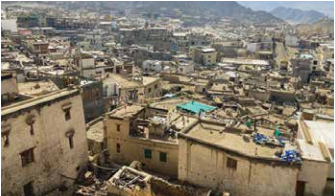
Leh old town

During special functions in Leh, a Heritage walk is organized in the Leh old Town areas to make the people feel about ancient buildings and their way of living.