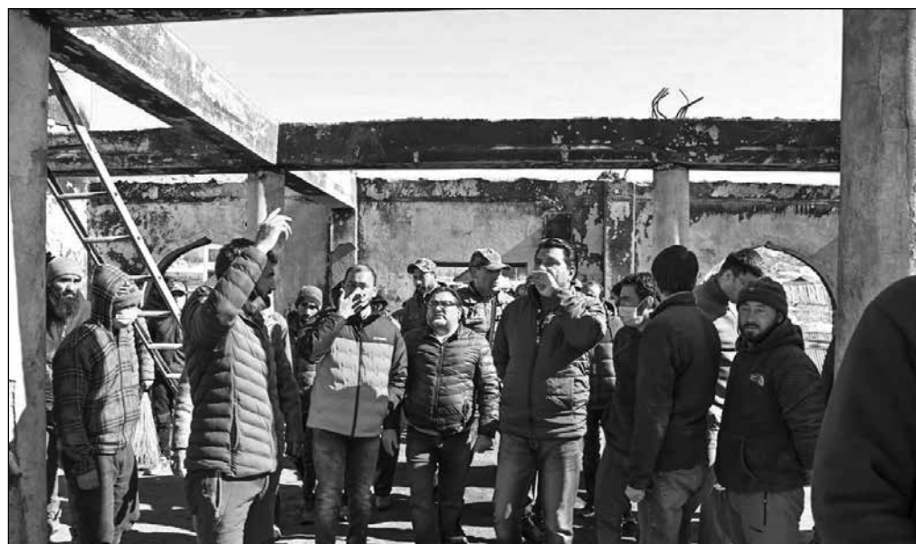
Officials assessing the condition of Old Hanfia Jamia Masjid damaged due to a fire incident.