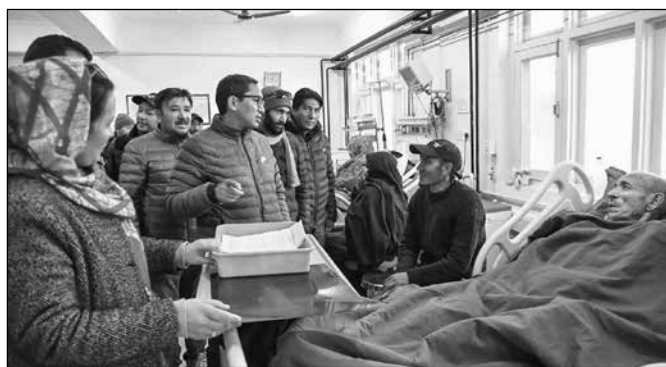
MP, Ladakh, Jamyang Tsering Namgyal interacting with patient and hospital staff at new district Hospital Kargil.