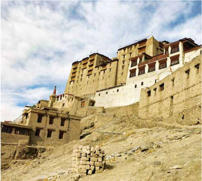
The 17th century Leh palace

The heritage building in Ladakh built with mud bricks and local wood lasts for hundreds of years. The 17th-century Leh Palace standing tall and impressively in the heart of the city is built with mud, stone and local woods and is the best example of the traditional architect. Traditional buildings in Ladakh with mud bricks are designed to have small entrances and windows to retain the heat to survive the harsh winter. Due to the rapid growth of modernization and development, the people of Ladakh prefer to dismantle the old heritage structure and construct a modern building using concrete structure. The new trend of switching traditional mud buildings with modern infrastructure and concrete buildings is mushrooming, leaving only a few heritage sites in Ladakh.