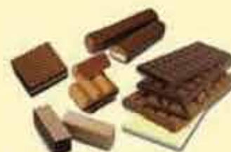
Chocolates & Wafers