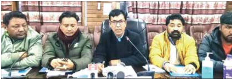
Members of Hill Council, Kargil addressing the media after passing the 4 points resolution.

Demands statehood, protection under the 6th Schedule, separate LS seats for Kargil & Leh, and Ladakh Public Service Commission