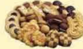
Biscuits & Cookies