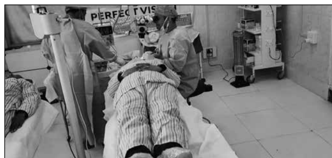
During the two-day free eye cataract surgery camp.

49 cataract and 10 pterygium cases operated upon