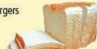
Breads & Buns