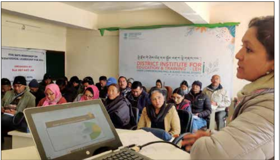
A five-day workshop on Pedagogical Leadership for Heads of various Govt schools was organised by the School Leadership Academy, DIET Leh with the direction of NCSL-NIEPA, New Delhi. Headmasters of 37 High Schools of Leh district are participated in this workshop.