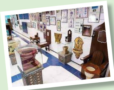
Sulabh International Museum of Toilets

● In New Delhi, the Sulabh International Museum Of Toilets features a rare collection that details the historic evolution of toilets from 2500 BC all the way up to the present day. When you browse through the exhibit, you'll learn about the plumbing system of ancient societies, marvel at the elaborately decorated toilets of 18th and 19th-century Europe, and even get to sit upon one from Austria that is shaped like a lion!