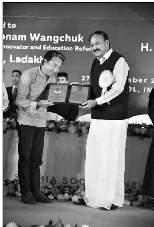
Renowned educationist and social innovator Sonam Wangchuk receiving the 7th Dr. Paulos Mar Gregorios Award from Former Vice President of India, Venkiah Naidu at New Delhi.