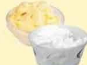
Shortening & Margarine