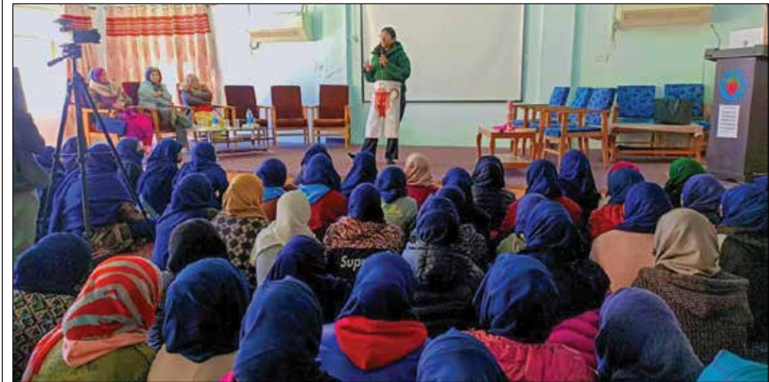
Baqirya Health Care & Research Centre Kargil (BHC&RC) in collaboration with Block Medical Officer Sankoo and Shoqpa Foundation organised an awareness program on menstrual health and hygiene management at Community Health Center Sankoo.