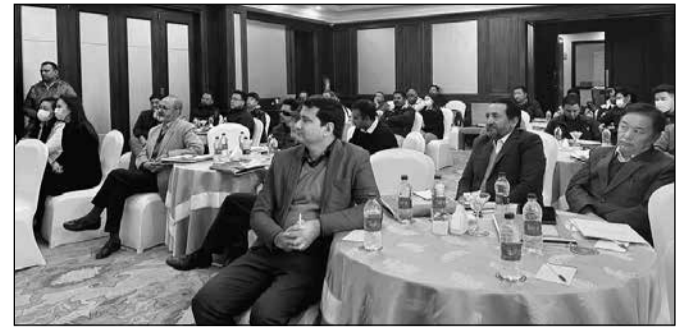
During the two-day regional workshop on Building Design for Energy Efficiency and Renewable Energy Integration in buildings in Ladakh.