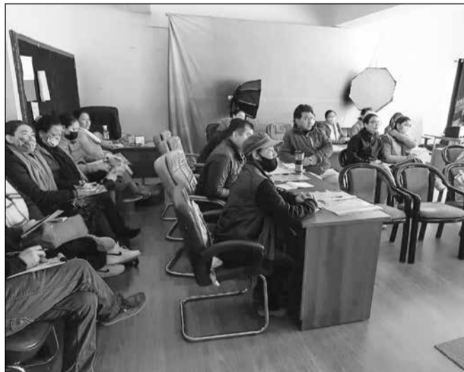
During the five-day training on Jolly Phonics focusing on reading proficiency under NIPUN Bharat for government school teachers at DIET Leh.