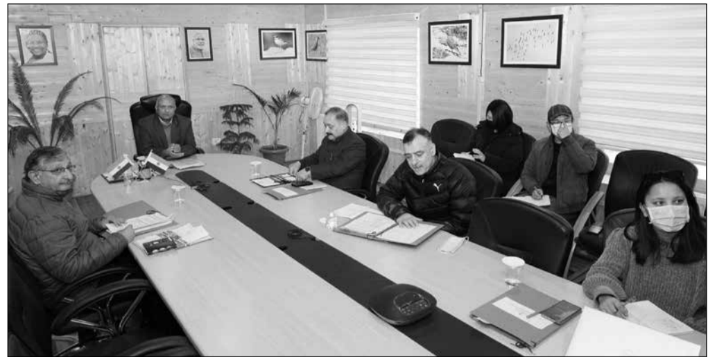
During the 7th meeting of the State Board for Wildlife of UT Ladakh chaired by the Lieutenant Governor of Ladakh, RK Mathur.

Discuss rationalization of boundaries of wildlife sanctuaries, feral dogs among topics