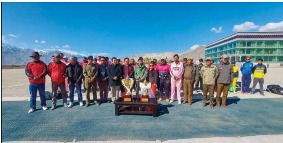
District Police Leh organised the 1st Police Martyrs Memorial Cricket Tournament of Leh sub division at NDS stadium.