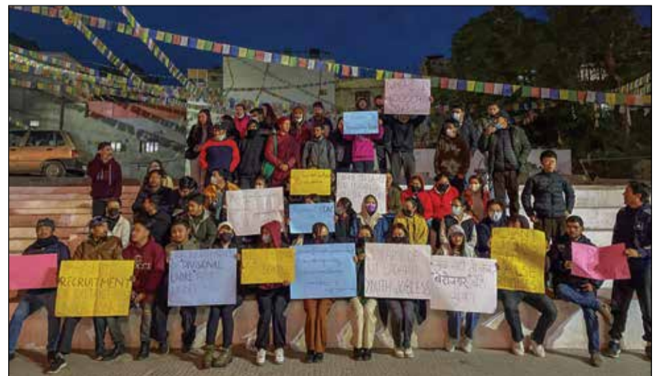
On 19th October a successful general discussion on unemployment and safeguard issue in Ladakh was organised by the All Ladakh Unemployed Youth Association (ALUYA) and Student Unions of Ladakh. The discussion was attended by all the stake holders of Ladakh where they assured their full fledged support for the youth in course of action they take in getting their genuine demands of employment and safeguard for Ladakh.