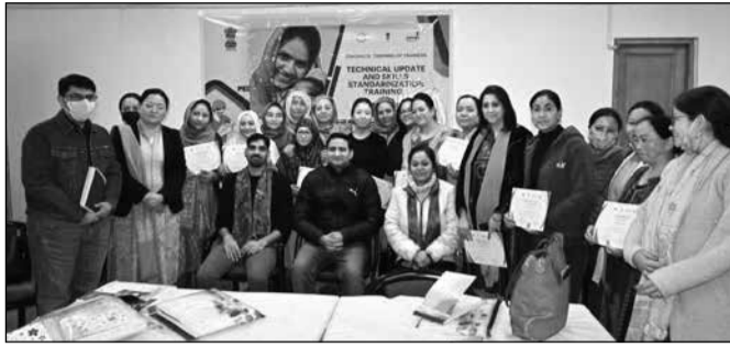
During the concluding day of the Training of Trainers (ToT) on Technical Update and Skills Standardization for Maternal and Newborn care.