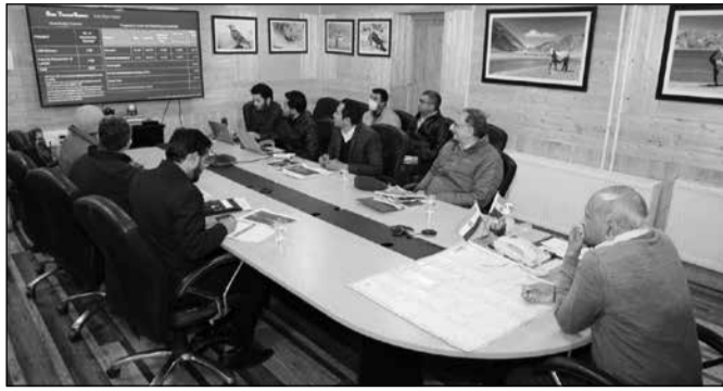
Lieutenant Governor of Ladakh, RK Mathur reviewing the progress of ongoing projects and project proposals of LREDA, KREDA and PDD.