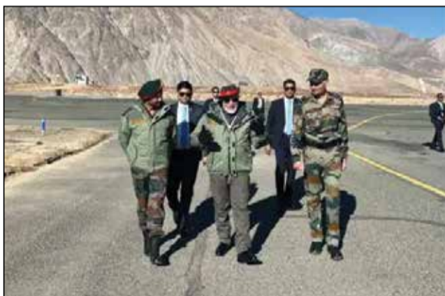
Prime Minister Narendra Modi arrived on October 24 in Kargil to celebrate Diwali with the Indian Army.