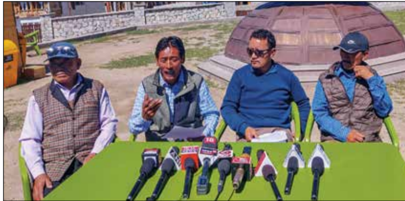
Public representatives and Councillor Chushul constituency addressing the press conference on grazing land issue in Leh.

He said that the people of the region expected the govt. will develop and boost wildlife tourism because the areas like Changchenmo are the hotspots of rare wildlife species like Dong( wild yak),