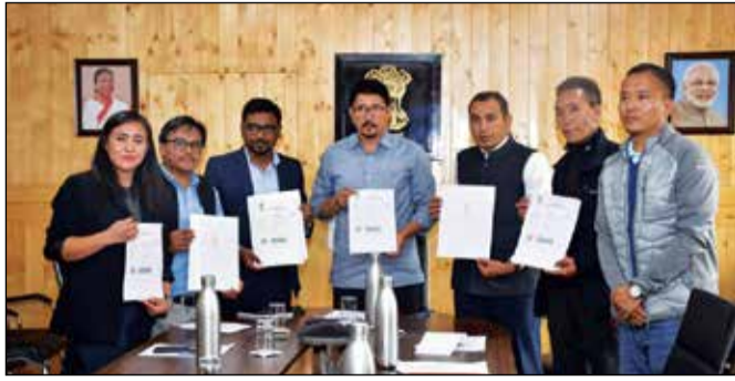
During the signing of the tripartite Memorandum of Understanding (MoU) for the promotion of ice hockey in Ladakh through various training and purchase of equipment.