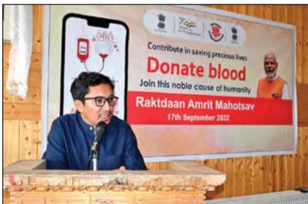
Member of Parliament, Ladakh, Jamyang Tsering Namgyal addressing the gathering during mega blood donation drive 'Raktdaan Amrit Mahotsav' at SNM Hospital Leh.