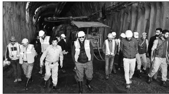
Advisor to Lieutenant Governor UT Ladakh, Umang Narula during the inspection of the construction work of Zojila tunnel eastern portal.