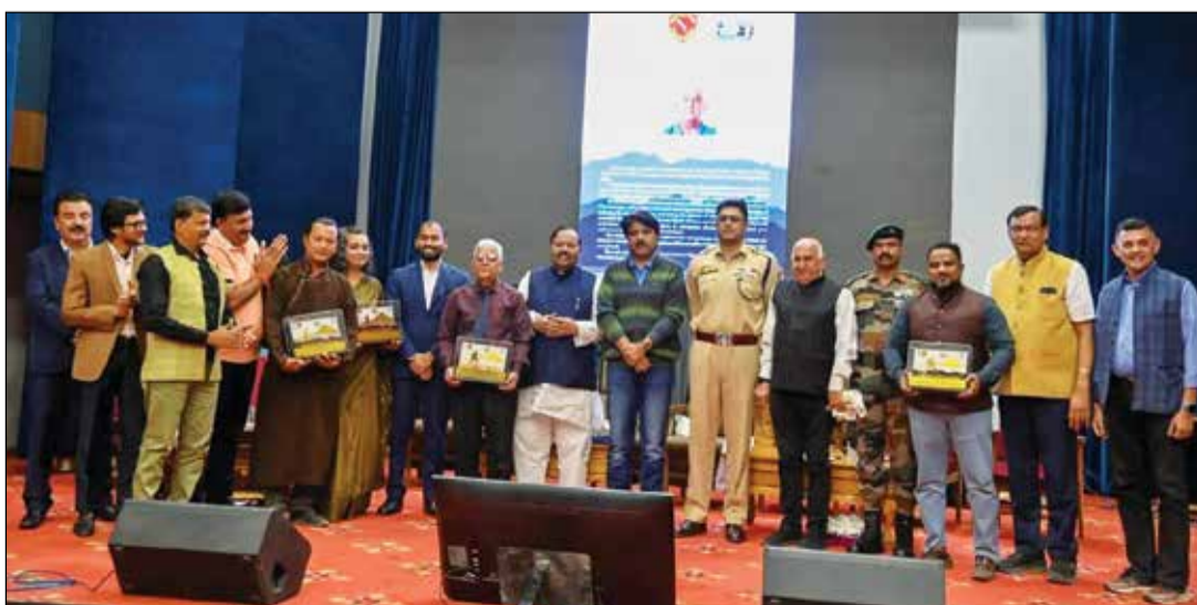
Guests and awardees during the felicitation ceremony of the Kargil Gaurav Award.