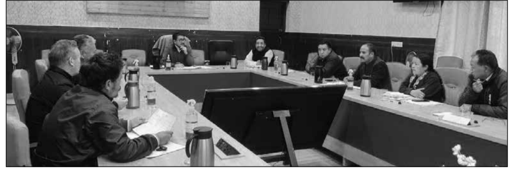
Additional Deputy Commissioner, Leh, Sonam Chosjor chairing a meeting with the concerned stakeholders regarding Ladakh Festival 2022 celebration.