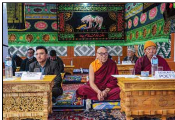
Ladakh Academy of Art, Culture and Languages (LAACL), Leh and Shia Muslim Co-ordination Committee, Auqaf Sub Committee Chuchot Yokma organised a District-level multi-lingual Hussaini Mushaira at Chuchot Yokma.