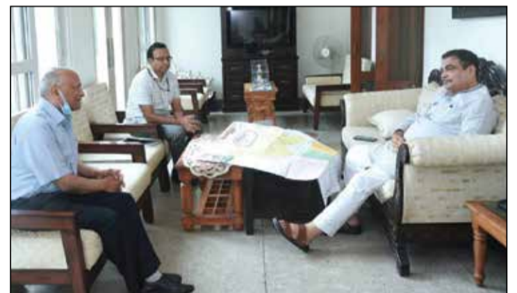
Lieutenant Governor of Ladakh, RK Mathur met Minister for Road Transport & Highways (MoRTH), Nitin Gadkari in New Delhi and discussed road/tunnel development projects in Ladakh.