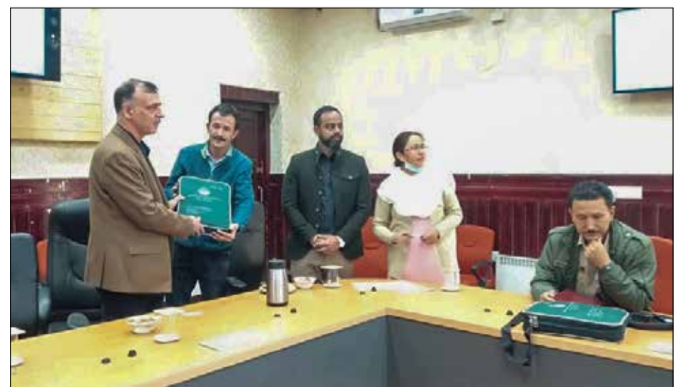
Ladakh Pollution Control Committee conducted a one-day training cum workshop for the officials of Traffic Police Leh, Municipal Committee Leh, and Revenue Department Leh. Member Secretary, Ladakh Pollution Control Committee distributed 8 Noise Level Meters (NLM) to Traffic Police Leh, 1 each to Municipal Committee, Leh and Revenue Department, Leh.