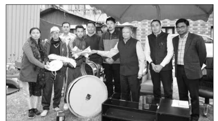
Students receiving sports equipment from Lieutenant Governor of Ladakh RK Mathur at Raj Niwas.

Sports equipment worth ₹4 crores distributed among the school students included archery kits, gymnastics mats, ice hockey kits, cricket kits, football, handball and volleyball, table