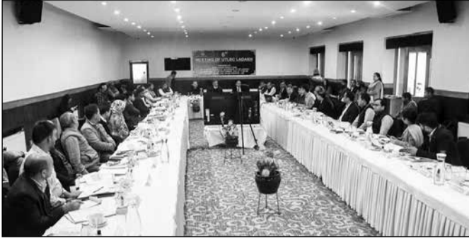
During the sixth meeting of the Union Territory Level Bankers' Committee (UTLBC) of Ladakh for the quarter ended June 2022 to 21st September 2022.

CD Ratio improves to 42% against 38% in the previous year