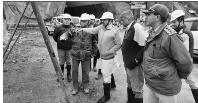
Union Minister of State for Home Affairs, Ajay Kumar Mishra reviewing the work progress at Zojila tunnel eastern portal.

They appraised the MoS about the present status of ongoing