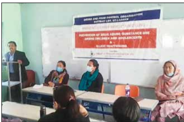
An awareness-cum-counselling session was conducted by the Department of Drugs and Food Control Organisation, Leh with the teaching faculty and parents of the Boys Higher Secondary School, Leh on June 18. The theme for the awareness session was 'Prevention of drug abuse among children and adolescents and illicit trafficking.'