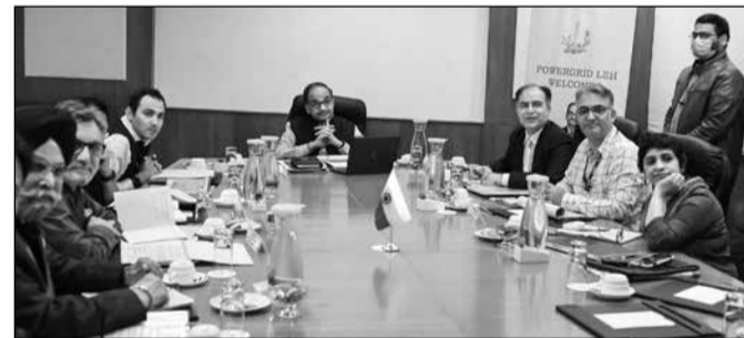
Secretary, Ministry of Power, Government of India, Alok Kumar chairing a meeting of power sector in UT Ladakh.

Stresses to focus on long-term and effectiveness of projects