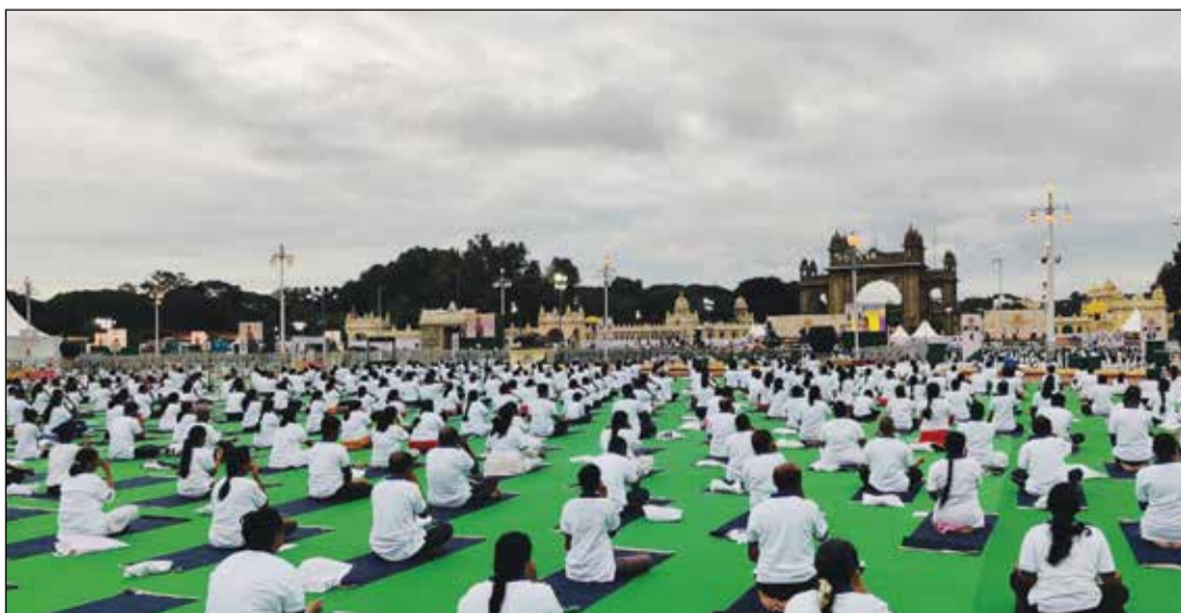
International Yoga Day: A team from the National Institute of Sowa Rigpa, Leh headed by Director, Dr. Padma Gurmet participated in the main event of the 8th International Day of Yoga led by Prime Minister, Narendra Modi at Mysuru, Karnataka. A mass yoga performance was conducted with 15,000 participants at Mysuru Palace.