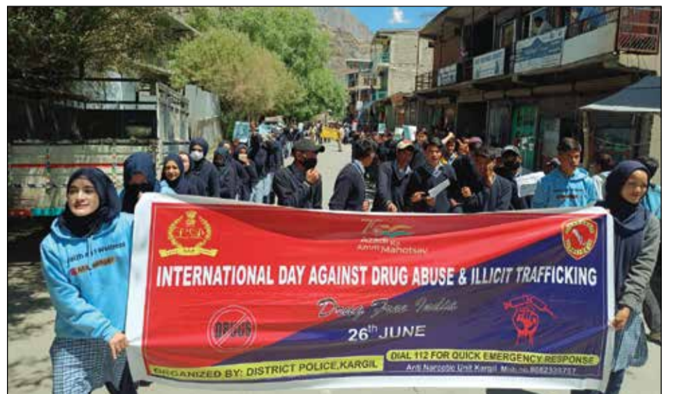
Anti-Narcotic Unit Kargil organised "Drug-free Ladakh campaign" at Government Higher Secondary School Sankoo in which students and staff of the school participated.