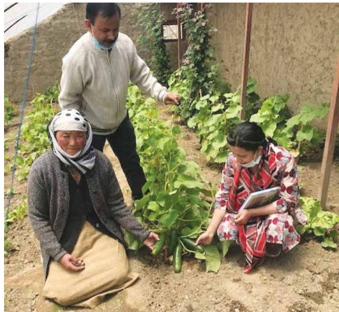
Production of cucumber in summer.

A project on exotic vegetables is started by SKUAST-Kashmir with funding support of Department of Science & Technology, New Delhi, The beneficiaries of the project outputs will be the resource poor farmers of Leh district in the Ladakh region preferably whose livelihoods and assets depend on agriculture. The small farmers, agricultural labours and women will be benefited with by increase in additional income and employment. Keeping the project objectives in view, Survey and Training at Chuchot, Shey, Nimoo Basgo, Stakna,