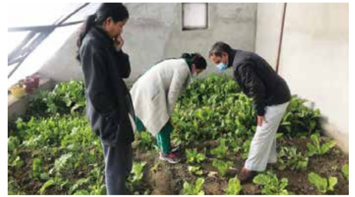
Production of Swiss Card Red and Green, Chinese Cabbage, Siberian Kale in Peak Winter