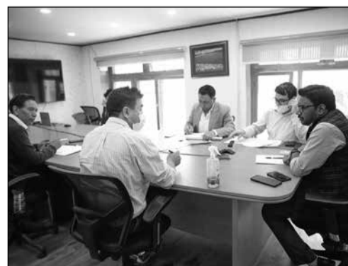
During a meeting regarding the status of execution of works under Samagra Shiksha Abhiyan in the Leh district.

The order further clarified that the availability of a ticket on a route or actual flying will be contingent upon the number of passengers, weather conditions, or any other operational restrictions.