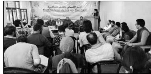
During the District Level Multilingual Mehfil-e-Mushaira at Kargil.