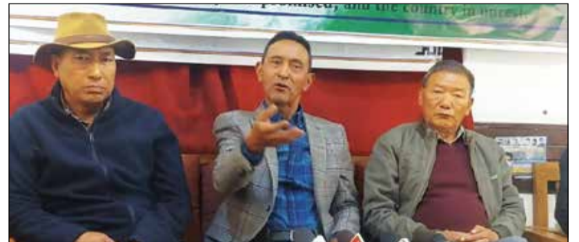
Leaders of Congress during the press conference on Agneepath scheme at party Office, Leh.

Why this scheme applies to jawans only and not the commissioned officers: Jora