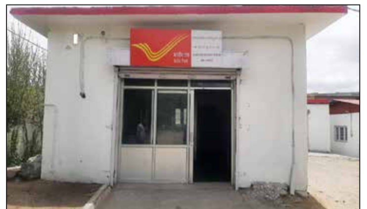
The Sub-Foreign Post Office (SFPO) was made operational at GPO Leh on June 25. Since then, the stakeholder is availing the facility of SFPO and till date about 21 parcels have been exported to as many as 14 Countries.