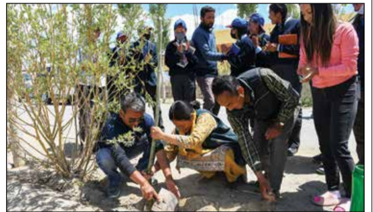
World Environment Day, themed, 'Only One Earth' was celebrated at Jamyang School on June 5. The event was organised by the Health Department Leh to create awareness about the protection of the environment.