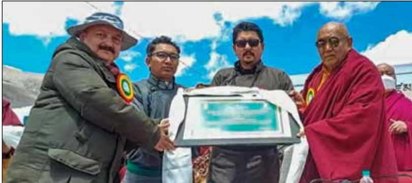
His Holiness Chetsang Rinpoche was conferred with the title, 'Green Ambassador of Ladakh'.

HH Chetsang Rinpoche conferred with title of 'Green Ambassador of Ladakh'