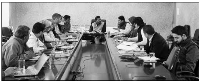
During the 4th Advisory Committee of Solid Waste Management meeting.

The objective of the UT administration in drafting the policy is to achieve 'Zero waste' status through sustainable interventions, innovations, and technology