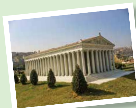
Artemis temple, Turkey.