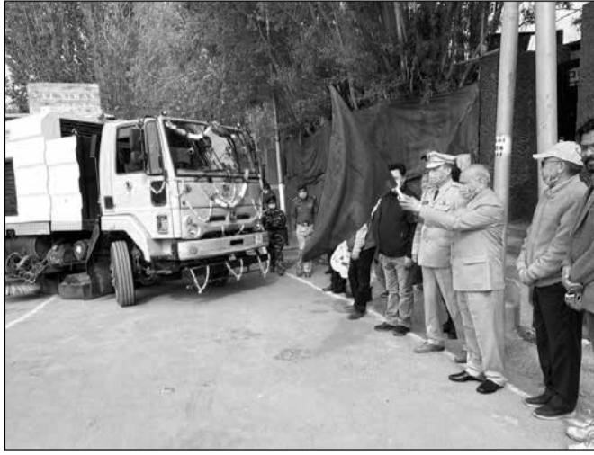
Lieutenant Governor of Ladakh, RK Mathur flagging off Road Sweeping Machine.

It can store 3 tonnes of solid waste and clean 10-15 km road length in an hour