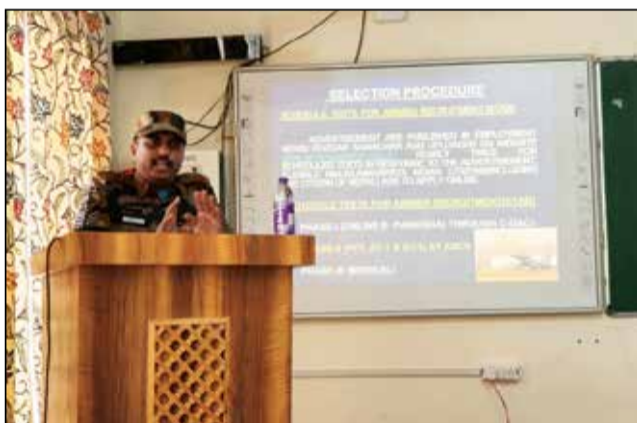
With an aim to motivate the youth and spread awareness about job service avenues in the Indian Airforce, a team from IAF held an interactive session with the students and faculty members of GDC Kargil.