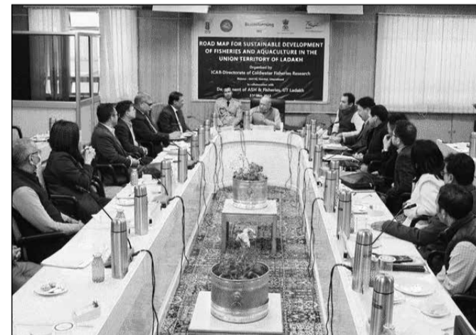
Participants after completing 15-day fast food stall and Udyami training organised by the State Bank of India, Rural Self Employment Training Institute (SBI-RSETI), Leh.

MoU signed between Ladakh & ICAR-DCFR Bhimtal for long-term development of fisheries in region