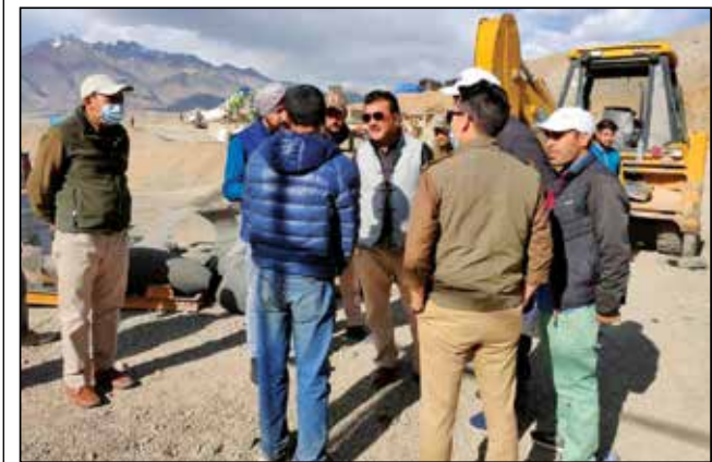
Three stone crushing units and one hot and wet mixing plant in the Kurbathang area of Kargil were sealed after found indulging in illegal mining activities on May 5. Following the report of the general public about illegal mining in the district, Assistant Commissioner (Revenue), Deputy Director, Geology and Mining, Ladakh, District Mineral Officer, Naib Tehsildar, Kargil and SHO Kargil conducted a surprise inspection.

MESSAGE TO THE READERS “When we talk about change and creating an inclusive environment for disabilities, action is needed. Social inclusion and exposure are must to change the lives of specially-abled people.”