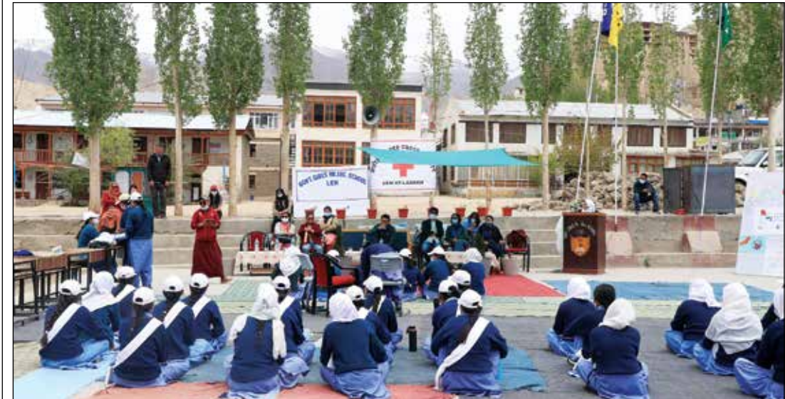
Red Cross Society, Leh observed Red Cross Day by organising an 'Anti-Smoking and Alcohol' programme in Girls Higher Secondary School, Leh and a 'Blood Donation' camp at Post Office, Leh on May 8.