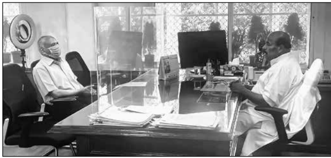
Lieutenant Governor of Ladakh, RK Mathur with Minister for Social Justice and Empowerment, Dr. Virendra Kumar.

Requests for Rehabilitation/De-addiction centres in Ladakh