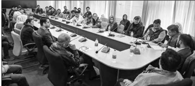
A team of a delegation from IIT interacted with the local entrepreneurs, Self-Help Group members and progressive farmers of the Kargil district at the Council Secretariat.