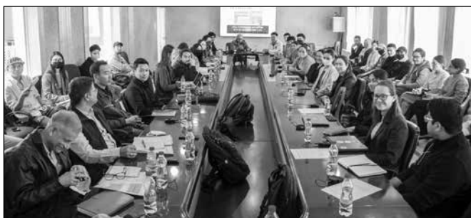
Industries and Commerce Department, Ladakh organising the first in the series of workshops on 'Enterprising Ladakh'.

Series of workshops being organised by Industries Department