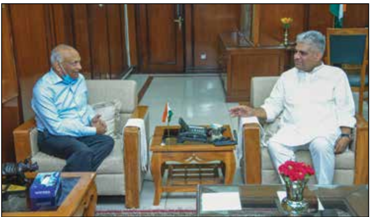
Lieutenant Governor of Ladakh, RK Mathur, met Minister of Labour and Environment, Bhupender Yadav in New Delhi and discussed various issues about the labourers and wildlife in Ladakh.