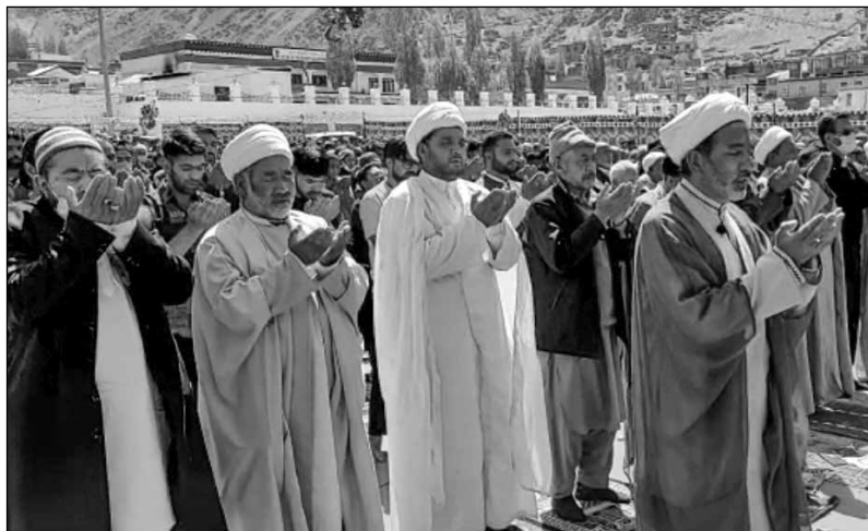
A congregation of the Shia community at Leh Pologround.

"During the holy month of Ramadan we prayed for prosperity, love and happiness and I appeal to every single Ladakhi to stay united, promote mutual