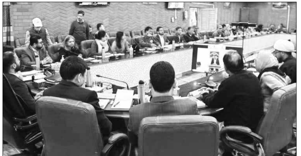
During the two-day workshop for effective implementation of the Juvenile Justice Amendment Act 2021 in Ladakh.