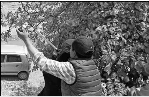
Experts inspecting the orchards infected by the yellowtail moth in Nubra.