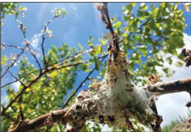
Scientists of KVK Kargil and experts of the Horticulture Department advised farmers in Kargil district to adopt suitable management strategies to fight the spread of brown/yellowtail moth disease on apricot trees in Kargil.