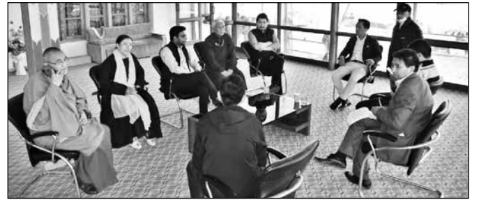
Officials conducting a meeting during their visit to summer residence of His Holiness the 14th Dalai Lama in Leh (Photang Geyphel ling) and the teaching ground at Jivetsal, Choglamsar.