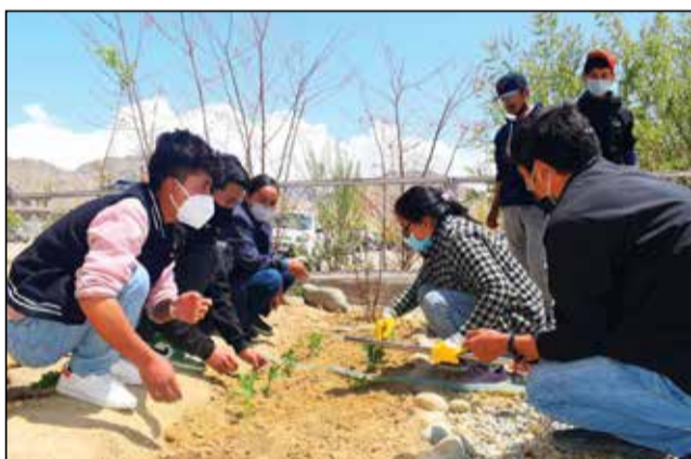
The Department of Environmental Science, Eco club, Green Club and NSS wing of Eliezer Joldan Memorial College, Leh celebrated Earth Day.