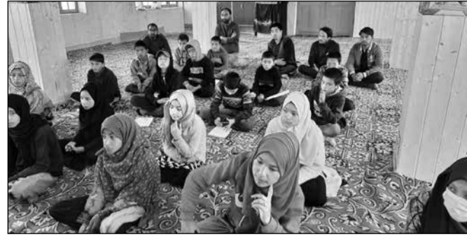
Students during the One day Jawahar Navodaya Vidyalaya Selection Test (JNVST) orientation class at Saliskote, Kargil.