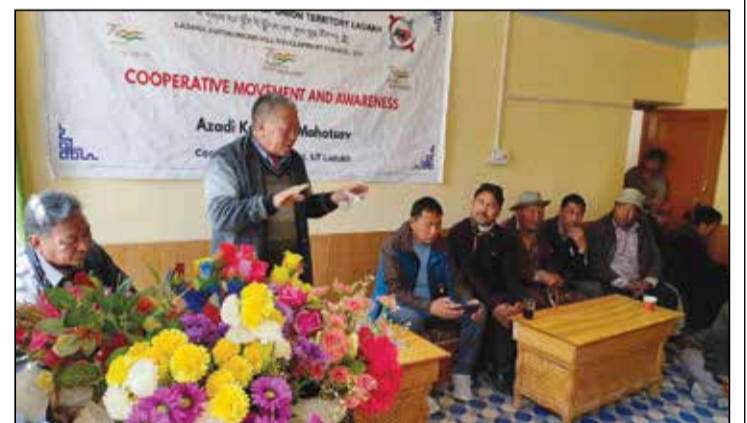
The Cooperative Department, Khalitse organised a cooperative movement and awareness camp, under the aegis of Azadi Ka Amrit Mahotsav celebrations at Tingmosgang village.