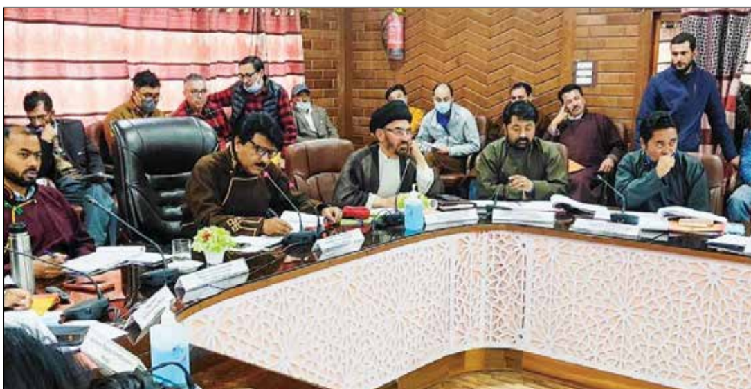
Chairman/Chief Executive Councillor (CEC), LAHDC, Kargil, Feroz Ahmad Khan chaired the General Council Meeting of LAHDC Kargil and approved ₹233.23 crores under Capex besides ₹25 crores approximately under subsidy component for annual district plan for Kargil.