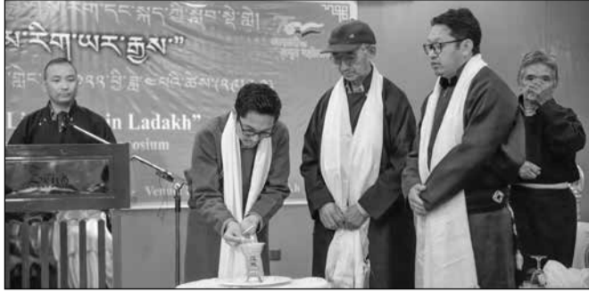
Member of Parliament, Jamyang Tsering Namgyal inaugurating the two days literary seminar and symposium themed, 'Development of Literature in Ladakh' at Hotel Zen Ladakh.