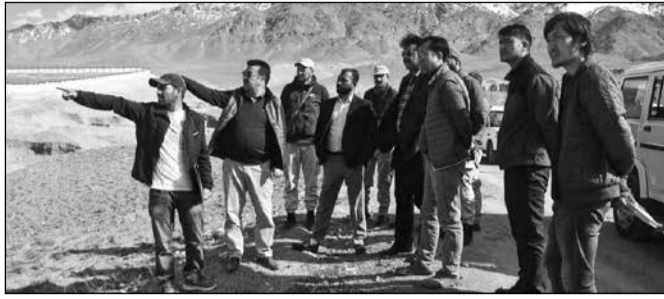
CEC, Kargil along with other officials identifying land to build cremation ground.

CEC identifies 1 kanal land at upper plateau, Kurbathang