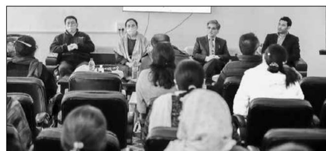
During the one-day workshop on Action research and academic writing for the teachers of the DIET and Education Department.