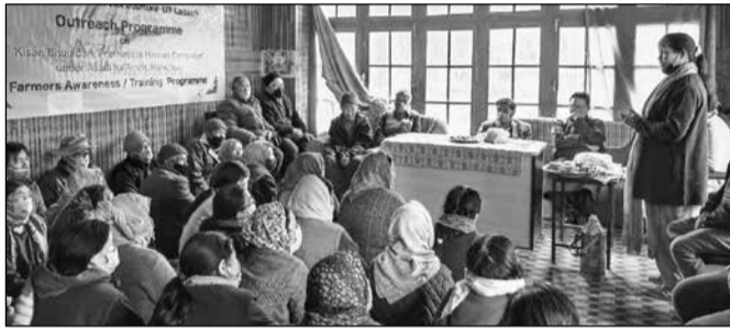
Farmers during the Kisan Mela organised by Krishi Vigyan Kendra, Leh in collaboration with the Agriculture Department, Leh at KVK, Stakna.