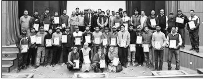
Guests and participants after the training program of Sarhad Kargil International Marathon.

The training program which was part of a series of training ses-