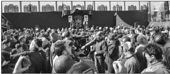
Martyrdom anniversary of Harzat- E-Imam, Ali: During the congregation rally organised by Imam Khomeini Memorial Trust(IKMT), and Anjuman-e-Jamiat Ul Ulama Isna Asharia in Kargil.