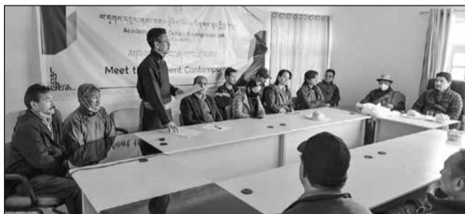
During the meeting of Ladakh Cultural Forum with CEC, Hill Council, Leh.

Ladakh Cultural Forum welcomed Hill Council Leh's initiative of celebrating Bhoti language day starting this year and also highlighted suggestive measures to preserve the traditional art, culture, and language of Ladakh. The members of Ladakh Cultural Forum also raised their concerns and put forth various issues and the need for having a good policy on heritage preservation, promotion of literary art