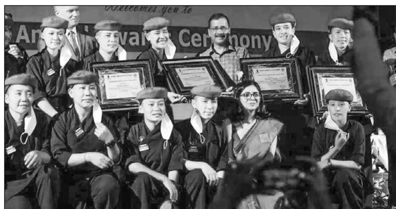
Kung Fu Nuns receiving International Women's Day Award from Delhi Commission for Women at Stein Auditorium, Delhi.

Awarded for their extraordinary achievements in the field of women empowerment, disaster relief, and environmental conservation and breaking societal barriers