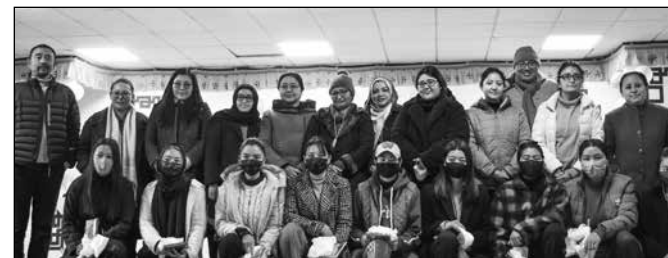
During the celebration of International Women's Day in EJM College, Leh.

LEH: College Student Council along with the College Gender Sensitization Committee- (GS-CASH) celebrated International Women's Day on March 8 at Eliezer Joldan Memorial College.