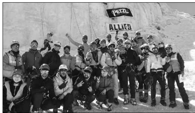
During the concluding day of the 3rd Ice climbing festival in Gangles, Leh.