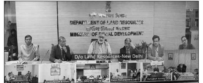
During the launch of the National Generic Document Registration System in Ladakh by the Ministry of Rural Development.

Terming the introduction of NGDRS and SVAMITVA as timely in Ladakh, LG Mathur stated