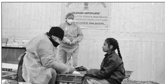
During the Medical and Aadhaar enrolment camp for the street children.