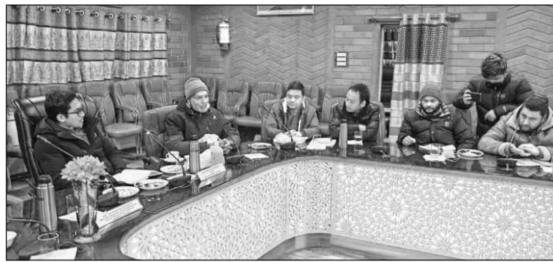
During the celebration of the International Mother Language day organised by Ladakh Academy of Art Culture and Languages (LAACL) Kargil.