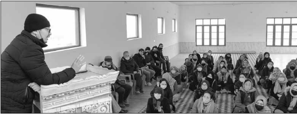
During the awareness camp regarding the Pradhan Mantri Formalisation of Micro Food Processing Enterprises (PMFME) scheme.