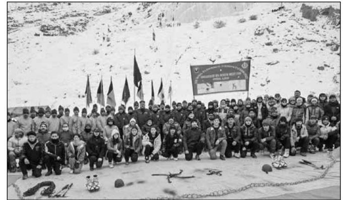
During the inaugural ceremony of the two days Ice wall climbing competition-2022 at Gangles.

LG Mathur said that events such as skiing, ropeway, snow sculpture, walking and marathon on ice have the potential to make Ladakh a top winter destination for tourists. He also stated that