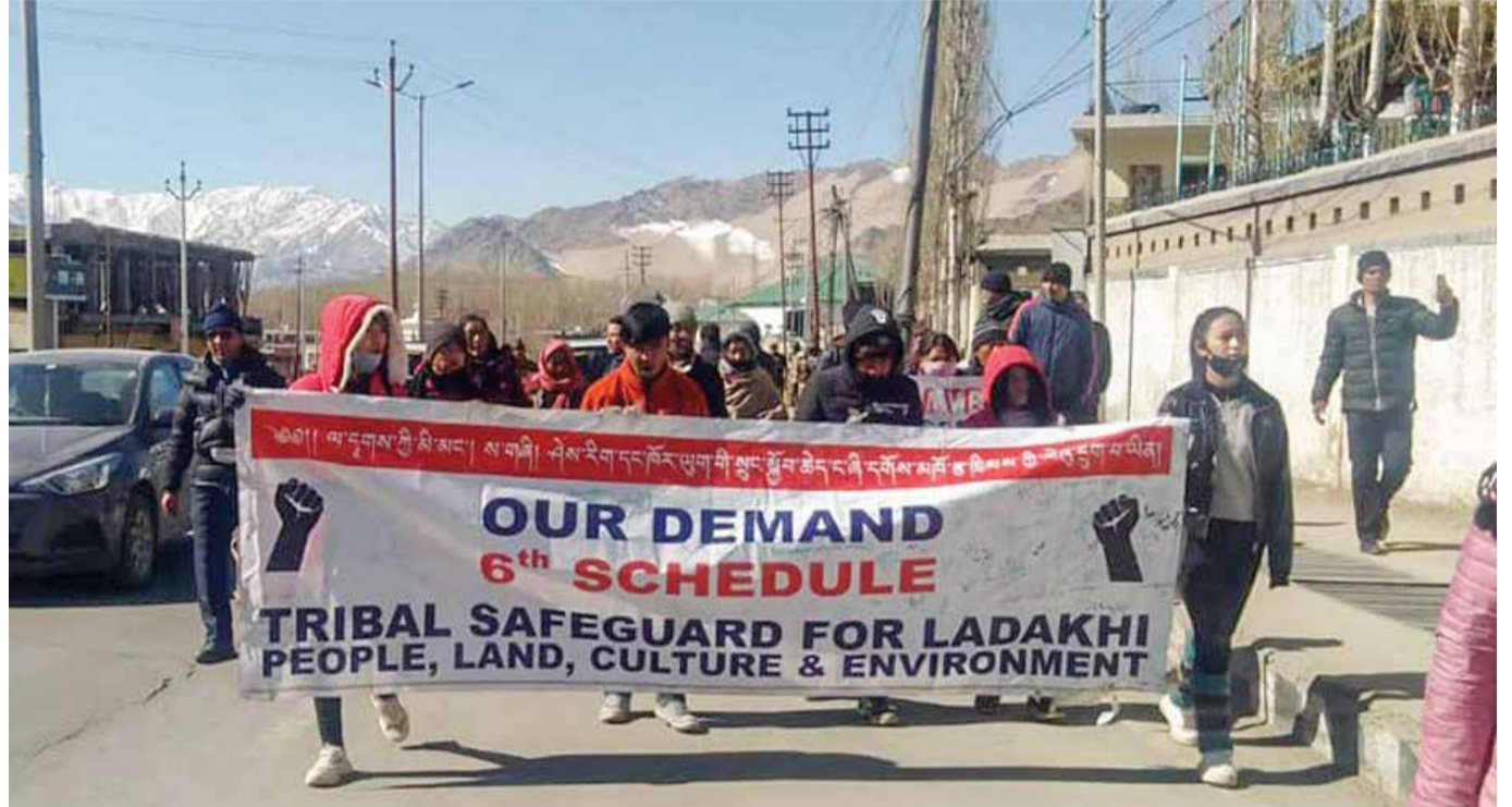
Peace protest rally lead by Ladakh student associations under the banner of Student Organisation for Unified Ladakh on February 10, 2020.

In olden times persons interested in obtaining higher education in Buddhist religion and philosophy would look to Tibet for spiritual guidance and would undertake the arduous journey on foot.