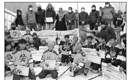
Players of the 1st BDC Cup Inter Panchayats (Rolling Trophy) Sub Junior (under 16) Ice Hockey Tournament.

EC said in the past two years, winter sports are getting popular and athletes have displayed their sporting skills at various national events and brought laurels not only to Kargil but for the entire