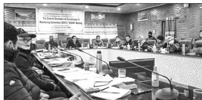
MP Ladakh, Jamyang Tsering Namgyal chairing the meeting of the District Development Coordination and Monitoring Committee.

He also reviewed the financial and physical achievements of all the centrally sponsored schemes under implementation by various executing agencies in the