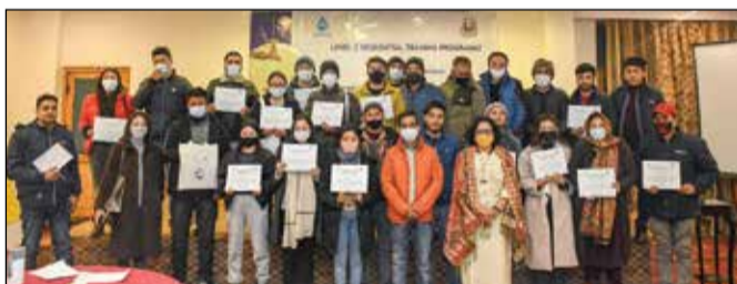
Participants of two-day (level 2) training programme organized by the All India Institute of Local Self-Government (AIILSG) for UT Ladakh officials, under the National Jal Jeevan Mission.