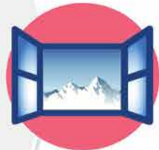
མཚམས་རེ་རྒྱར་ཁྱུང་ ཕྱིས་ཏེ་བཞུགས།