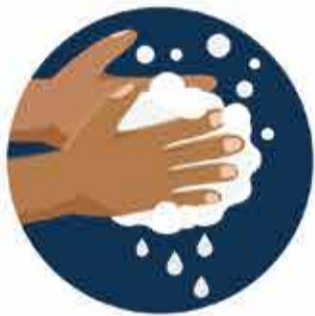
ཕྱག་བསིལ་ཡང་ཡང་མཛོད།