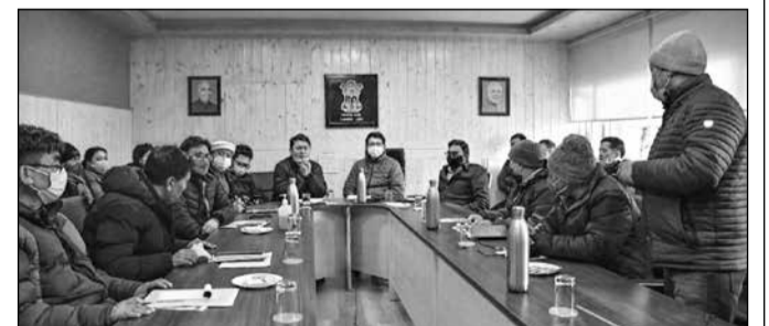
Reviewing and discussing various measures on the implementation of the National Education Policy 2020 and the rationalization of schools in Leh Ladakh.

CEC Gyalson emphasised the need for school management committees to look after the mental and physical health of students in schools and stressed on the need for upgrading quality of school education in the border areas. He further directed the officials of the school education department to come up with a