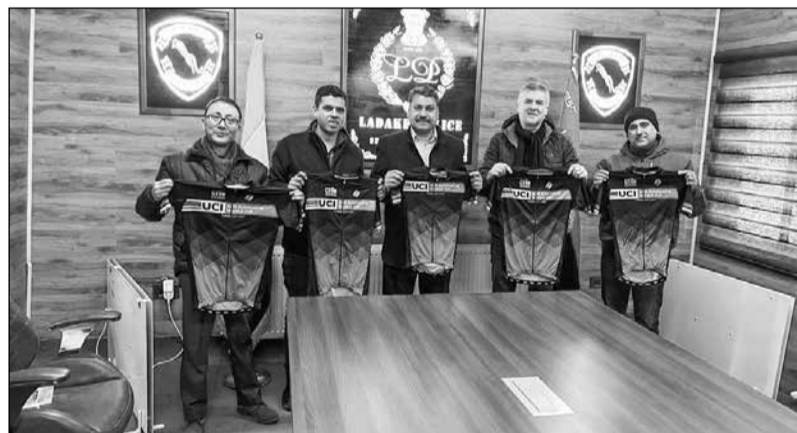
During the launch of official UCI Mountain Bike Eliminator World Cup jersey.

The international cycling event will be held in Leh on September 4, 2022.