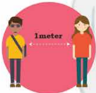
བར་རྒྱ་འཕྲོད།