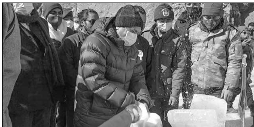
Lieutenant Governor, Radha Krishna Mathur during the concluding day of the First Ladakh Ice & Snow Sculpture workshop in Leh.

Due to the prevailing COVID-19 situation