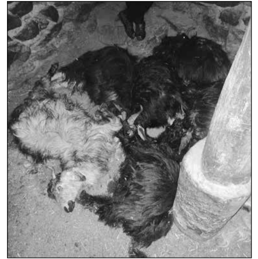
Goats killed by snow leopard in Lankarchey.

Earlier on 29 January 2022, a snow leopard attacked and killed 23 sheep in Lankarchey village and more than 10 sheep were killed by stray dogs attack.