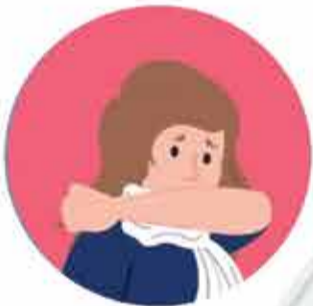
ཚོད་ཚྲིད་སྲུ་མོད་ འབྲིད་རས་ཀྱི་སྡོད་དུ་སྲོད།