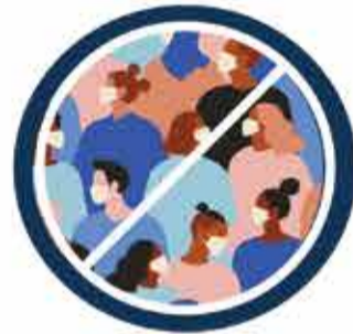
མི་མང་པོ་འཛོམས་ས་མ་སྲོད།