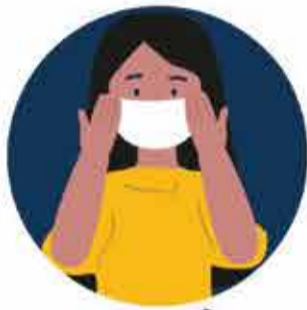
ཁ་རས་བཏགས་ཏེ་བཞུགས། གདོང་ལ་ལག་པ་མ་སྤྱག