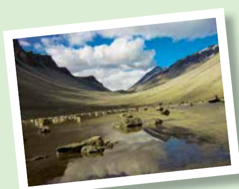
Don Juan pond, Antarctica

● The Tso Kar Basin is a high-altitude wetland complex, which includes two connected lakes, the freshwater Startsapuk Tso and the larger hypersaline Tso Kar.