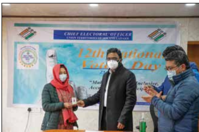
District Election Officer/ DC, Leh Shrikant Balasaheb Suse distributing the election card to the newly registered voters during the celebration of 12th National Voters' Day, themed 'Making Election Inclusive, Accessible & Participative'.