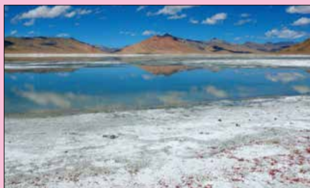
Tso Kar Wetland Complex added as 42nd Ramsar site, the second one in the Union Territory of Ladakh.

A call to take action for wetlands is the focus of this year's campaign. It's an appeal to invest financial, human and political capital to save the world's wetlands from disappearing and to restore those we have degraded. 2 February 2022 is the first year that World Wetlands Day will be observed as a United Nations international day, following its adoption by the General Assembly on 30 August 2021 in a resolution co-sponsored by 75 member states.