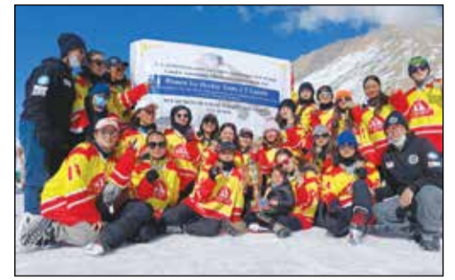
Women Ice Hockey team of UT Ladakh winner of the 9th IHAI National Women Ice Hockey Championship.