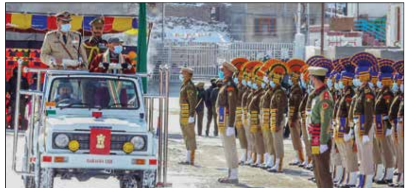
L-G Mathur inspecting the parade contingents during the 73rd Republic day celebration.

Administration making continuous efforts to empower elected bodies: L-G