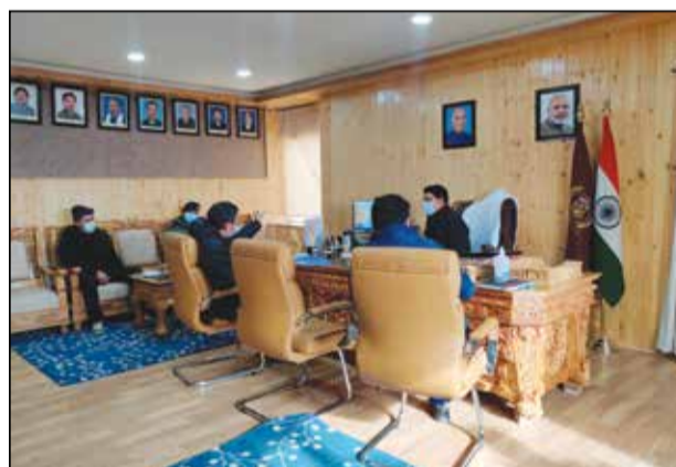
The Chairman/CEC, LAHDC Leh, Tashi Gyalsen convened a comprehensive meeting to review the public health preparedness for COVID-19 in Leh district.