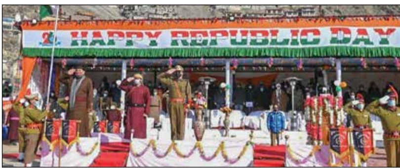
Chairman/CEC, LAHDC Kargil, Feroz Ahmad Khan after unfurling the national flag during the 73rd Republic day celebration in Kargil.