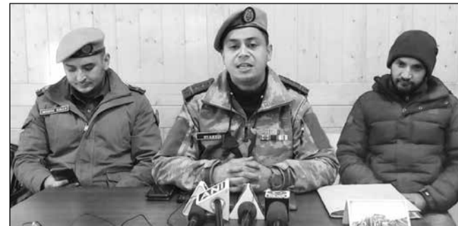
The team of SIT Cybercrime unit, Leh during the Press Conference.

He expressed his gratitude to the team of the cyber-crime unit, Leh Ladakh Police for the im-