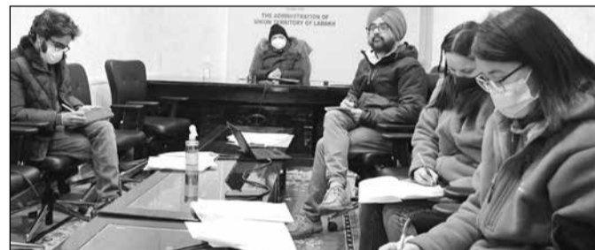
During the first meeting of the Ladakh Biodiversity Council.