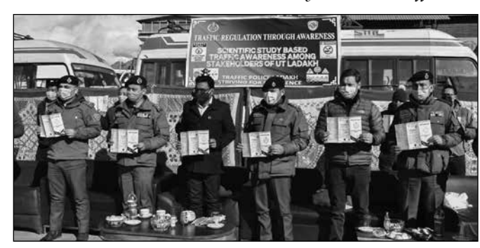
During the release of the traffic awareness pamphlets.

Further, he informed that a separate traffic wing was created last year in August 2020 and has collected approximately ₹1 crore fine from the violators. He assured that in the coming days' similar awareness camps would be conducted in different blocks.