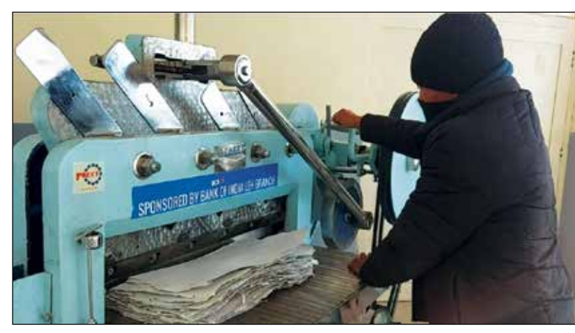
PAGIR member cutting the recycled papers.

Initiates 'Jungwa Shrungskyob' project, an effort to reduce garbage by recycling the wastes into useful products