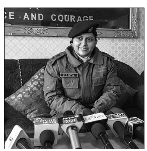
PD Nitya also aims to ensure police and public relationship friendly by organizing various outreach programme specially for the youths. The activities will be more youth-oriented to show the friendly and progressive side of the police.

Talking about the crime against women cases that go unreported she said, "It will be prime challenges which need to be overcome and every effort will be done. The change has to come from the society but from the police point of view, we will make the reach to police very accessible and the remedy or action will be taken as per law."