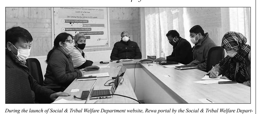
ment, and registration and issuance of birth and death certificate and online rent collection/payment service.

Also launches e-services for Birth and Death registration certificates,rent collection/payment