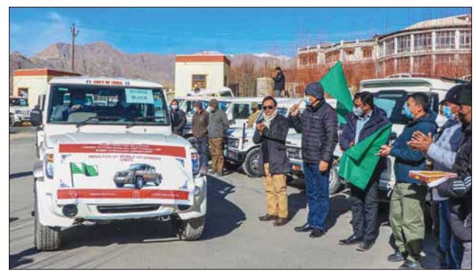
Seven Veterinary Field vehicles were allotted to different blocks of the district. The vehicles were flagged off by the Chairman/CEC, LAHDC Leh, Adv. Tashi Gyalson in presence of EC Tashi Yakzee. The vehicles were purchased under the District Capex Budget of the Sheep Husbandry Department, Leh.