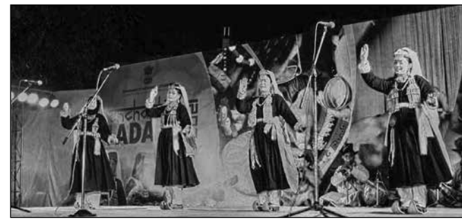
Artists of Ladakh performing cultural dance at Dilli Haat, New Delhi.

Exquisite Handicrafts and Handlooms on show till year-end