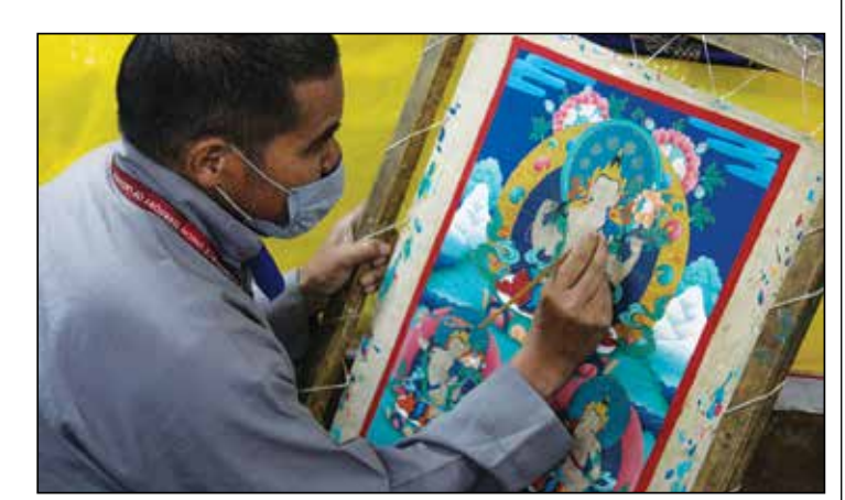
The 3rd Edition of Enchanting Ladakh, an Exhibition cum Sale of Handicrafts & Handlooms of Ladakh is ongoing at INA Dilli Haat, New Delhi.