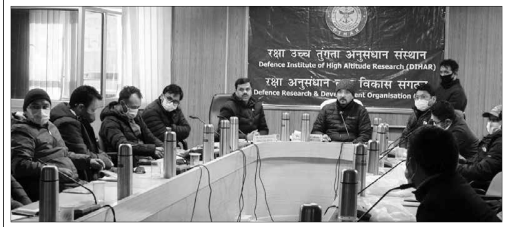
Members of Hill Council and officials of DIHAR reviewing the progress of Ladakh Green House.