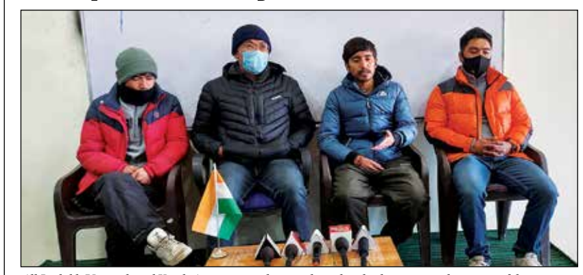
All Ladakh Unemployed Youth Association along with student bodies raising the issues of the growing unemployment crisis in the region.