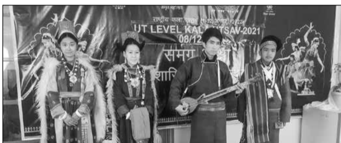
Participants of the UT level Kala Utsav-2021.