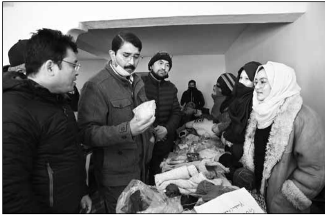
Secretary, Rural Development Department interacting with the Self Help Group (SHG) members at Yourbaltak.

Inspects ongoing developmental works under RDD, reviews NRLM