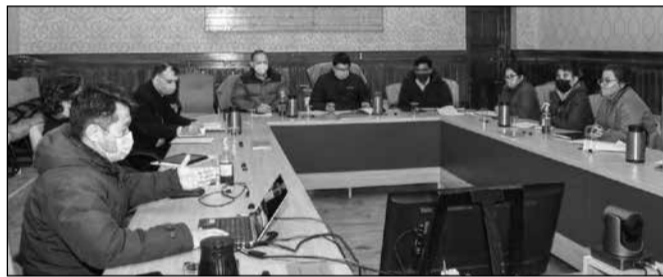
Concerned officers and stakeholders discussing the plans for establishing a Dark Sky Reserve at Hanley village in the Changthang region.