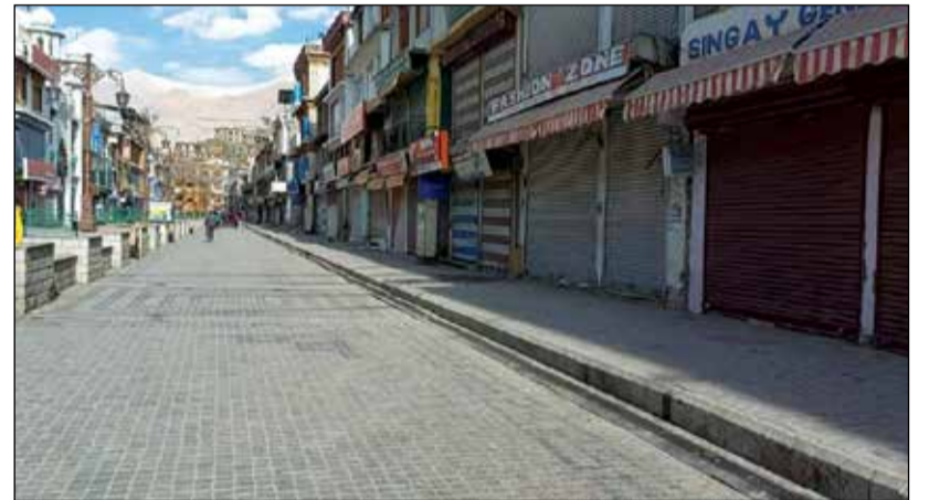
The closed shops of Leh market during the complete shutdown of Ladakh Over statehood demand.

BJP not in favor of statehood, stands firm on the constitutional safeguard for Ladakh on the line of the sixth schedule: MP Ladakh