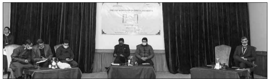
During the one-day workshop on Digital Payment in Leh.