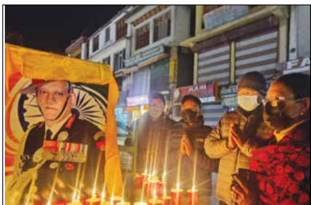
BJP Ladakh organised a candle march as a tribute to first CDS of India, General Bipin Rawat, his wife and other officers who died in an Indian Air Force (IAF) chopper crash near Coonoor in Tamil Nadu. The candle march began at Leh Gate and culminated at Leh Market.