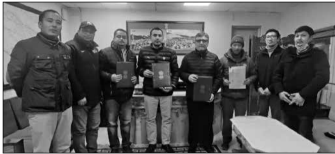
During the signing of the Power Purchase Agreement (PPA) for buying power from SECI for the 50MWdc Solar project.

The 50MWdc Solar project is being developed with CFA under PMDP-2015, at Taru, Leh. It was informed that the power from this project will be bought by PDD Ladakh at Rs 2.22/unit as mandated vide MNRE Sanction Order Dated:08.11.2021.