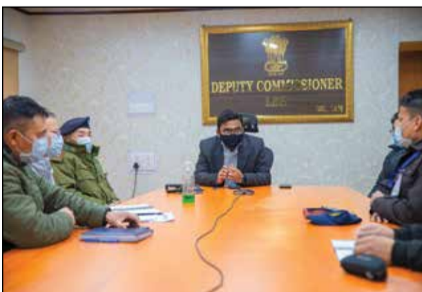
Chairman, DDMA, Leh and the concerned officials discussed the state of preparedness of Covid Care Centres, quarantine centres, medical equipment, medicines, manpower, etc due to the surge in Covid-19 positive cases in Ladakh.