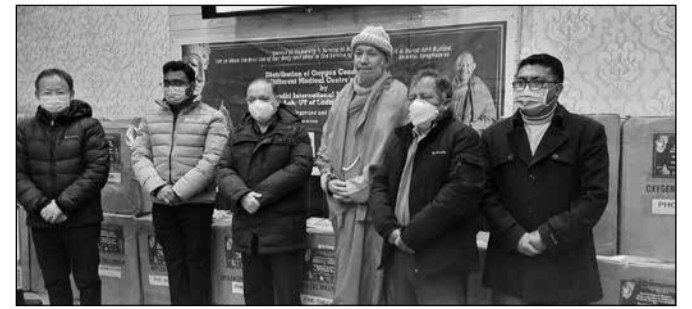
During the handing over of the oxygen concentrators by the Mahabodhi International Meditation Centre in collaboration with the Mahakaruna Foundation Delhi to the health department, Leh.