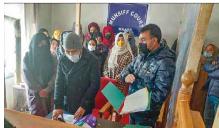
Tehsil Legal Service Authority (TLSA) Drass in collaboration with Government Degree College Drass organized day-long live legal proceedings students of semester for 4th and 6th.