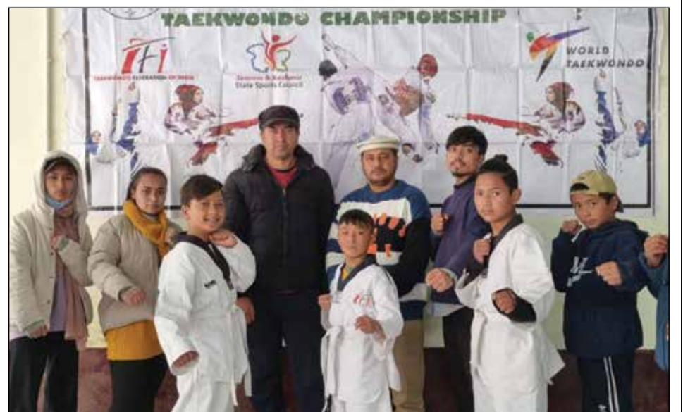
Leh Taekwondo Association participated in the 1st UT Ladakh Taekwondo Championship at Indoor Stadium Kargil organised by Ladakh Taekwondo Association. The team comprises of 12 players from different part of Leh District compete with 230 other players of Ladakh.