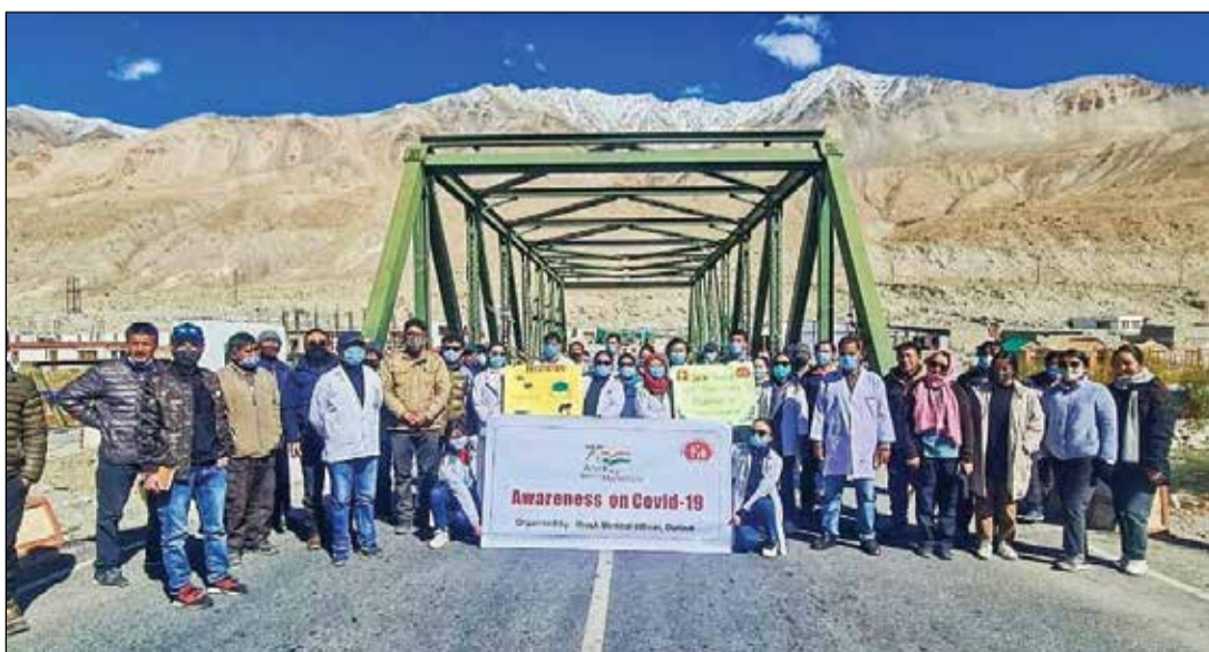
ICDS Project Durbuk celebrated Iconic Week by organising rally on Covid-19 awareness in collaboration with Health Department as a part of Azadi Ka Amrit Mahotsav celebration.