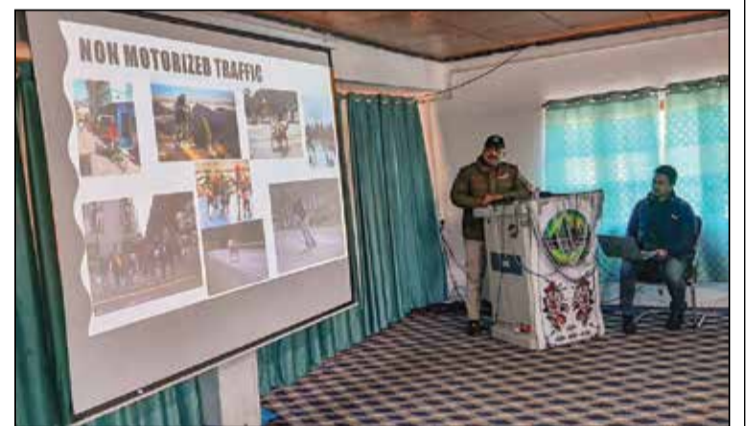
Traffic Police, Leh organised road safety awareness at Government Degree College, Drass.