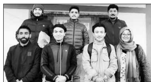
Newly elected executives of the Student Council of a Govt Degree College, Kargil.