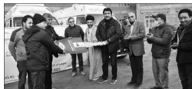
NHIDCL officials handing over the ambulances to the officials of Hill Council, Kargil.