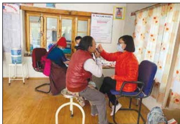
Medical camp organised at Medical Sub Centre, Trith village in Nubra sub-division as a part of Azadi Ka Amrit Mahotsav celebration.