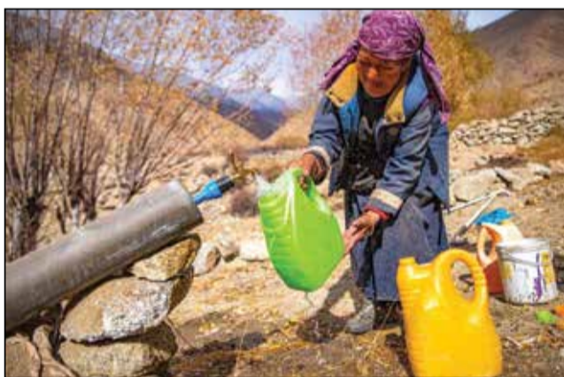
Jal Jeevan Mission: Villagers of Umla happy to get functional water connection.