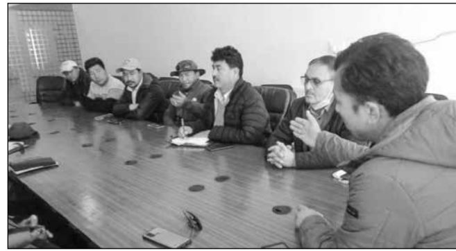
Executive Councilor for Tourism and Zanskar Affairs, Er Punchok Tashi during a meeting on various religious monuments coming under the road alignment works construction realignment works of the Kargil Zanskar Road NH-301.