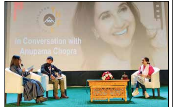
The Himalayan Film Festival 2021: During the In-conversation session with Anupama Chopra, renowned film critique. Sharing her role as a film critic, Anupama said that it's her passion for films and story telling that keeps her going in her work. She shared that the emergence of OTT platforms is a golden period creating a space to think out of the box thus, breaking stereotypes.