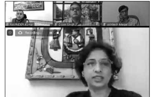
Conference on Carbon Neutrality related to Action towards India's low Carbon future being held virtually

He further added that UT Administration is working on setting up of 50 MW Solar project at Leh