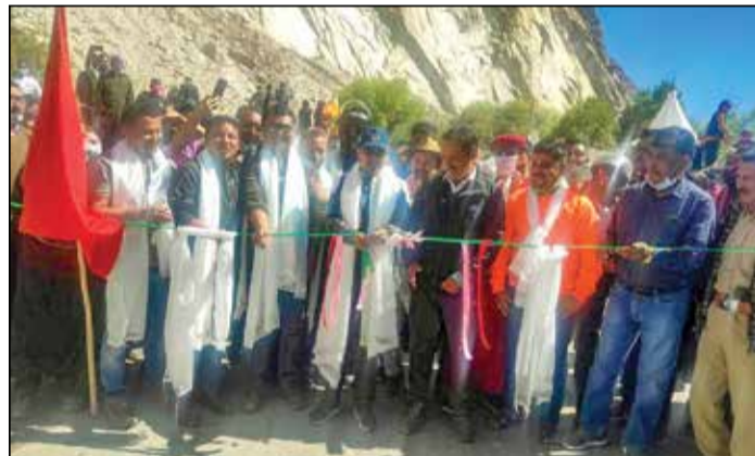
Celebrating World Tourism day themed, 'Tourism for Inclusive Growth', Member of Parliament, Ladakh, Jamyang Tsering Namgyal opened Siachen Base Camp for domestic tourists.