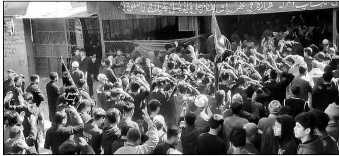
Mourner's beating their chest and reciting Noha in memory of Hazrat-e-Imam Hussain (A.S) during the Arbaeen procession in Kargil.

Day of Arbaeen is observed to pay tribute to the sacrifice of Hussain for social justice