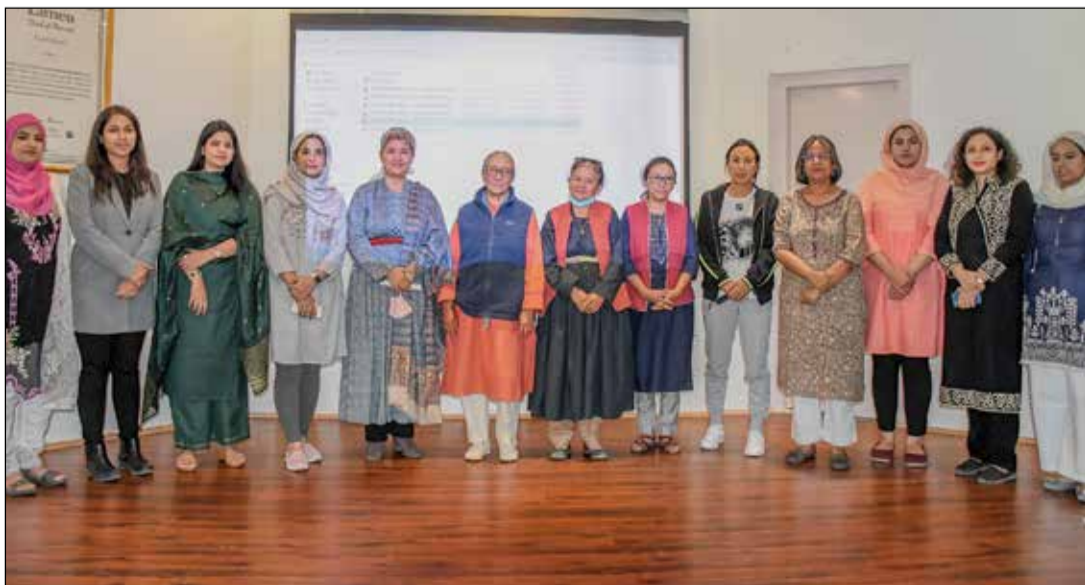
A program-themed 'My Story' was organised by the Northern Region- II of Power Grid Corporation of India Limited (POWERGRID) in coordination with the Social Welfare Department of UT Ladakh. Women executives of POWERGRID and women achievers of Ladakh met and interacted with each other.