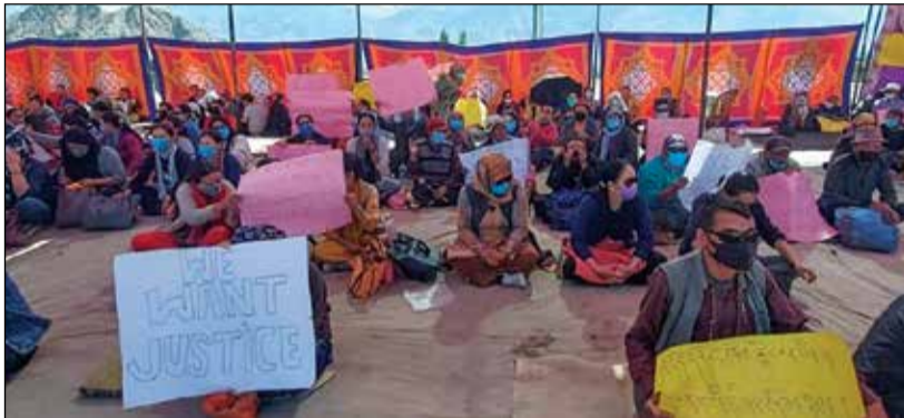
Daily wagers working in various departments under the banner of All Daily Wagers Union of UT Ladakh on protest in Leh.