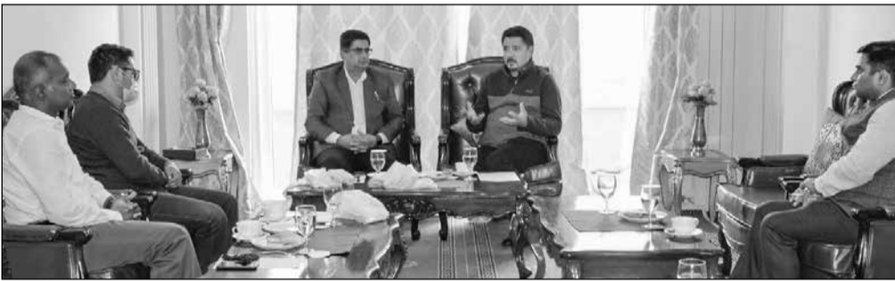
CEC, Hill Council, Leh Tashi Gyalson met Minister of Agriculture Horticulture/ASH/IPR of the Government of Sikkim along with other officials in Leh.

Discusses strengthening of agriculture sector in Ladakh