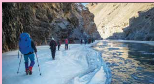
The famous Chadar trek of Ladakh which attracts thousands of tourists from all over the world. The trek on the frozen river begins from a village called Chilling from where the Zaskar River starts to freeze. Chadar trek, brings tourist to Ladakh in the harsh winter months.

The theme of World Tourism Day, 2021 is 'Tourism for Inclusive