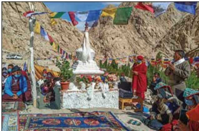
The Shangdong to Stupa conversion is an initiative by Nature Conservation Foundation NCF and concern community, to neutrilize the cruel practice of retaliation killing of predators, in the ancient times to protect the village flock and heard of Livestock owned by the households and village. Hemya is the third such initiative after Chushul and Gya.