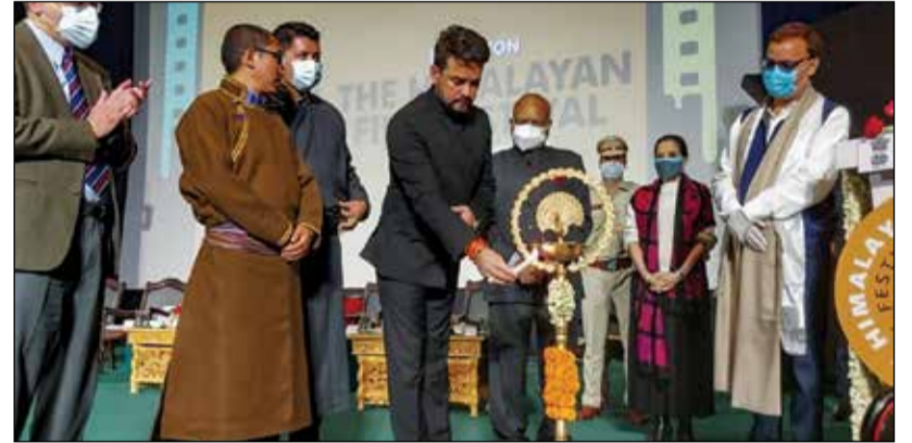
Union Minister for Information and Broadcasting, Anurag Thakur lighting the lamp during the inaugural function of the First Himalayan Film Festival at Sindhu Sanskriti hall, Leh.

Ladakhi Film, 'Sekool' and 'Shadey- A Forgotten Land' among the award winners