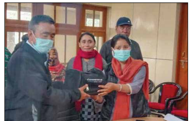
One day workshop on the implementation of Jal Jeevan Mission (JJM) was organised by Public Works Department (PWD), Public Health Engineering (PHE) Department, Zaskar. Engineers of concerned departments, PRI members, and members of Village Water Sanitation Committee Zaskar attended the workshop.