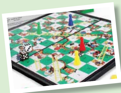
Snakes and ladders board game

● National Nutrition Week was launched by Food and Nutrition Board in 1982 and is observed throughout the country in the first week of September. The week is celebrated with an objective to raise awareness on the importance of nutrition for health which has an impact on development, productivity, economic growth and ultimately national development. ● 'The Musalman' is India's (and possibly the world's) only handwritten newspaper. Started in the year 1927 in Chennai, the newspaper is handwritten