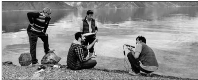
Team of scientists from the Indian Council of Agricultural Research (ICAR) - Directorate of Coldwater Fisheries Research (DCFR), Bhimtal, Uttarakhand exploring Pangong lake.

Meanwhile, a stakeholders' meeting for the convergence of research and development or-