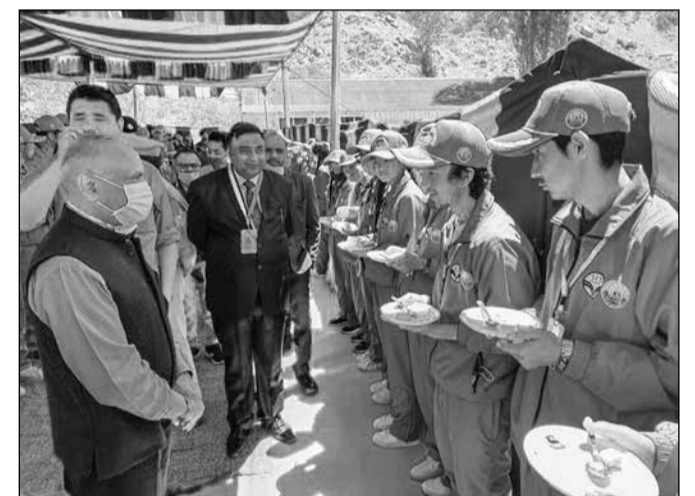
Lt. Governor interacting with the selected students during the inauguration of classrooms, hostels under the 'Ladakh Ignited Minds' project.

Addressing the inaugural event, LG Mathur praised Fire and Fury Corps initiative under Lt. General PGK Menon and acknowledged their notable contribution in making available the much-needed classes for