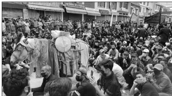
Shia Muslims beating their chest and reciting lamentation during the mourning procession.

He further stressed people understand the teaching of real Is-