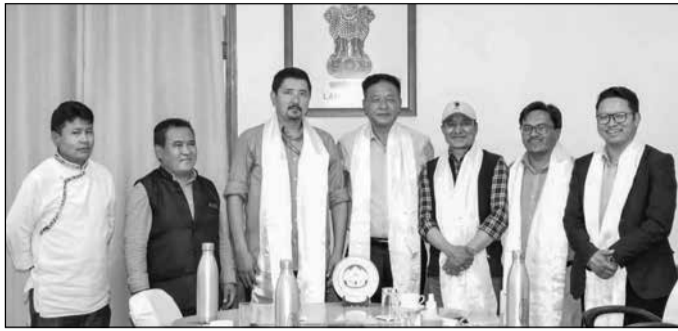
Officials of Hill Council, Leh and Central Tibetan Administration at the Council Secretariat, Leh.