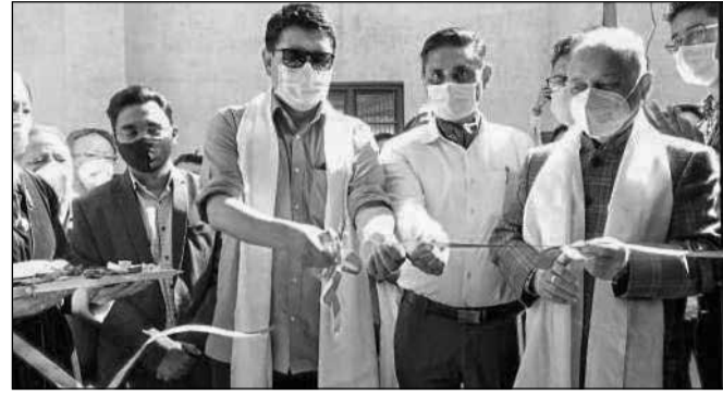
During the inaugural ceremony of the first-ever 1.5 Tesla MRI (Magnetic Resonance Imaging) machine at MRI Centre, SNM Hospital Leh.