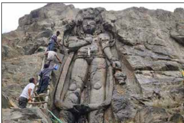
LBA Youth wing Kargil organised a cleanliness drive cum washing of statue (skuthus) of Maitreya Buddha (Kartse) in Sankoo.