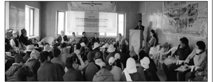
During an awareness programme on scientific yak husbandry with supports to the tribal yak farmers at Nyoma.