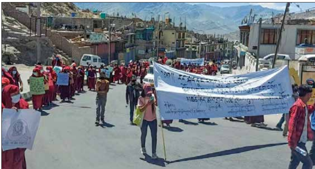
A peace protest rally was organised by the students of CIBS supported by all Ladakh student organisations, religious leaders on August 17. Raising their demand for implementing UGC rules and regulations in CIBS, the rally started from NDS ground and culminated at the Balkhang Chowk in the Leh market.