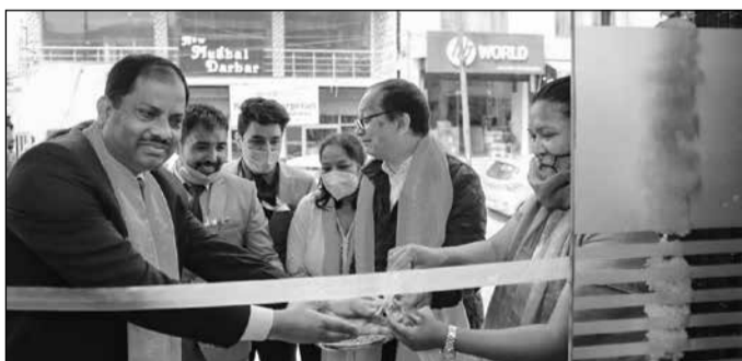
Inauguration ceremony of the new branch office of the Union Bank of India at Skara, Leh.