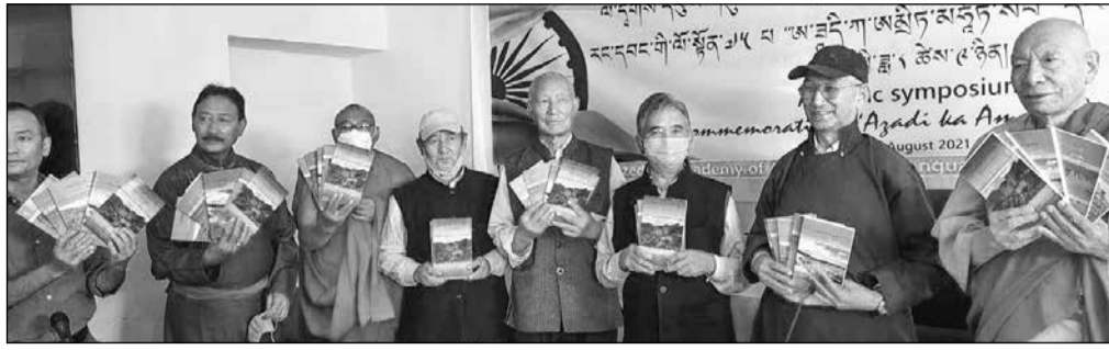
During the release of Bi-monthly journals and publications 'Sheeraza' and the first Ladakhi Publications of 1976 'Shesrig Melong' translated in English.