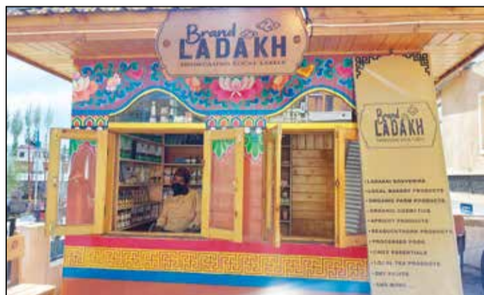
Brand Ladakh, an initiative by Department of Industries and Commerce to bring all local entrepreneurs under one roof and sell their products under one banner.