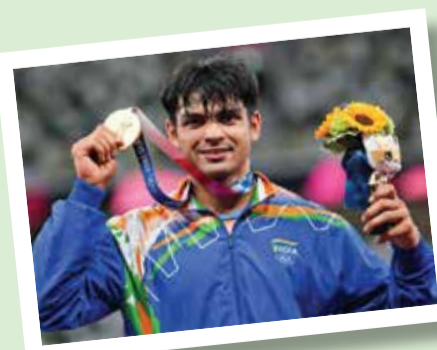
Indian Javelin thrower Neeraj Chopra

● Indian Javelin thrower Neeraj Chopra became the first athlete from the country to win a gold in track and field in the Olympics. He threw a distance of 87.58m to pick up the gold medal at the Tokyo Olympics 2021.