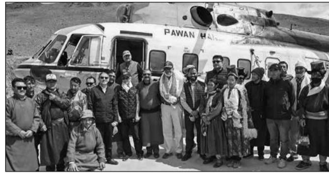
Successful trial landing of Pawan Hans MI-172 helicopter at the newly constructed helipad at Sapi village.

Recce of helipads conducted in Barsoo Khandi and Chechesna Sankoo to check the feasibility of helicopter landing