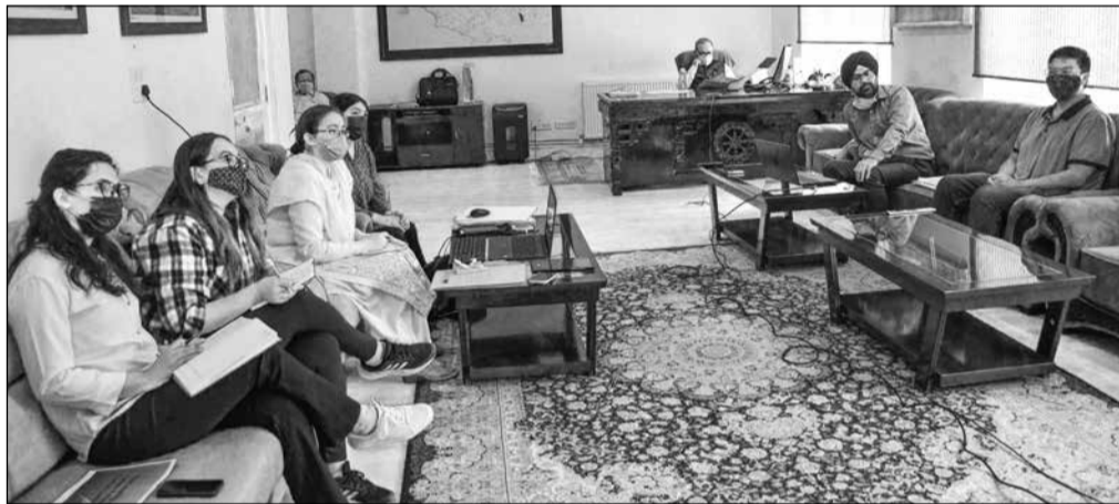
During the first meeting of the Pollution Control Committee at the UT Secretariat.

Committee approves proposal to outsource scientific and administrative staff