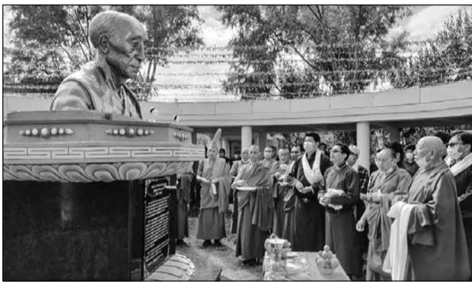
Unveiling of H.E Late 19th Kushok Gyalsras Bakula Rinpoche's bust at Council Secretariat, Leh.

Addressing the gathering, MP Ladakh highlighted the contri-