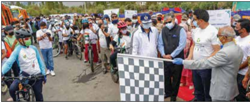
RK Mathur flagging off the cycle rally organised by Ladakh Police in which more than 50 cyclists took part.

Cleanliness drive, e-buses, cycle rally, and Leh Phonya magazine launched during the occasion