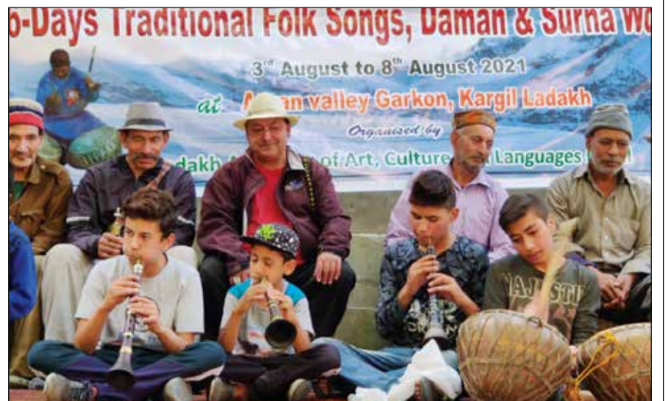
7 days long traditional folk music (daman and surna) workshop organised by the Ladakh Academy of Art Culture and Languages Kargil at Garkhon Changrah. Around 30 children participated in the music workshop.