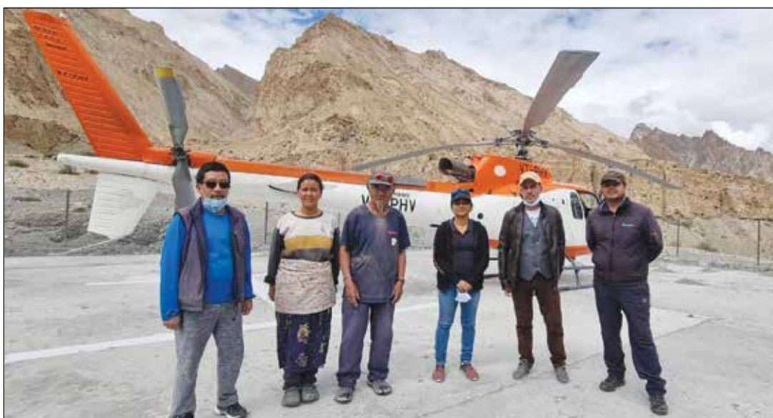
Pawan Hans conducted successful trail landing at Markha Helipad.