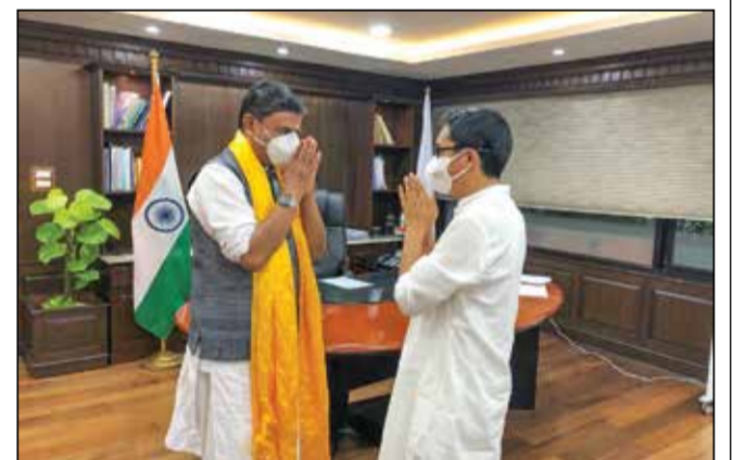
Member of Parliament, Ladakh, Jamyang Tsering Namgyal, called on Minister for Power and New & Renewable Energy, R.K Singh, and discussed various issues related to power and renewable energy of Ladakh.