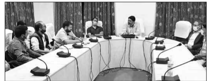
Taxi Union Kargil discussing route permit issue with the Divisional Commissioner cum Secretary Transport Ladakh Saugat Biswa at Tourist Facilitation Centre.

The representatives of Taxi Union Kargil urged the Secretary Transport to allow them to freely ply on the inner routes of Ladakh without any interruption. They further requested to remove all blockades in both the districts of Leh and Kargil and also demanded to approve and revise the new rate list for the taxi operator unions.