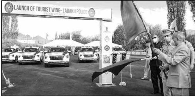
Lieutenant Governor, RK Mathur flagging off Ladakh Police Tourist Wing vehicles at Police Line, Choglamsar.