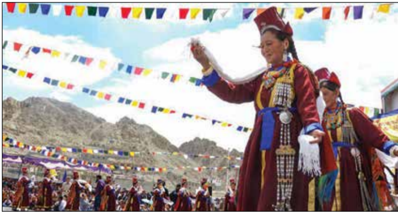
Women of Ladakh with traditional attire performing folk dance at Polo ground during the Ladakh Festival celebration.