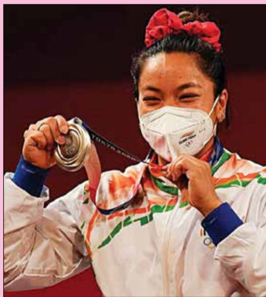
Mirabai Chanu, who clinched a silver medal in the 49kg women's weightlifting category in the Tokyo Summer Olympic Games, 2021.

The first Summer Olympic Games in 1896 were held with fourteen participating countries. Then 200 of the 241 sportsmen were from Greece and there were 43 sports events held in 9 sports.