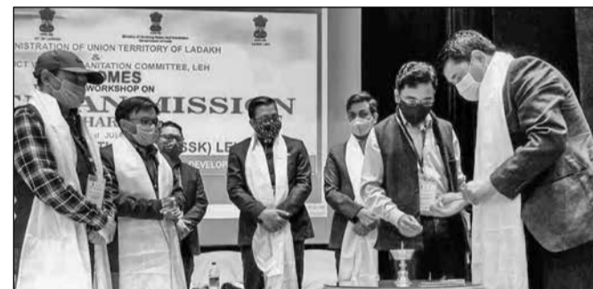
During the launch of the two-day workshop on the implementation of Jal Jeevan Mission in Ladakh.