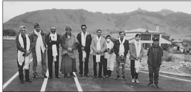
Super specialists and specialist doctors from the All India Institute of Medical Sciences (AIIMS) along with members Ashoka Mission during the medical camp in Zanskar.