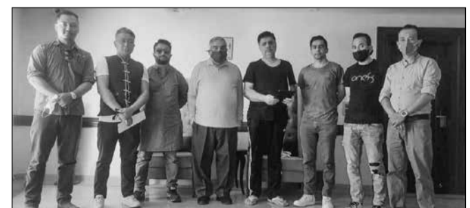
Executives of LDCA along with three member committee of Jammu & Kashmir Cricket Association in Leh.