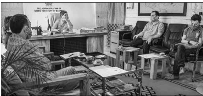
During the first meeting of the Sub-Committee on Higher Education for implementation of National Education Policy (NEP) 2020 in UT Ladakh.