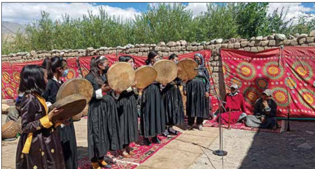
The week-long folk music workshop was organised by the Ladakh Academy of Arts Culture and Languages, Leh, under the aegis of Azadi Ka Amrit Mahotsav, for the children of Ladakh's musician community at Chuchoz Zangchung. A total of 30 students, including 20 boys and 10 girls took part in the workshop.