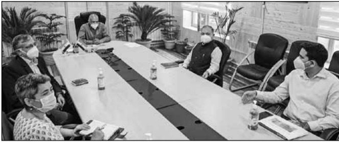
Lt. Governor, Radha Krishna Mathur discussing preventive strategies and control measures for a possible third wave of the pandemic.