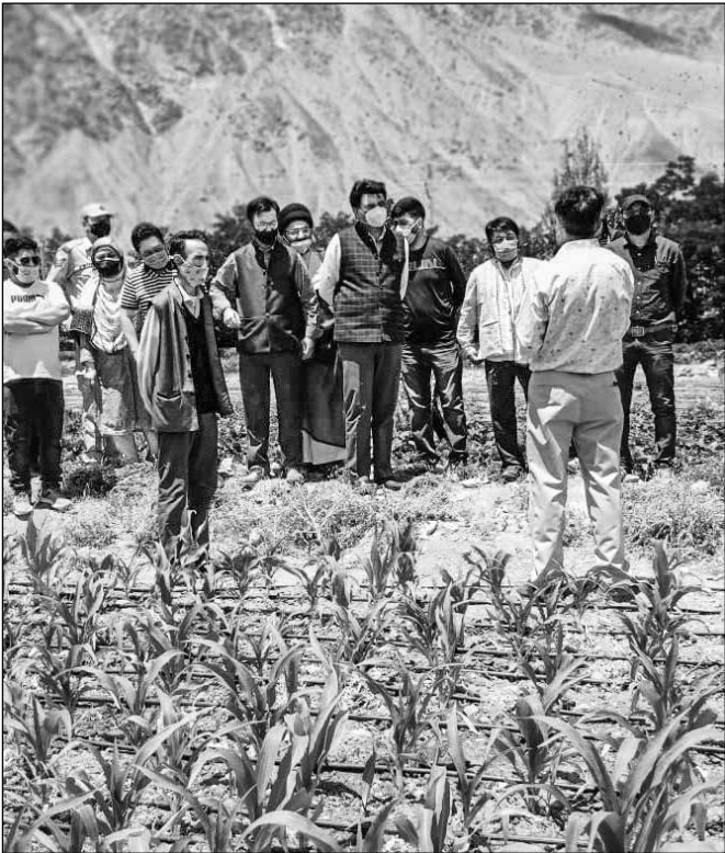
Officials of KVK Kargil demonstrating the techniques and technology of the farm during Technology Demonstration Day.