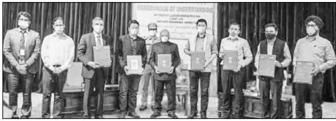
During the signing of an MoU for establishing 1.25 MW Green Hydrogen Generation pilot projects by National Thermal Power Corporation (NTPC).