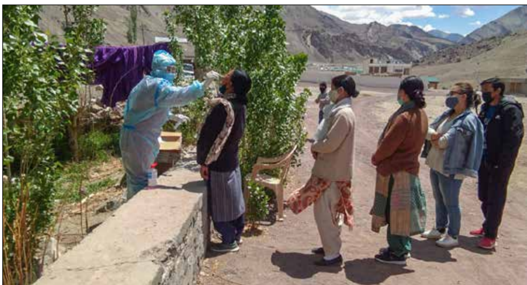
Swab samples of all government employees/outsourcing/daily wagers in different offices of Leh district were collected for tests. Administration has issued the order to collect COVID samples due to the surge in COVID-19 cases in Leh district to take necessary measures to prevent its spread at workplaces.