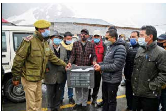
Seva Hi Sangathan: MP, Ladakh Jamyang Tsering Namgyal felicitated the COVID warrior stationed at Meenamarg Screening Point with refreshments as a token of thanks for their dedicated hard work during this pandemic.