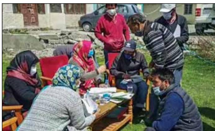
Labour Department, Kargil organised one day camp for registration and renewal of shops and establishments for shopkeepers at Drass.