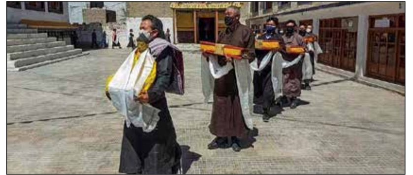
Religious procession "Bhumskor" carrying out in Chowkhang Vihara.