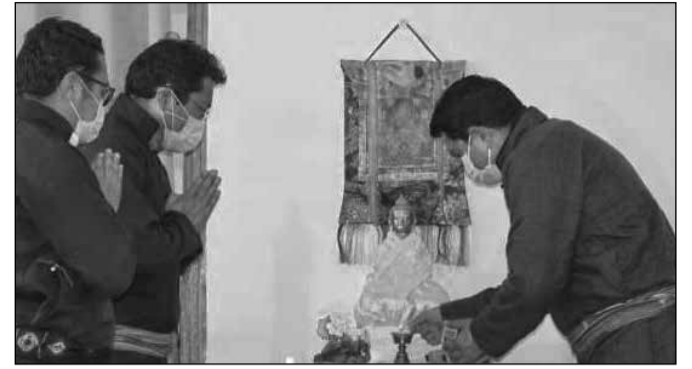
Symbolic 2565th Buddha Purnima celebration at Council Secretariat, Leh