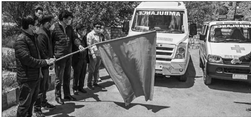
CEC, Hill Council, Kargil flagging off the 8 basic care facility and 1 advanced life support facility ambulances.