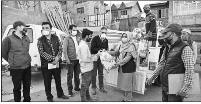
Officials of District Administration, Kargil distributing free food items to migrant labourers.

Food items were distributed among the labourers as per the scale of rice 5 kgs, dal 1.50 kgs, cooking oil 1 litre, Nutri nuggets 1.50 kgs, sugar 0.50 kgs, milk