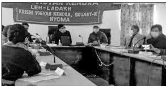
During the 18th Scientific Advisory Committee (SAC) meeting of KVK- Leh at Stakna.