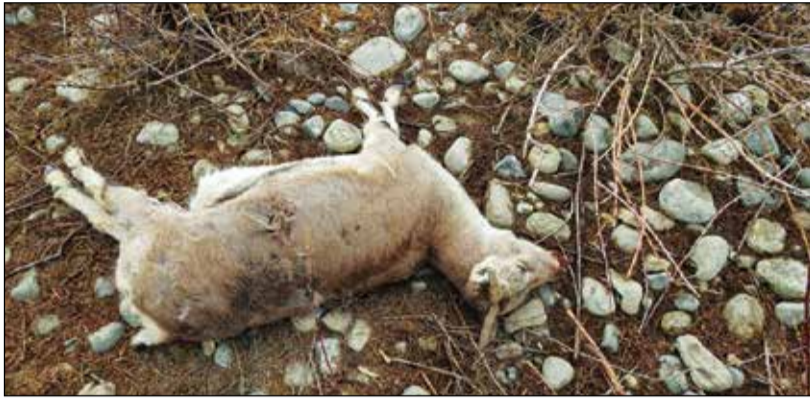
The body of the dead pregnant blue sheep.