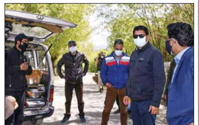
CEC and DC Leh taking stock of the ongoing free ration distribution drive for migrant/local labours by the District Administration, Leh.