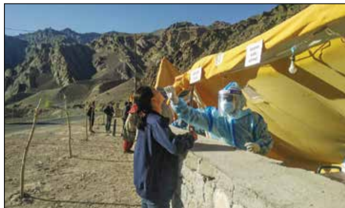
To control the spread of COVID-19 in the region, medical staff taking samples from the passengers at Khaltse checkpoint.