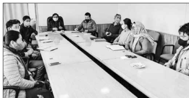
During a meeting of procuring adequate raw Pashmina wools from Changthang region at the Council Secretariat, Leh.