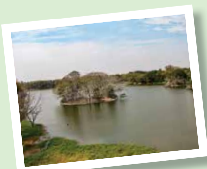
Karanji Lake, Mysore