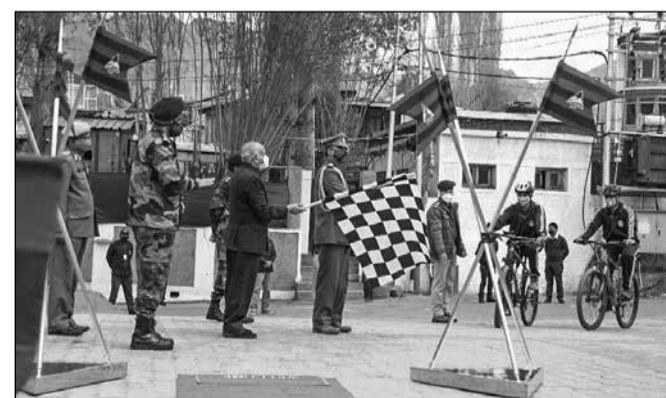
Lieutenant Governor RK Mathur flagging in the cycling expedition undertaken by the Border Roads Organisation's (BRO) on COVID awareness and road safety.