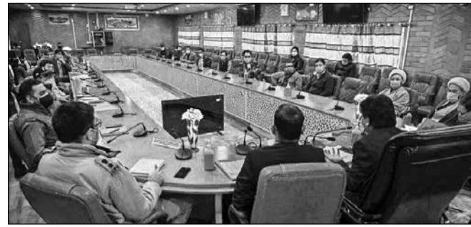
Officials and stakeholders during the review meeting of the COVID-19 pandemic situation convened by CEC, Hill Council, Kargil at Conference Hall Baroo.