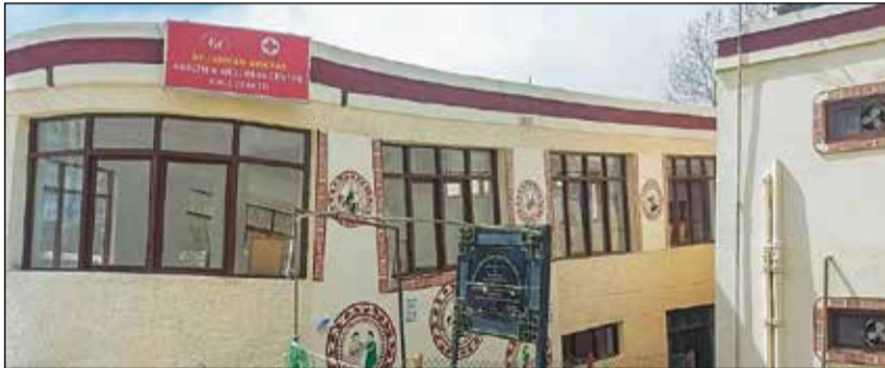
Building of the Primary Health Centre, Sakti.

Enquiry committee states that the doctor, paramedical staff failed in their duty, and is a medical negligence