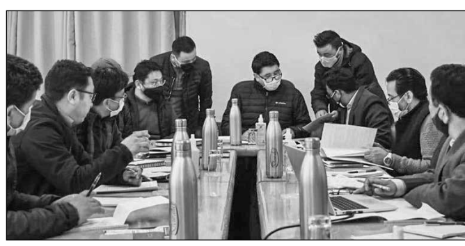
Governing body of Ladakh Renewable Energy Development Agency (LREDA) during a meeting at the Council Secretariat.

The meeting discussed major agenda points which include the requirement of Service Charge for projects by LREDA, Strengthening/Improvement of