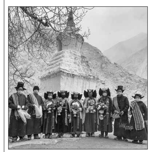
Tukla villagers during the deconsecrating ceremony of Kagan Chorten, an ancient stupa in Tukla on World Heritage Day

Aims to restore ten stupas across Ladakh till October 2021