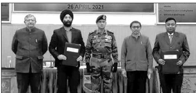
\label{lem:continuous} \textit{During the signing of a tripartite MoU to secure a better future for Ladakhi youth.}

Indian Army signs MoU with HPCL & NIEDO for Ladakh