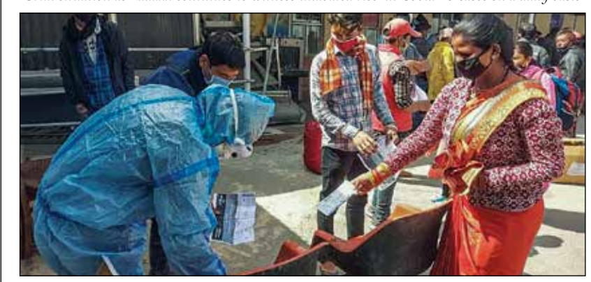
Passengers getting screened at Kushok Bakula Rinpoche Airport, Leh.