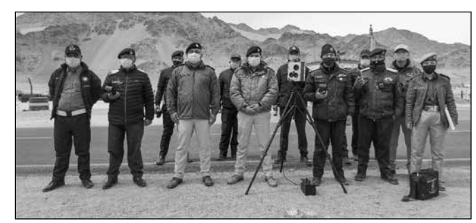
Traffic Police Ladakh during the launch of Radar Speed Gun to detect overspeeding vehicles.

He said that in the recent past people-friendly e-challaning was incorporated by traffic police which is yielding good results