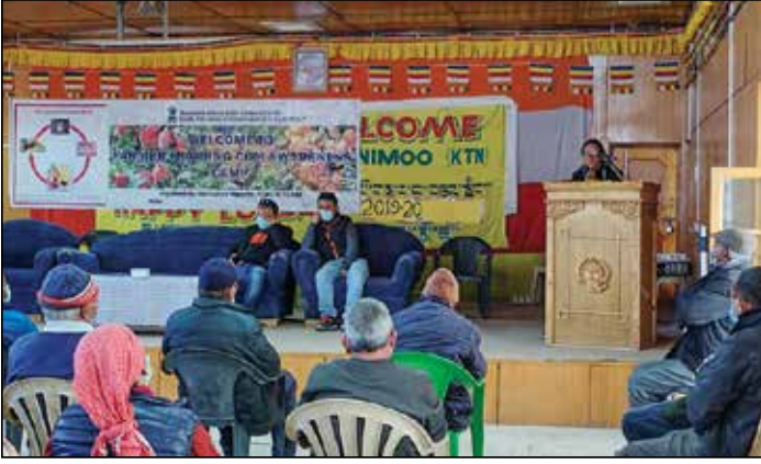
Horticulture Department, Leh organised a one-day farmer awareness programme on 'Management of Codling Moth Inspect on Apple' at Nimoo. A total of 80 farmers, sarpanch and nambardar of the village took part in the awareness programme.