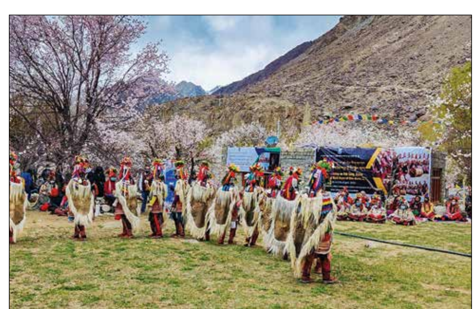
Aryan valley women performing a folk dance during the Apricot Blossom Festival-Chuli Mentok 2021 at Baima, Aryan valley. The festival was organised by the Tourism Department, UT Ladakh.