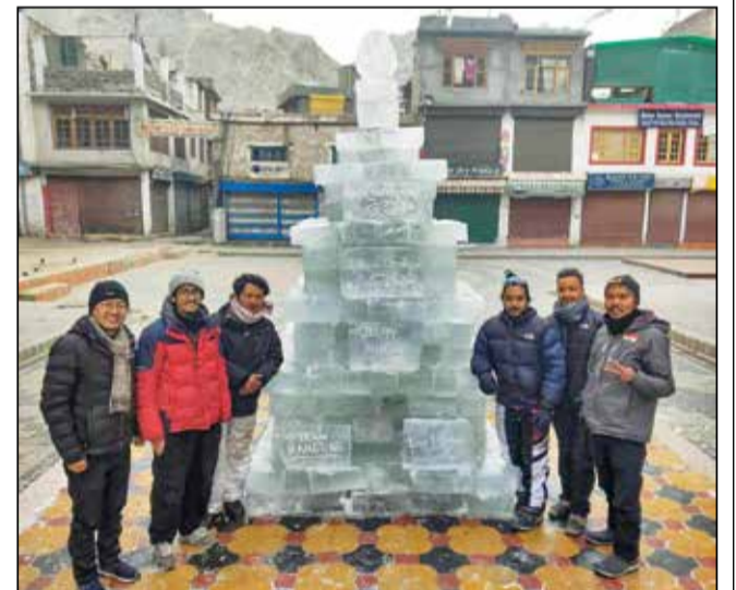
Kangsing International Snow and Ice sculpture team celebrated the birthday of H.H Gyalwang Drukpa and H.E Thuksey Rinpoche in an artistic way. The team carved an ice sculpture at Main market, Leh Ladakh.