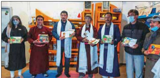
During the launch of Bhoti Story Books at the Next Chapter, a Children's Library setup by 17000 ft Foundation in Zangsti..