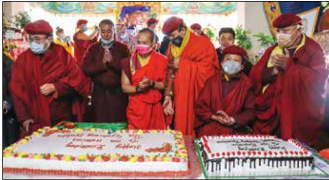
Birth anniversary celebration of His Holiness the 12th Gyalwang Drukpa, and His Eminence Drukpa Thuksey Rinpoche at Shey Naro Photang.

Naropa Fellows and students of Druk Padma Karpo School conduct cleanliness drive