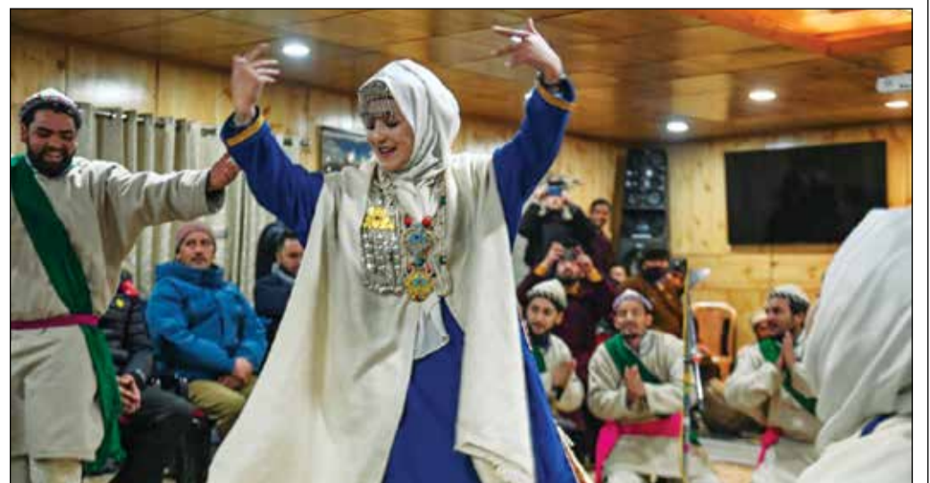
Artists from Kargil performing local folk dance with their traditional dress, showcasing their vibrant culture during Ladakh Winter Conclave in Kargil.