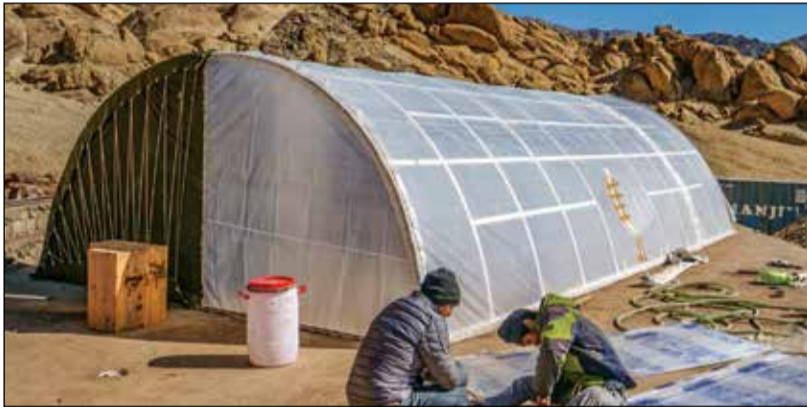
Unique solar powered portable tent named 'Ladakh Tent' designed by Education reformer and innovator, Sonam Wangchuk with HIAL team.

The tent is portable, prefabricated and can be assembled on the spot