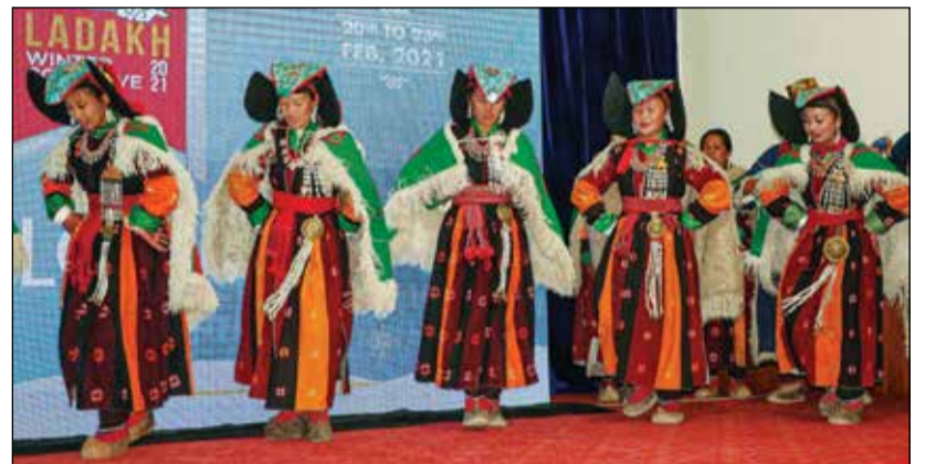
Cultural show during the Ladakh winter conclave.

Ladakh Winter Conclave can help explore region's potential as a formidable tourist destination, says L-G Mathur