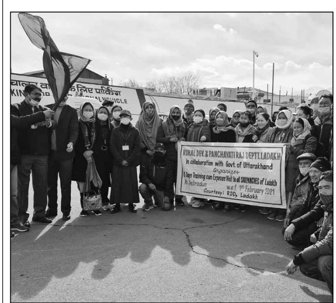
The second batch of 40 Sarpanches including 21 women Sarpanches from the Union Territory of Ladakh leaving to Uttrakhand for a five-day training cum exposure tour on The team was flagged off by Secretary, Rural Development and Panchayati Raj, Saugat Biswas.