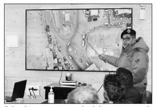
Police department giving a detailed presentation on the prevailing traffic concerns in Leh town.