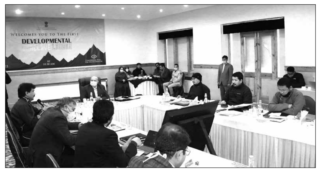
During the first Developmental Conclave to chalk out a long-term developmental plan for Ladakh.

The Department of Information and Technology aims to provide telecommunication services to the remotest areas and develop command and control centres at UT and district levels. Agriculture Department shared its action plan to increase the land under agriculture by 5% till 2026, improve food security and achieve 50 % self-sufficiency in vegetables by adopting modern techniques. Health Department, as per the action plan, aims to provide access to world-class, equitable, affordable, and quality health care service to every citizen of La-