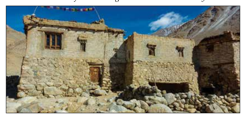
Old abandoned house of Kulum village.

Residents forced to migrate due to water scarcity