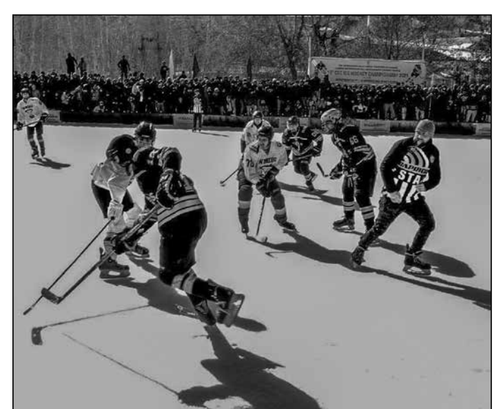
The 13th CEC Ice Hockey Cup 2021 organised by the Department of Youth Services and Sports, Kargil concluded at Ice Hockey Rink Biamathang. In the men's category, Drass Red beats Chiktan Ice Hockey while in the women's category, Chiktan Women Ice Hockey Club won over Wakha Mulbekh Club.