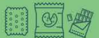
Biscuits, Snacks & Chocolates