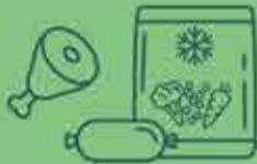
Frozen Veg & Non Veg Food