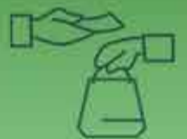
Buy & Sell