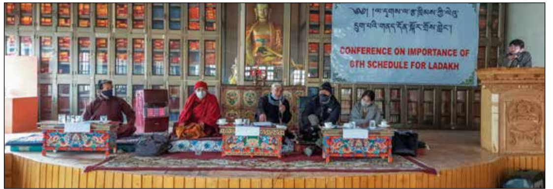
During the discussion and deliberation on the importance of 6th schedule for Ladakh at Dharma centre, Choglamsar.

"I have no personal interest and selfish intention. Even if the government offers me the post of the Governor or Ambassador, I won't accept it. I will work for the people of Ladakh and shall fight for the constitutional