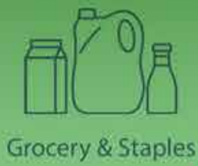
Grocery & Staples