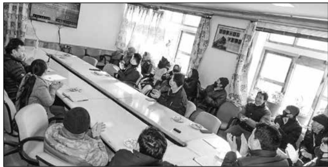
During the live programme of nationwide Pradhan Mantri Kisan Samman Nidhi (PM-KISAN) led by Prime Minister Narendra Modi.