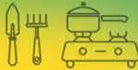
Home & Kitchen