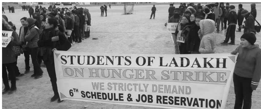
On December 12, 2019 students leading a protest demanding six schedule for Ladakh.

Union Territory status to Ladakh was welcomed by majority of Ladakhi's, celebration on the streets of Leh never sees to end but after a month, fear of jobs and land ownership knocked the minds of people. Thus, the new chapter, inclusion of Ladakh under sixth schedule of Indian constitution started. During the first anniversary celebration of UT status, MP Ladakh said that within 15 days there will be domicile law for Ladakh which was fraudulent and fictitious.