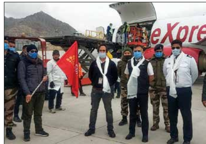
During the launch of dedicated air cargo service of SpiceJet to Ladakh