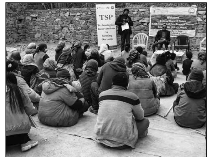
A day-long Skill Initiation Programme in the areas of "Mushroom Cultivation and Self Reliance" was organised by the Regional Research Station of ICAR-Central Arid Zone Research Institute and Krishi Vigyan Kendra of Sher-e-Kashmir University of Agriculture Sciences and Technology in Kukshow.