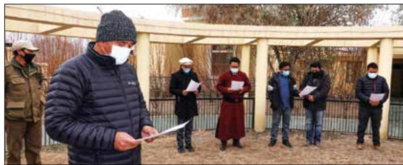
The Council members and staff of Council Secretariat while reading the Preamble of the Indian Constitution.