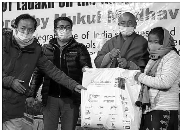
Mahabodhi International Meditation Centre organised Deepawali Celebration Kits Distribution Function at the Cultural Hall, MIMC Campus, Leh.