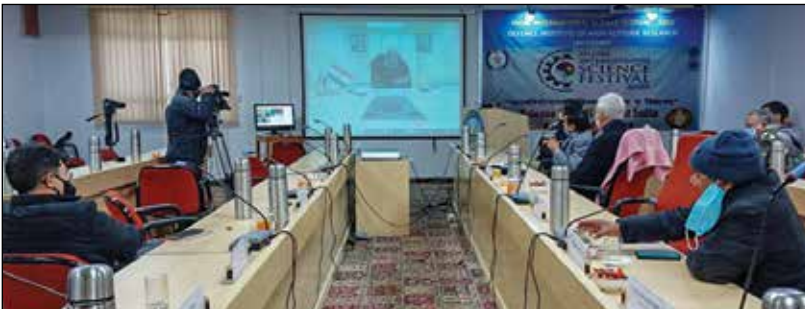
New elected Councillors of 6th LAHDC, Leh.