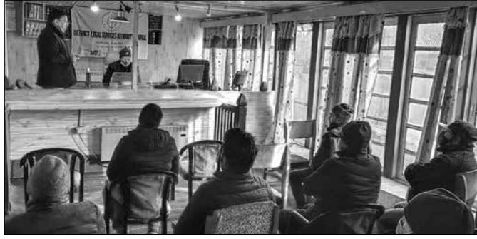
District Legal Services Authority (DLSA), Kargil while observing Communal Harmony Campaign Week.