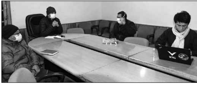
During the presentation of Hydrogen fuel cell-based bus/vehicle for passenger transportation in Leh by National Thermal Power Corporation (NTPC).