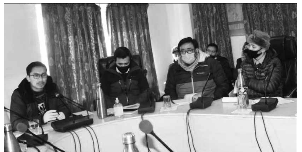
A review meeting of the District Development Coordination and Monitoring Committee (DISHA) was convened by MP Ladakh, Jamyang Tsering Namgyal in Kargil.