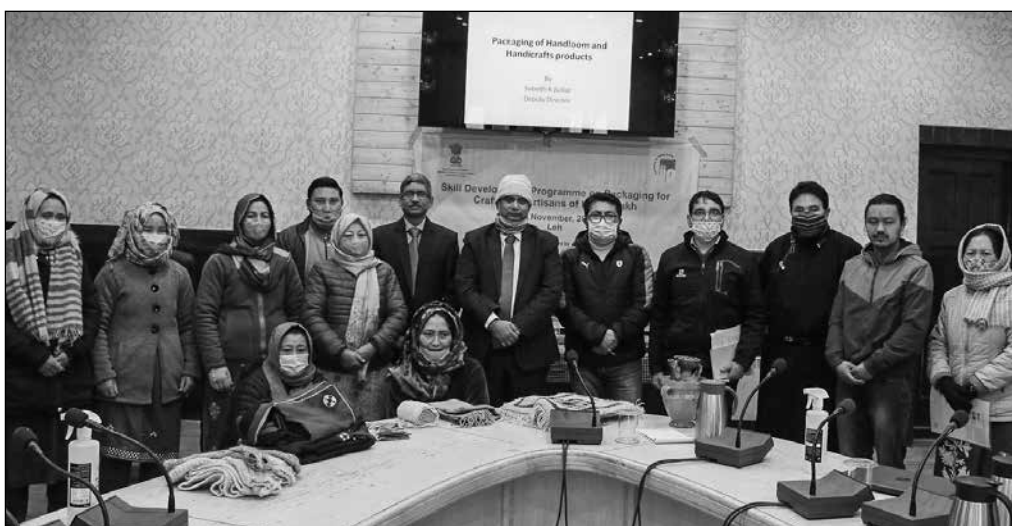
A skill development programme on Packaging for craftsman/artisan was organised by the Indian Institute of Packaging, an autonomous institute under the Ministry of Commerce and Industry, Govt. of India.