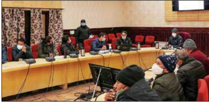
Newly elected councilors of 6th LAHDC, Leh attending the orientation course on Councillor Constituency Development Fund (CCDF) and District Capex Budget 2020-21.