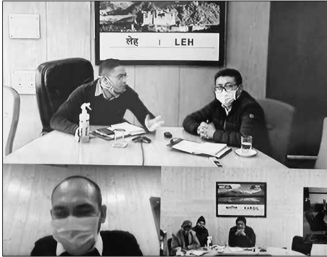
First meeting of the Publicity Committee of Tourism Department, UT Ladakh.

Intensify publicity for quality and sustainable tourism promotion, says Commissioner/Secretary Tourism