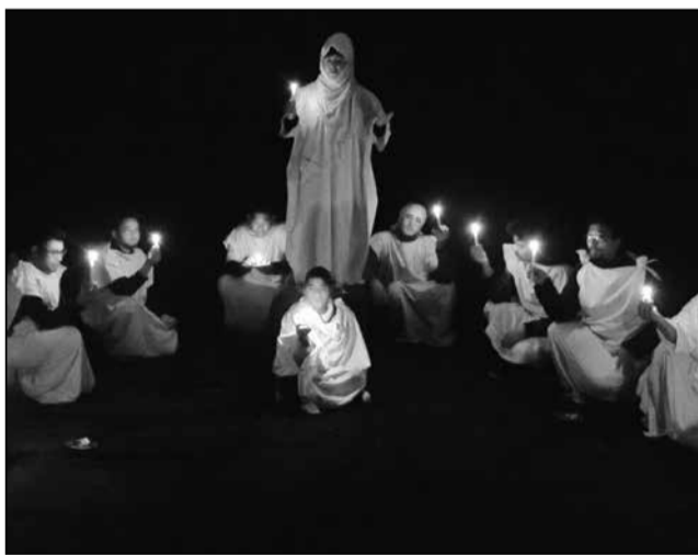
A Purgi play titled 'Rongkhang- depicting the results of goodness and sins in the afterlife' was showcased during the concluding day of the 15 days, long Play Production Oriented Theatre workshop at Language Centre, Kargil.