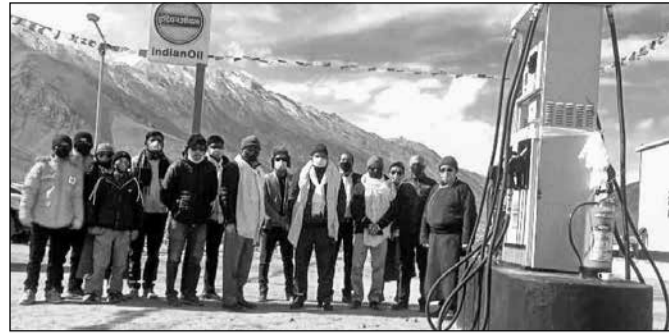
During the inauguration of First petrol pump at Stara on National Highway 301 Kargil-Padum Road.