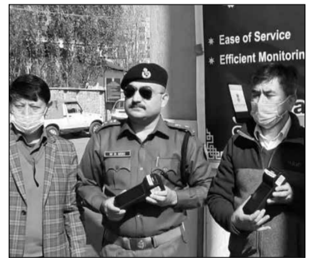
Traffic Police Ladakh launches e-challan for traffic violators. Challenged nine vehicles under different MV Act violations during the launch of the e-challan system in Leh.