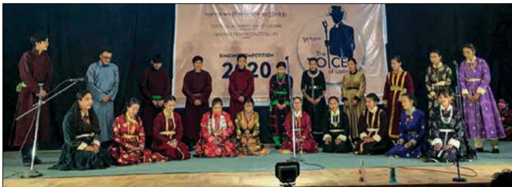
Students during the singing competition organised by Cultural Academy, Leh.