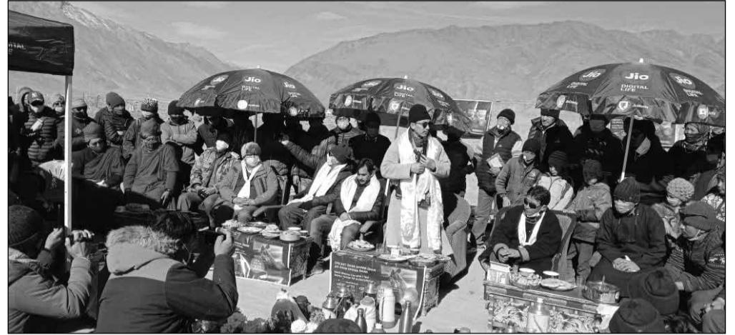
Member Parliament Ladakh, Jamyang Tsering Namgyal during the inauguration of four new Jio mobile towers at Pibiting, Zanskar.