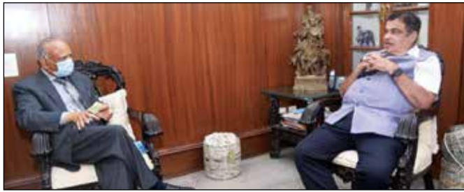
Lieutenant Governor, R K Mathur with Union Minister for Road Transport & Highways, Nitin Gadkari.