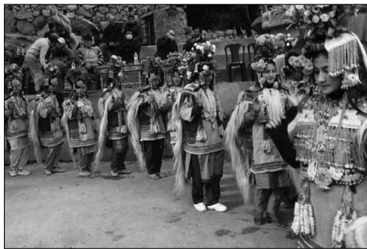
A five day long Bonona-Mega Harvest Festival or 'Chhopo Srubla' concluded at Garkone, Lchangrah.