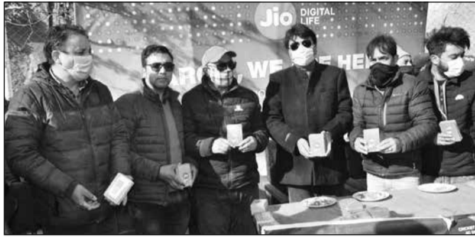
During the inauguration of five Jio 4G mobile towers sanctioned under the Universal Service Obligation Fund (USOF) in Suru valley.