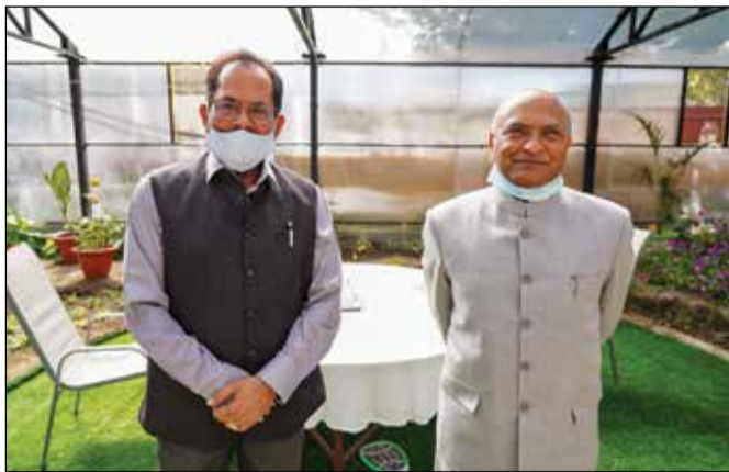
Lieutenant Governor R K Mathur with Mukhtar Abbas Naqvi, Union Minister for Minority Affairs.