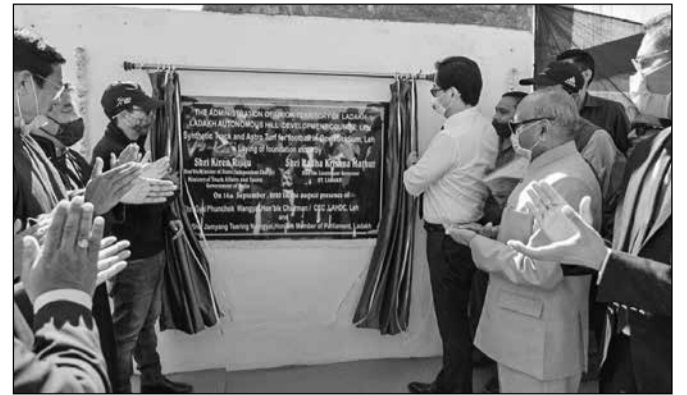
Kiren Rijju, Union Minister of State, Ministry of Youth Affairs in presence of Lieutenant Governor; R K Mathur during the foundation stone laying ceremony of synthetic track and AstroTurf for football in Leh.

Talking about Fit India Movement initiated by PM Modi, he stressed the need to raise awareness in society on sports for fitness and developing a sports