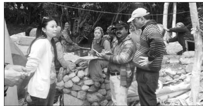
Team of CAZRI interacting with self help group in Umla village about Promoting Roasted barley.