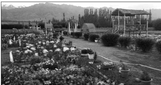
Promoting Floriculture: Flower farm in Thiksey Leh Ladakh