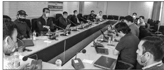
Training programme on Employees Information System (EIS) component of the Public Financial Management System (PFMS) in Kargil.