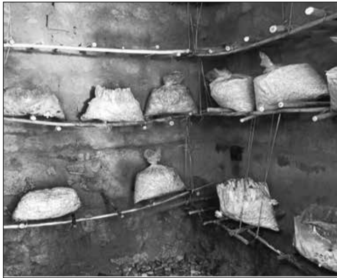
Mushroom cellar constructed on trial basis using local resources.

Mushrooms are so wonderful that my curiosity urged me to do a SWOT Analysis on mushroom cultivation in Ladakh. My analysis gave me more clarity and confidence about why, how and from where