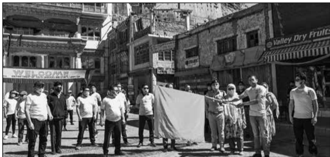
Deputy Commissioner Leh, Sachin Kumar Vaishya flagging off one-day Fit India Freedom Run at Main market, Leh