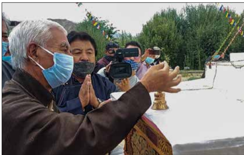
Former, MP Thupstan Chhewang lighting the butter lamp during the observation of 31st Martyr's day at Memorial park, Skyatsags.