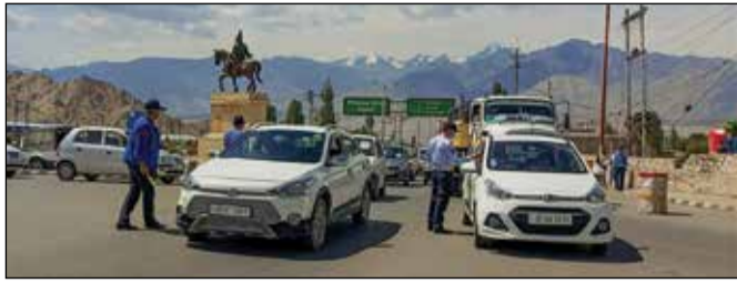
Ladakh Traffic cops distributing pamphlets to the motorists at Petrol pump chowk.