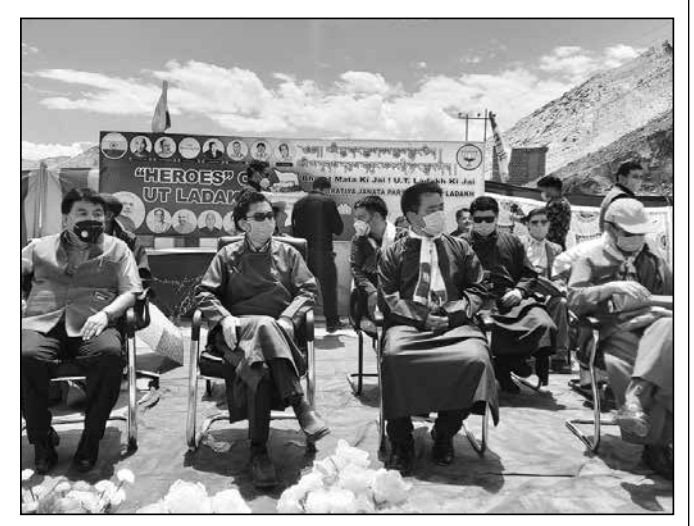
Bharatiya Janata Party, Leh celebrating first anniversary of UT Ladakh.