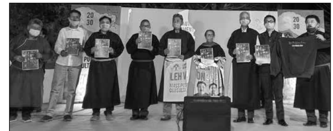
Declaring the mass public consultation campaign for Leh Vision Document 2030 open

"We have around 7-8 Master Plans gathering dust because they were not implementable. What we need is an implementable Vision Document. The government officials should