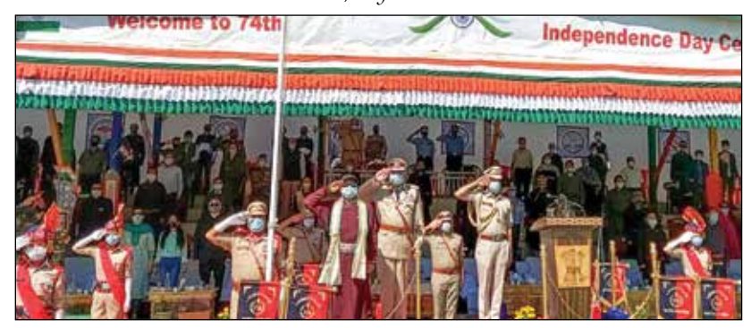
R K Mathur, Lieutenant Governor saluting the national flag at Pologround Leh, Ladakh

As UT, it marks the beginning of a new era of growth & support from the Union Govt, says L-G Mathur