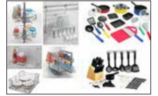
Home & Kitchen