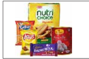
Biscuits, Snacks & Chocolates