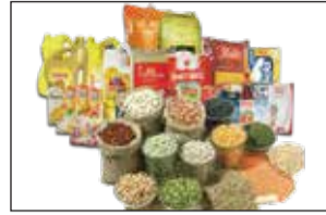
Grocery & Staples

Priority delivery for people in home quarantine