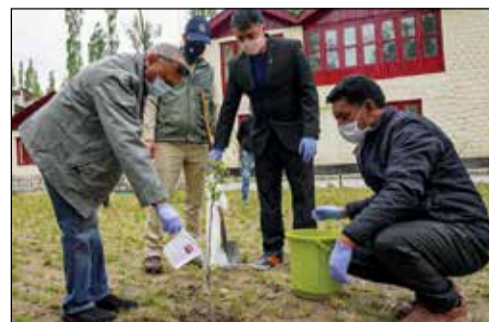
Lieutenant Governor, R K Mathur planting an apple sapling at Raj Niwas on World Environment day.

Appeals people of Ladakh to nurture the nature