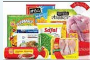
Veg & non-Veg frozen food