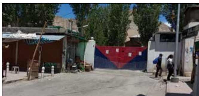
ITBF Officers Mess, near Moti Market contained by District administration, Leh.

Administration remains silent on the issue