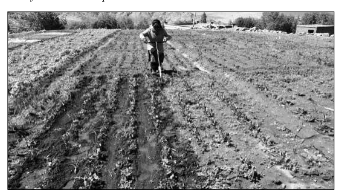
Line sown crop facilitate weed control using hand hoe

Solanaceous vegetables may be followed by leguminous vegetables, amaranth to avoid soil-borne diseases. According to IPCC (1995), the years have noticed warmer over the last few decades. Due to biotic and abiotic stress, insects are being observed in all the crops/vegetables, forest trees, orchards, etc. Under the changing climate, there may be insect problems in future. Instead of using pesticides, use of light traps in apple and apricot orchards has been very useful and significant, controlling the further spread and commencement of problematic insects and reproduction.