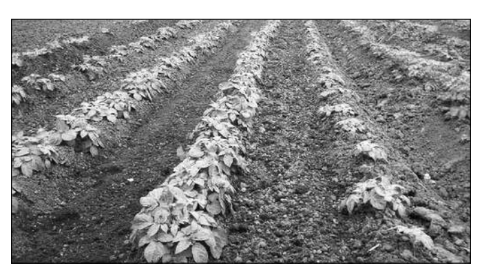
Line planted potato with earthing-up improves tuber yield

Integrated pest management and use of light traps: Vegetables are fast-growing succulent plants, and are generally affected by some pests, diseases and especially weeds on which they hibernate and spread on succulent ones. Continuous cultivation on the same patch of land reduces soil productivity and result in low yields. On the other hand, pose susceptibility to biotic and abiotic stresses. For the purpose,