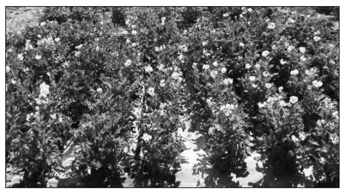
Use of black mulch in potato