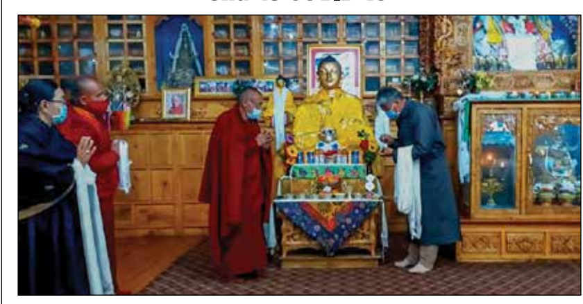
President LBA and LGA paying tribute to the Lord Buddha on Buddha Jayanti at Chowkhang