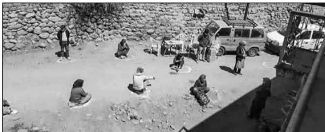
Labourers waiting their turn to get free ration provided by the administration.