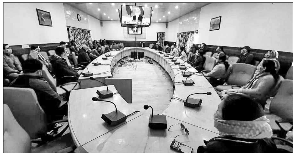
PM Modi interacting with the Sarpanches and village heads via Video Conferencing. Greets people of the nation on the occasion of National Panchayati Raj Day on April 24 and also launched e-gram Swaraj portal.