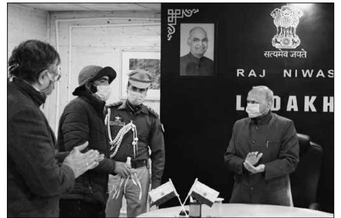
R.K. Mathur, Lieutenant Governor of Ladakh donating cotton masks to migrant labourers from Doda district working in Ladakh

Lt. Governor said that masks will be provided to the needy beneficiaries in keeping with the Prime Minister's advice to all the citizens of the country to wear masks at all times as a precautionary measure against the spread of novel coronavirus. He also exhorted all the people