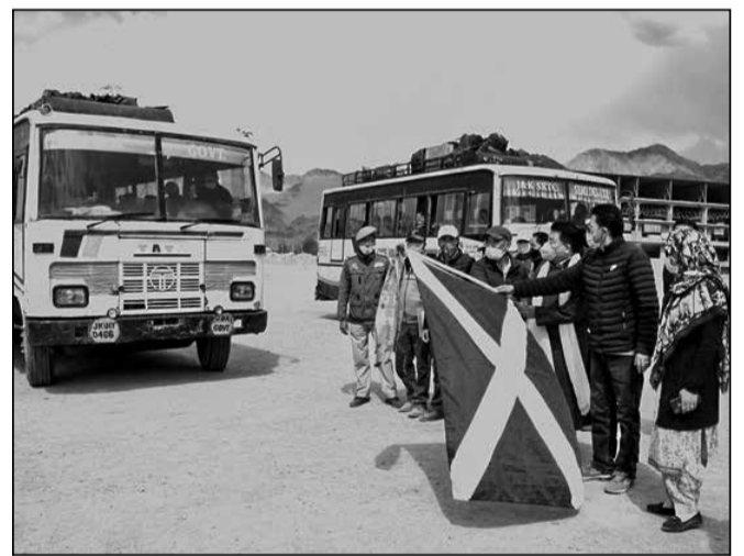
Gyal P. Wangyal, CEC, Hill Council, Leh on April 27 flagging-off four SRTC Buses from NDS Stadium Leh carrying 100 stranded passengers of Zaskar region to Zaskar who were stranded in Leh due to lockdown.