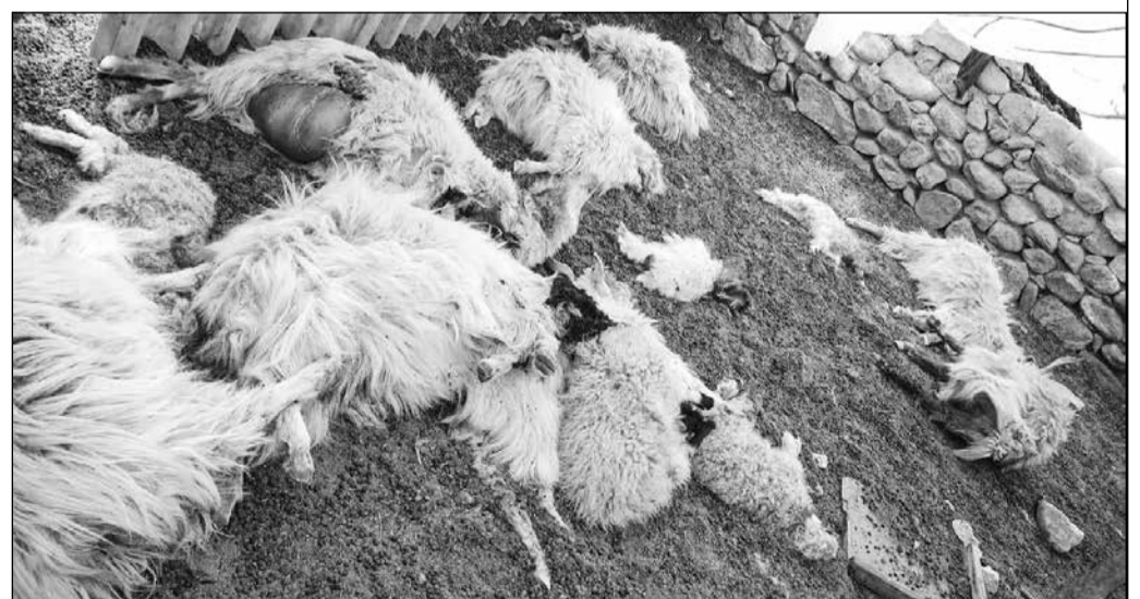
Killed sheep and pashmina goats at Yourgo village.