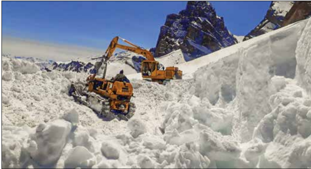
Snow clearance work going on at Singge-La pass