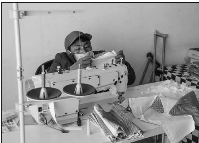
All Ladakh Tour Operators Association (ALTOA) in collaboration with Peoples Action Group for Inclusive Rights (PAGIR) stitches masks for the administration of the Union Territory of Ladakh.