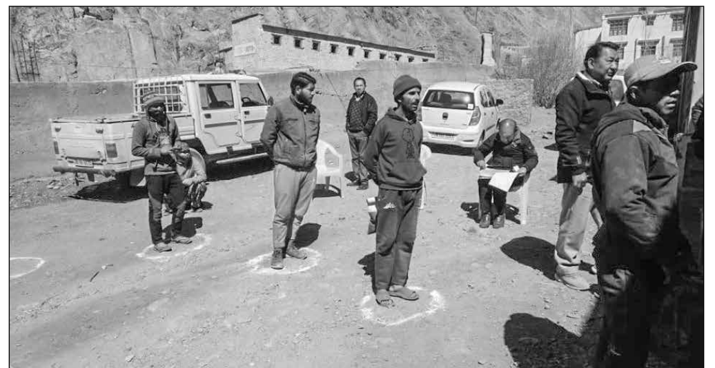
Migrant labours in Leh district waiting for their share of free ration provided by District administration, Leh.