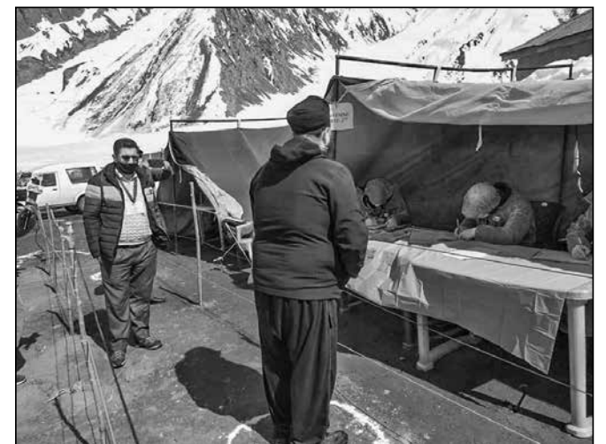
Screening of drivers and supporting staff of oil tankers before reaching Kargil. Oil tankers of Indian Oil Corporation Limited (IOCL) crossed Zojila amidst strict observance of Standard Operating Procedures (SOPs) and conditions issued by the UT Administration.