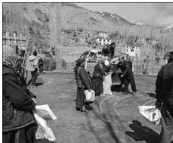
Distribution of ration to the ration card holders of Antyodaya Ann Yojana (AAY), BPL and Priority Households (PHH) in Khalise, Skindyang and Tia village under Pradhan Mantri Garib Kalyan Yojana (PMGKY).