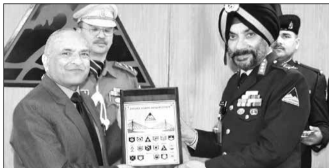
Reach Ladakh Correspondent

Stresses opening of Shinkula pass and Zojila tunnel on priority basis