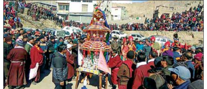
People witnessing the ceremonial burning of ritual effigy, symbolizing driving away of evil spirits and to bring peace and prosperity in the region.