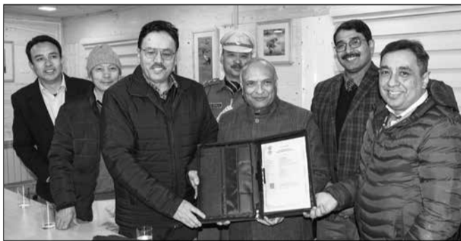
During the launch of Online Stamp Duty Administration System in Ladakh.