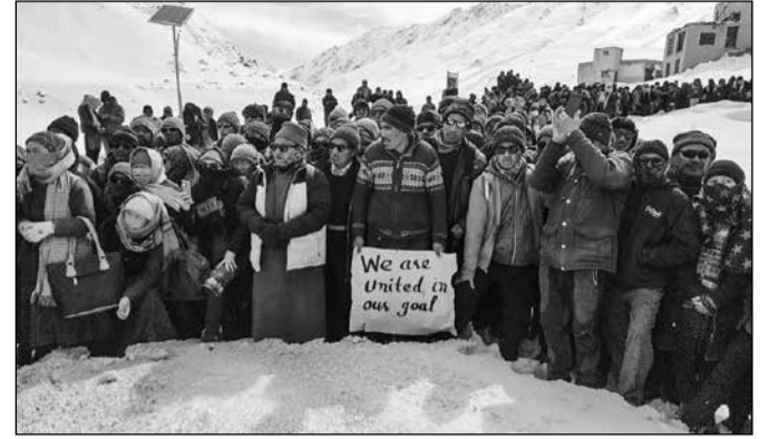
People of Zanskar during the peace protest rally demanding basic amenities.

Youth Wing, Zanskar stressed on the need of basic amenities to the people of Zanskar. He appraised Area Development Officer about the absence of medical aid centre at Ralaking, Zanskar.