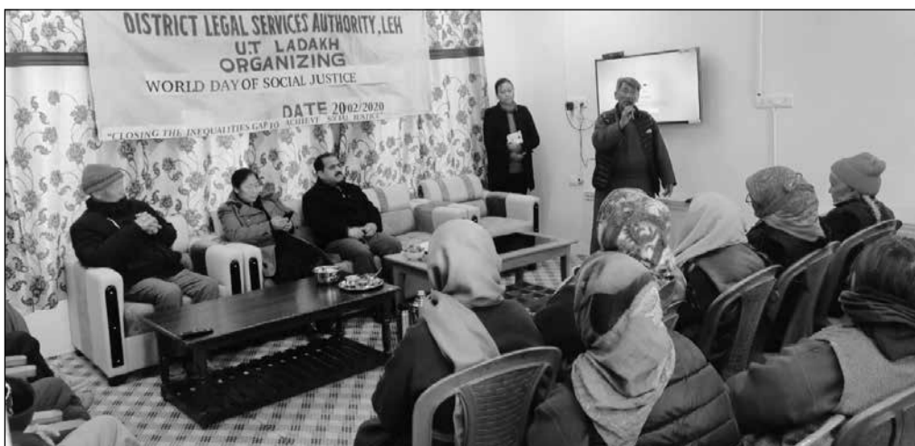
District Legal Services Authority celebrated "World Day of social justice" themed "Closing the inequalities gap to achieve Social Justice" in Leh.