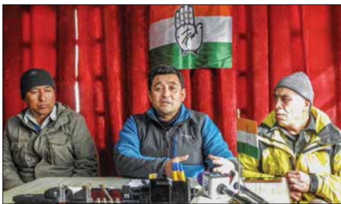
Tsering Namgyal, President, District Congress Committee, Leh addressing a press conference at party office.

Blames them for not talking about 6th Schedule and misusing the platform for political gains