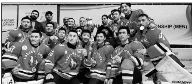
Players of Ladakh Scout Regiment after winning 9th National Ice Hockey championship

NEW DELHI: Army Red team represented by players of Ladakh Scout Regiment won 9th Na-