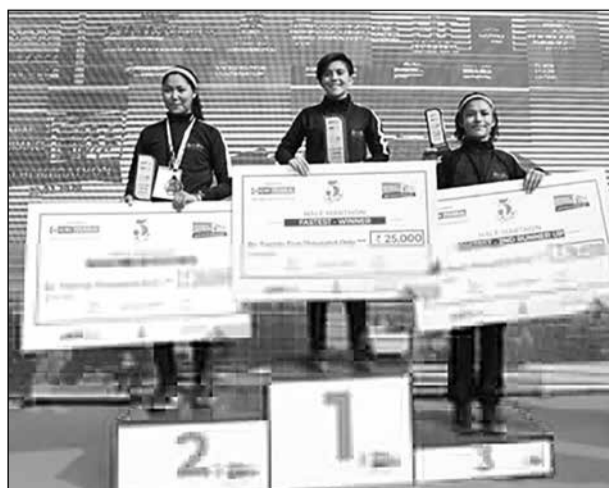
Half marathon winners in the fifth edition of the IDBI Federal Life Insurance, New Delhi marathon.

Ladakh Marathon was started in 2012 giving ample of opportunities and scopes to young athletes of Ladakh to participate in number of marathon taking place around the country.