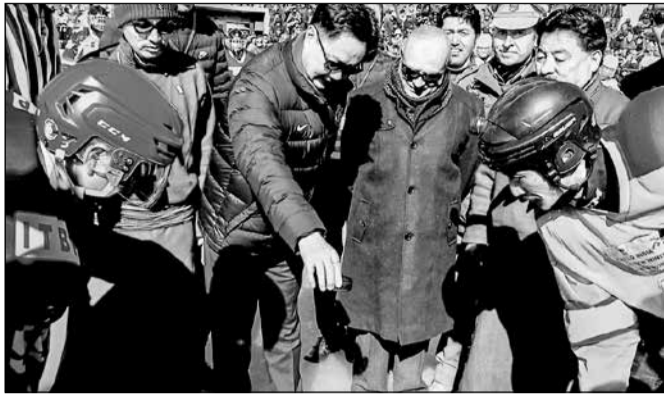
Kiren Rijiju, Union Minister for Youth Affairs and Sports throwing puck, declaring first Khelo India Ladakh Winter Games, 2020 open.

Addressing the gathering, Kiren Rijiju appreciated the skill of the players and expressed the importance of having proper infrastructure to take ice hockey at the next level. He said that the ministry will work on developing standard infrastructure facilities to all the talented players. He also stressed on exploring and