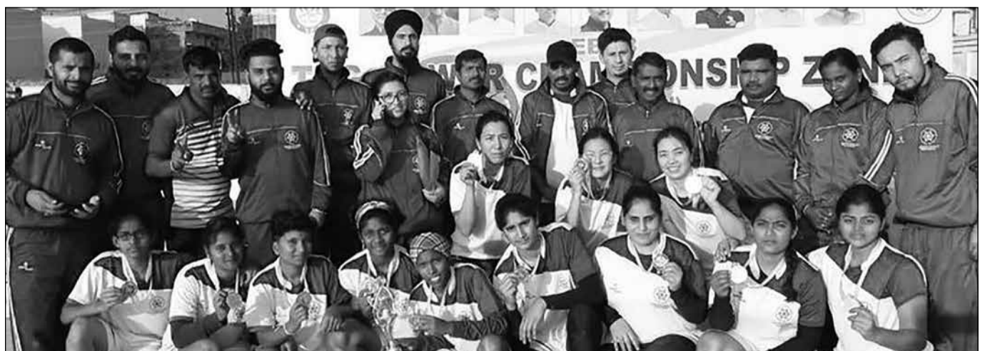
Team Ladakh paired with J&K and Tamil Nadu wins silver medal in 'Ek Bharat Shreshtha Bharat Tug of War National Integration Championship' (Men & Women) Zone-3. The championship was organised by the Tug of War Federation of India in collaboration with the Department of Sports, Ministry of Youth Affairs & Sports.