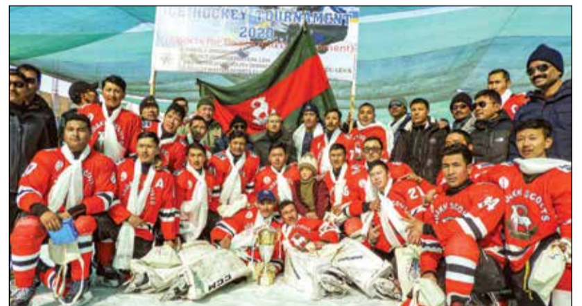
Ladakh Scout Regimental Centre Red team winner of the first Khelo India Ice hockey tournament 2020 trophy.