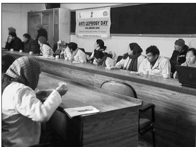
Spreading awareness to make Ladakh free from Leprosy disease, 'Sparsh Leprosy Awareness Campaign' was launched on Anti-Leprosy Day at Chief Medical Officer, Leh. The awareness campaign will be carried out in the whole district until February 28.