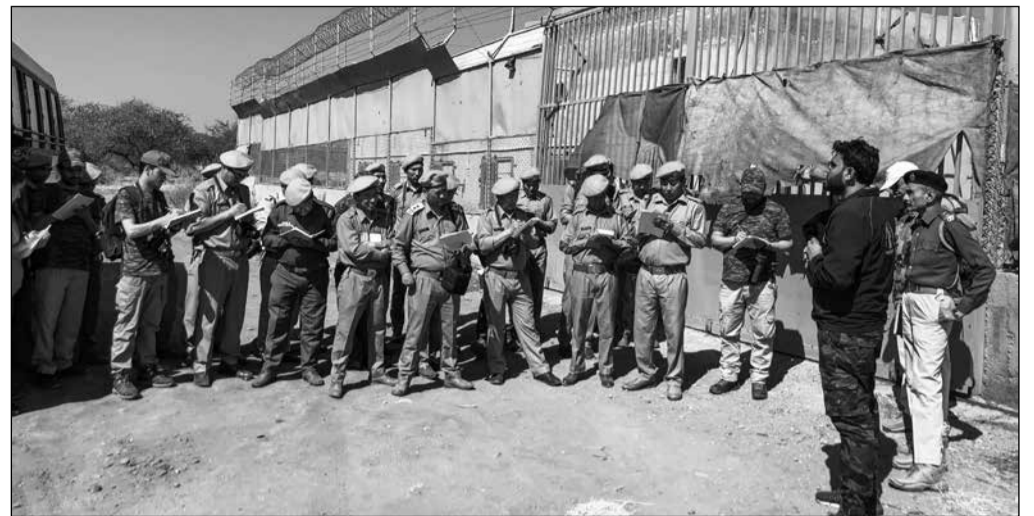
Frontline staff of the wildlife department, Ladakh during the four-day training workshop at Gir National Park, Sasan-Gir, Gujarat.