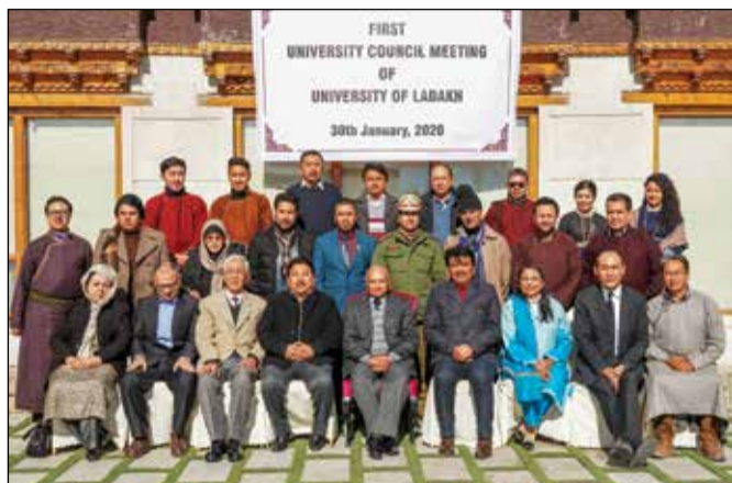
During the first University council meeting of Ladakh University.

Aims at making the university a high- standard institution