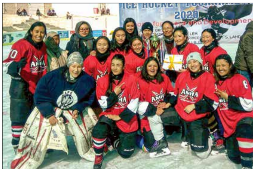
Team Ice Hawk winner of the First Khelo India Ice hockey tournament 2020, women section.

Team Ice Hawk beat Ladakh Women Ice Hockey Foundation by 3-2 goals