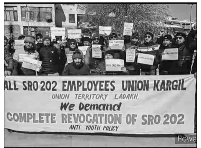
Employees recruited under Special Recruitment Rule SRO -202 staged a protest in Kargil demanding Administration of Union Territory of Ladakh to abolish SRO 202 completely and avail all allowances that are available to other employees of UT Ladakh.