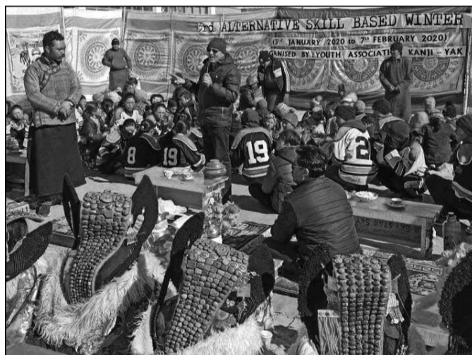
Youth Association Kanji (YAK) organised 3rd alternative skill-based winter camp in Kanji for 35 days focusing on four major sectors such as Games & Sports, Design & Creativity, Tradition & Culture and IT & Technology.