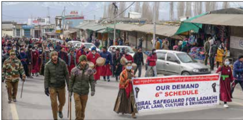
A peaceful procession demanding sixth schedule for Ladakh.

Sarpanches and nambardars extend support