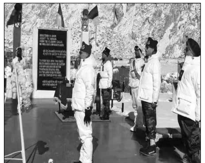
Army Chief General Manoj Mukund Naravane paying tribute at war memorial, Siachen during his first visit after assuming office.