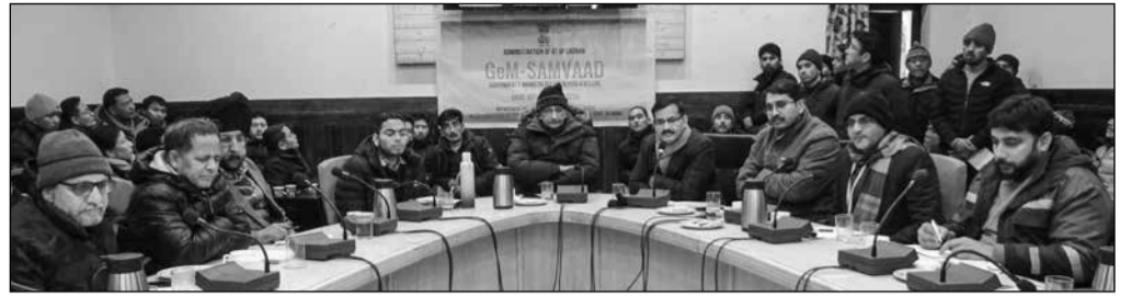
During the launch of Government e-Marketplace (GeM) Samvaad at DC Conference Hall Leh.