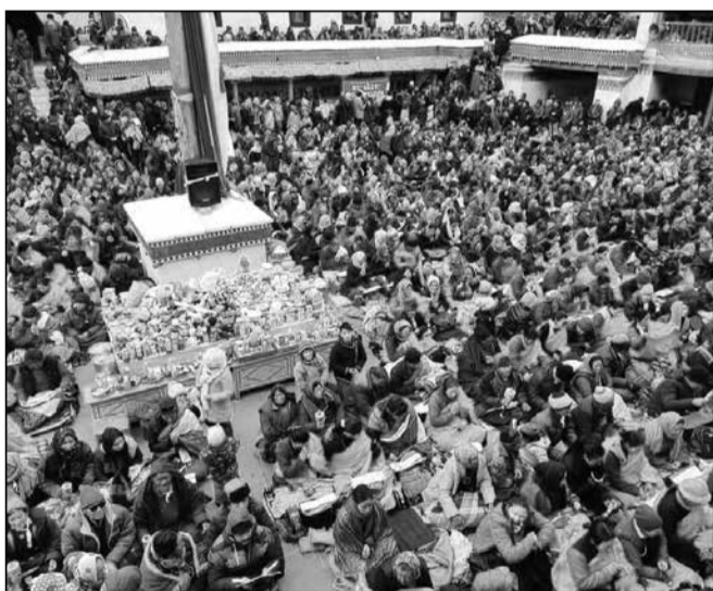
Devotees during the Winter Hemis Festival lead by His Holiness Drukpa Rinpoche at Hemis monastery.