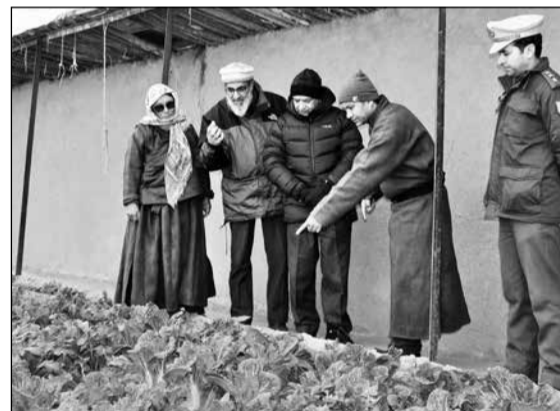
Lieutenant Governor, RK Mathur during his visit to SKUAST-K in Stakna.

Appreciates its extensive work of research and training programmes