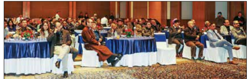
R.K. Mathur and delegates of Ladakh during inaugural of Ladakh Pavilion.