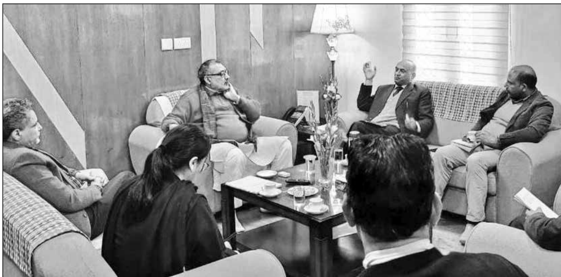
Lieutenant Governor, Radha Krishna Mathur discusses animal husbandry and fisheries scopes and issues in Ladakh with Giriraj Singh, Minister for Animal husbandry, Dairying and Fisheries.