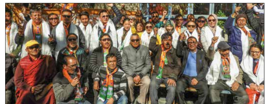
Newly elected BDC chairperson along with the party members at BJP office Leh.