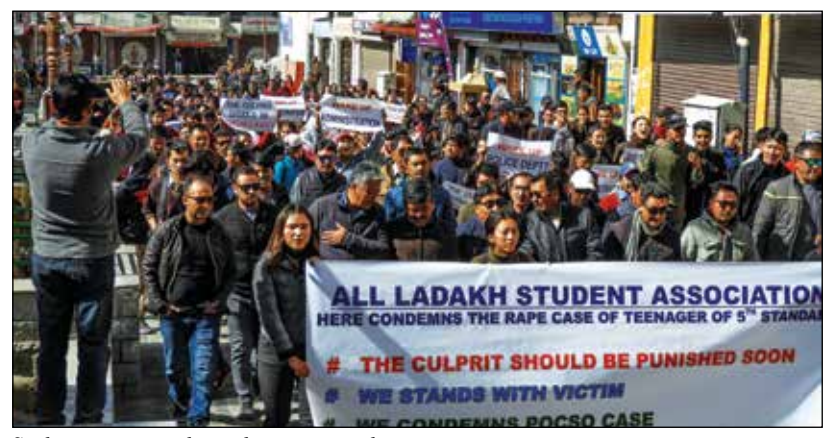
Students protesting demanding justice to the victim.

Students' association rallies, seeks justice