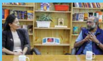
Guest: Ashish Kothari, Environmentalist

Reach Ladakh's show 'The Reality' Episode # 3 will be releasing on 5th October (Saturday) in between 5:00 - 6:00pm on 'Reach Ladakh' Youtube channel.