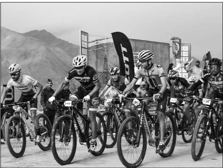
The North Quest Challenge, the world's highest accredited MTB XCM race, kicked off with a total participant of 80 riders including 37 in elite category and 43 in the amateur category in Stage 1 starting from Spituk-Choglamsar road near Hotel Dewachan on September 21.