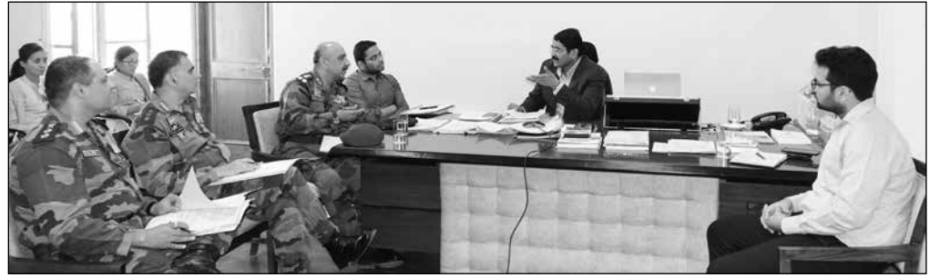
Saugat Biswas, Divisional Commissioner Ladakh chairing the civil-military liaison meet