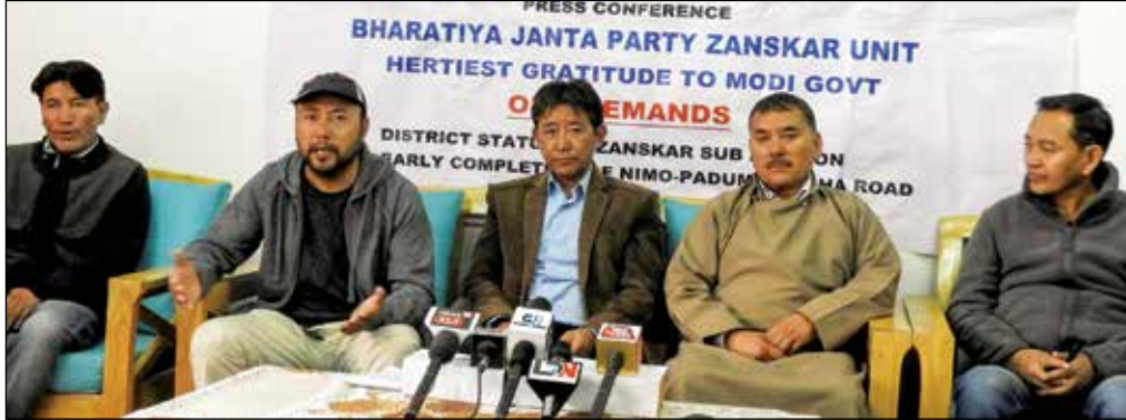
Members of the Bharatiya Janta Party, Zanskar during the press conference in Leh.