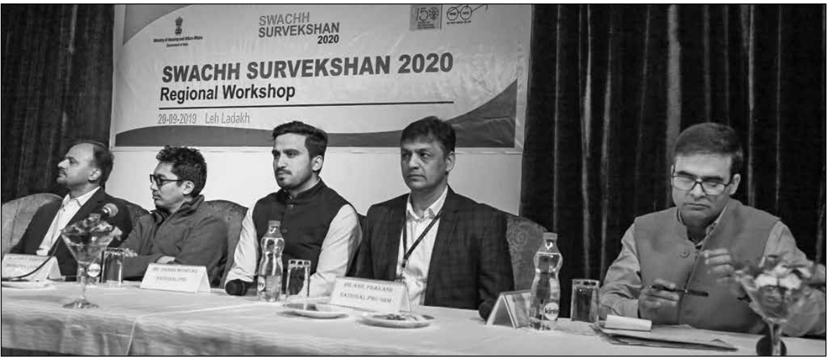
Jamyang Tsering Namgyal, MP Ladakh chairing the inaugural session of Swachh Sarvekshan, 2020 workshop as the chief guest on the occasion at Grand Dragon Hotel, Leh.