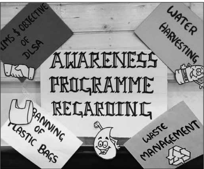
District Legal Service Authority (DLSA), Leh in collaboration with district administration Leh conducted awareness programme to highlight the aims and objectives of DLSA, besides spreading awareness about some of the alarming environmental issues faced by people in the district.