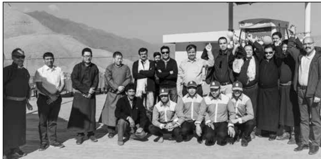
The fuel station is situated adjacent to Magnetic Hill and is part of the 2.5-acre complex in which company's mini POL depot shall be constructed.