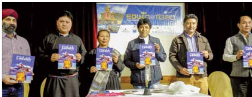
Dignitaries launching the Reach Ladakh Travel and Business Magazine in Leh

Launches first edition of Reach Ladakh travel and business magazine