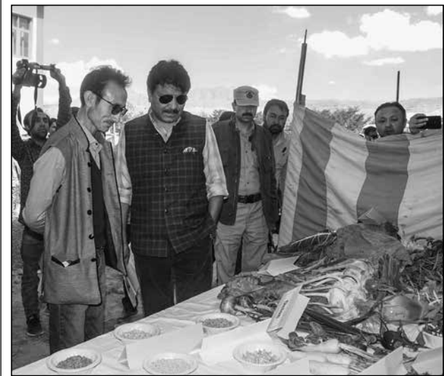
KVK Kargil organises mela cum method demonstration on water conservation under Jal Shakti Abhiyan on September 15.

I hope such awards shall push forward people to work for a good cause and honesty in future as well. Highlighting such people also plays a big role. I am very thankful to Reach Ladakh for giving me this special place in your newspaper. This will encourage many others to work with a selfless attitude and a clear conscience.